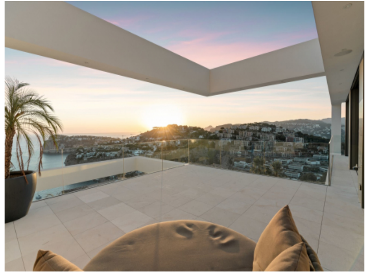
Modern designer villa close to the Cala Llamp