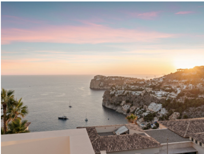
Unique mediterranean sea views