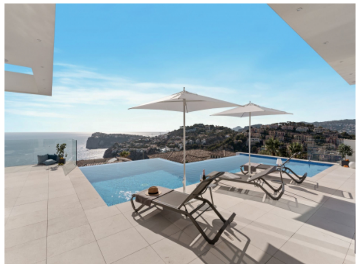
Terrace with sea views