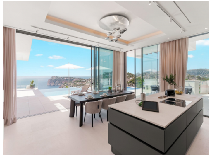
Kitchen with cooking island