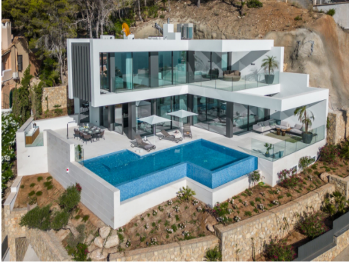
Modern designer villa