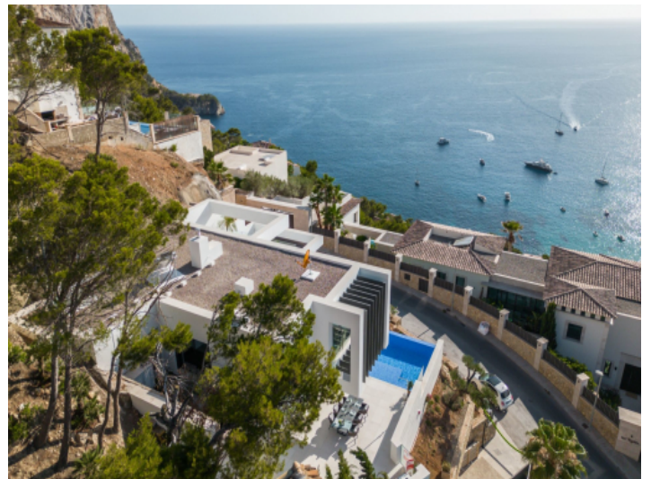
Bird's eye views to the villa and the sea