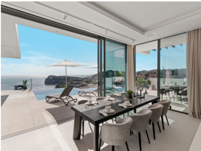
Dining area with balcony access