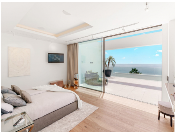
Bedroom with balcony