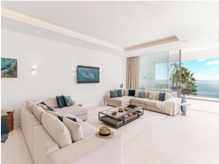
Luxury living area