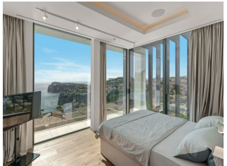
Bedroom with floor-to-ceiling windows