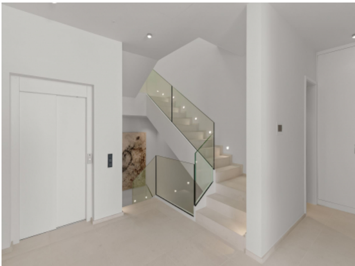
Floor with lift