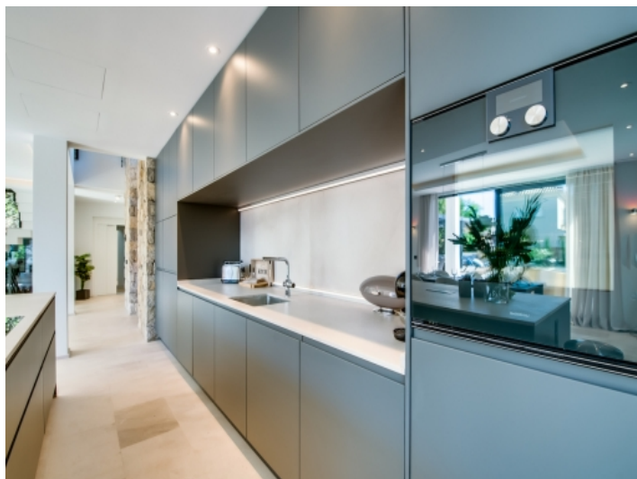
Alternative view of the kitchen