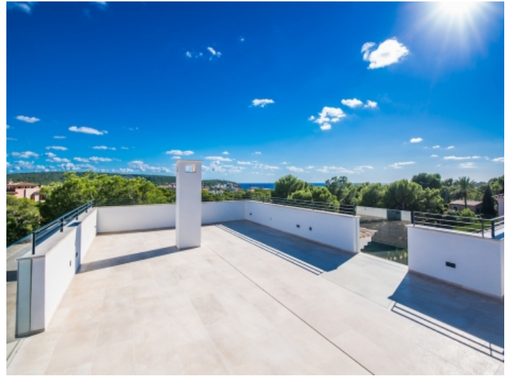
Splendid roof terrace