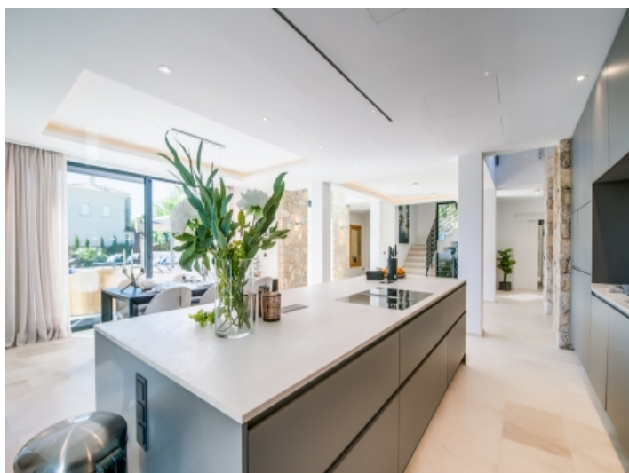
Fantastic cooking island of the kitchen