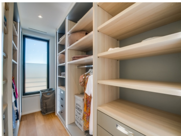
Practical walk-in closet