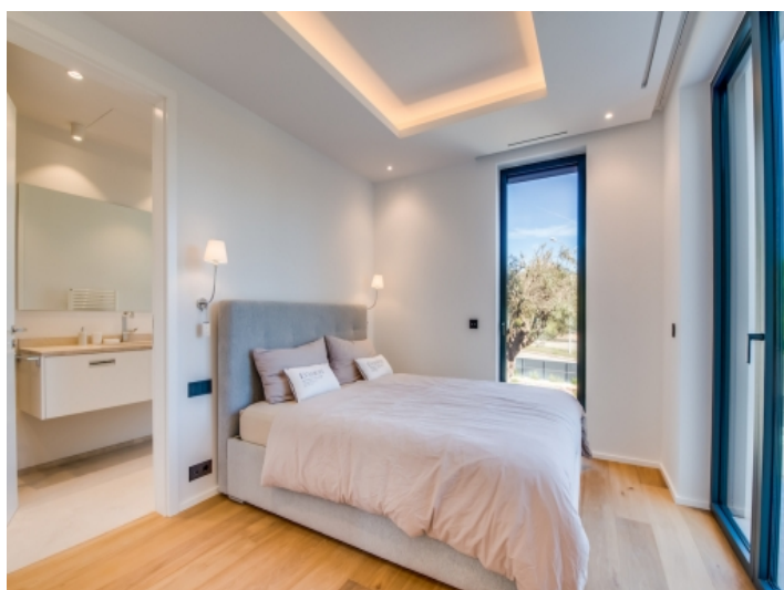
Second double bedroom