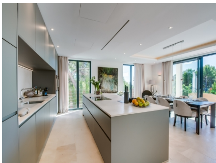
Alternative view of the kitchen