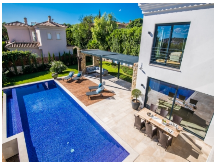
View to the pool area