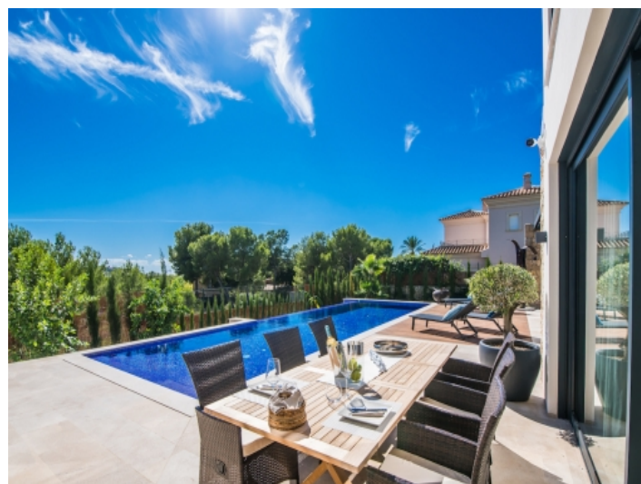
Dining area by the pool