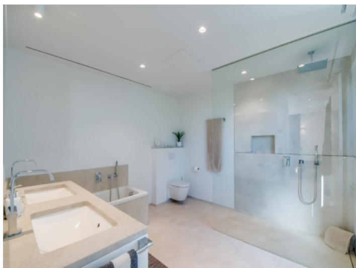
Bathroom with bath tub