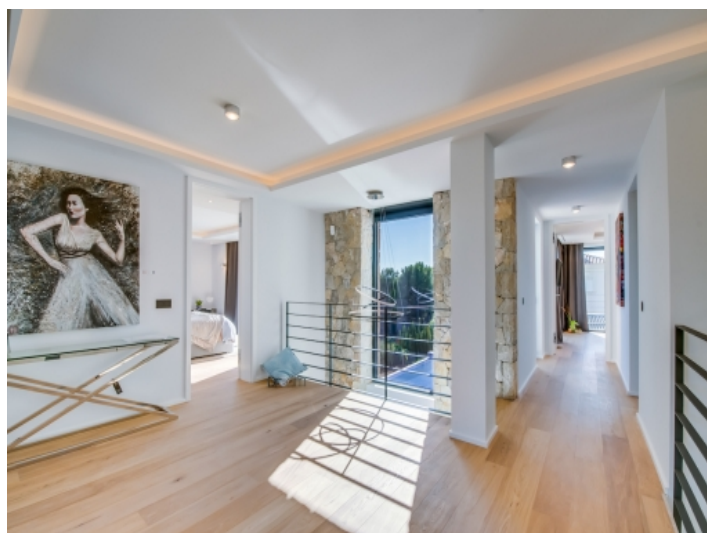
Stylish upper floor