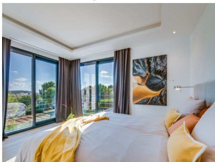
Bedroom with a view