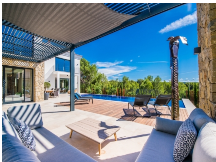
Covered chill out area