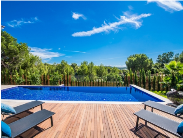
Sunny pool area with sun loungers