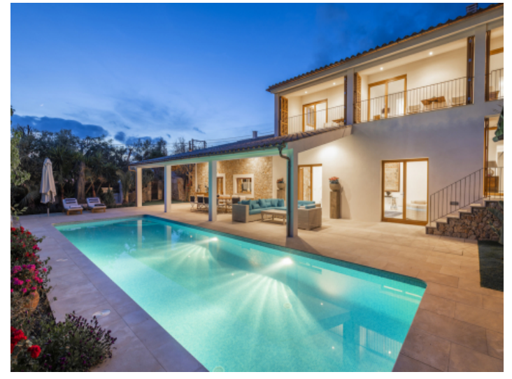
The pool by night