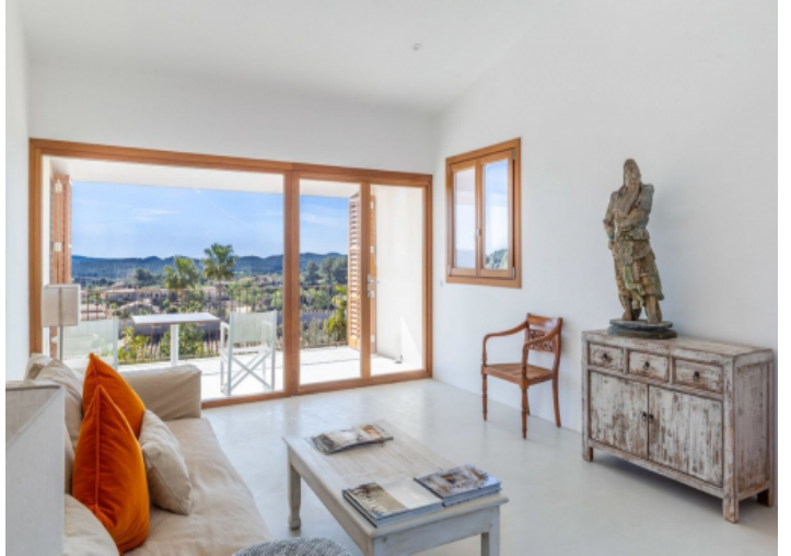
Separate living area