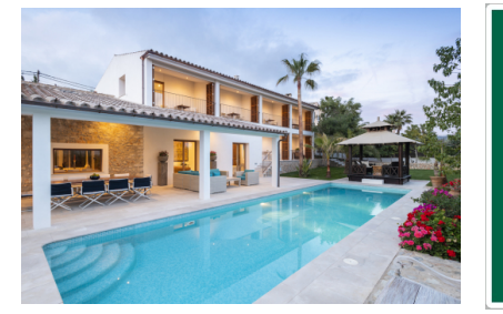
Calvia search for property MAL-116142