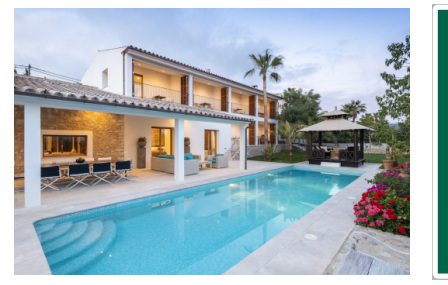
Calvia search for property MAL-116142