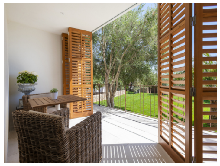
Access to the garden

PORTA MALLORQUINA • C./ COLOM 20 2°, 07001 PALMA, SPAIN TEL.: +34 971 698 242 • INFO@PORTAMALLORQUINA.COM • WWW.PORTAMALLORQUINA.COM