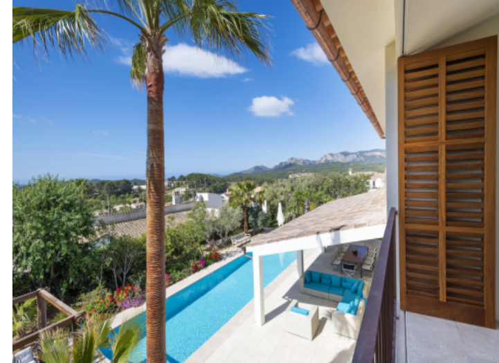
Pool view from the balcony