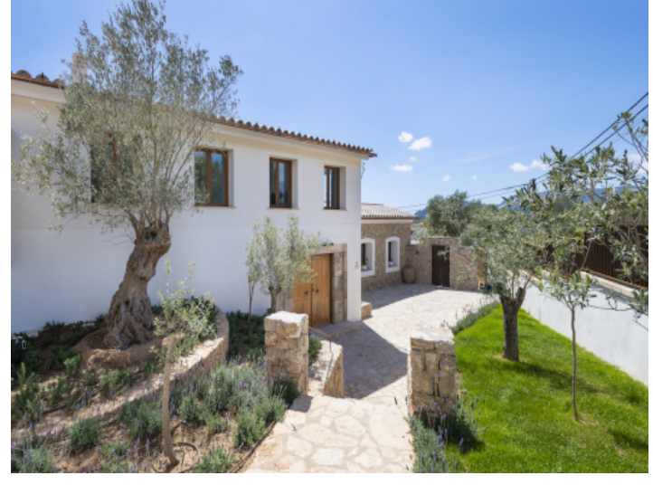
Access and entrance area

PORTA MALLORQUINA • C./ COLOM 20 2°, 07001 PALMA, SPAIN TEL.: +34 971 698 242 • INFO@PORTAMALLORQUINA.COM • WWW.PORTAMALLORQUINA.COM