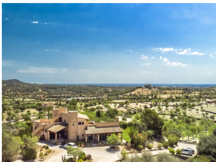
Driveway and front view of the finca