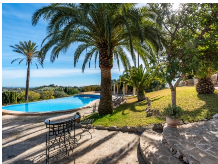
Pool with palm trees and a view