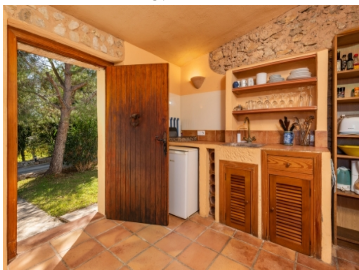
Entrance and small kitchen