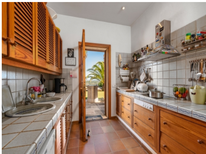
Kitchen with access to the outside