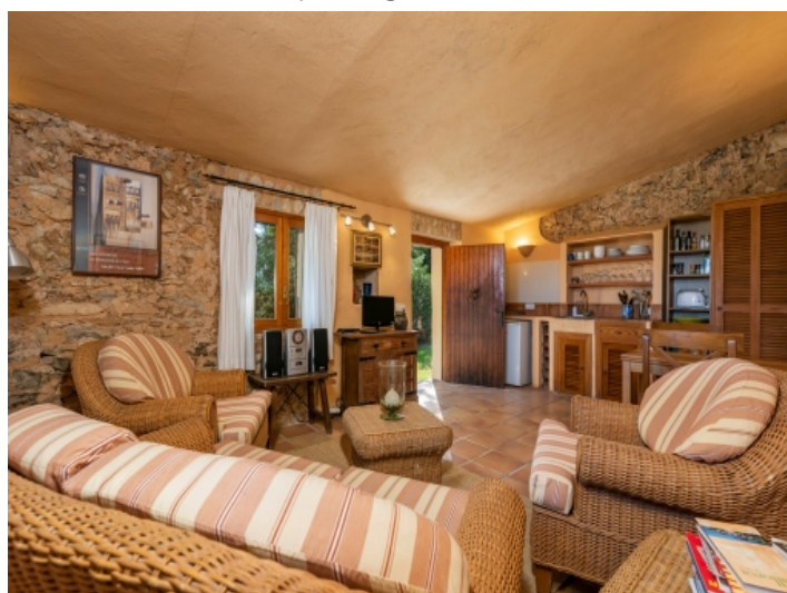
Cozy living room