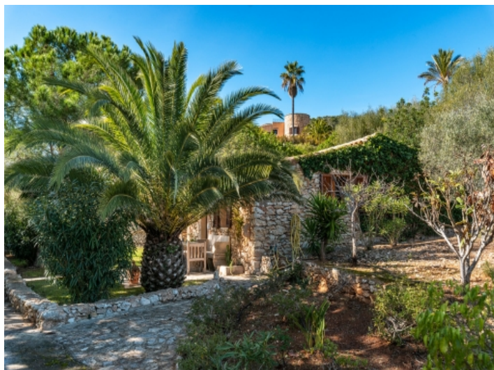
Stone-clad guest house