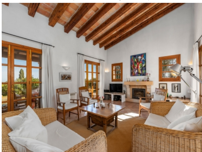
Living area with fireplace and wooden ceiling beams