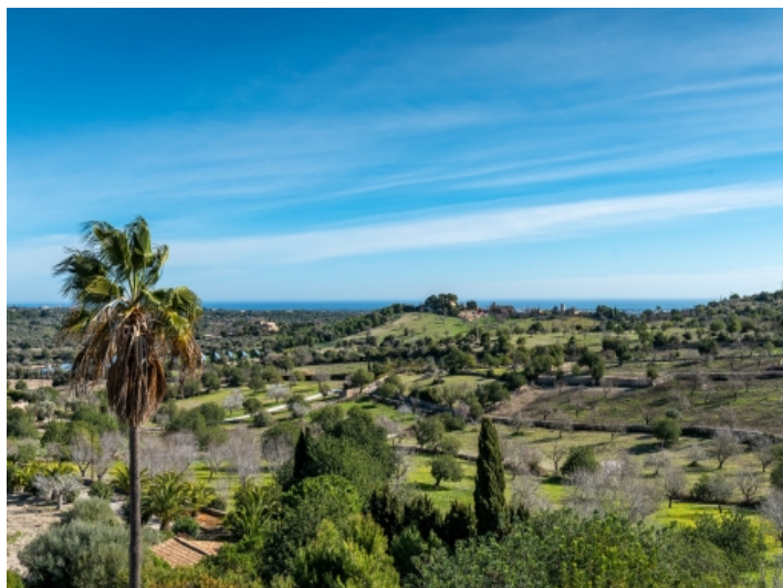
Picturesque surrounding landscape