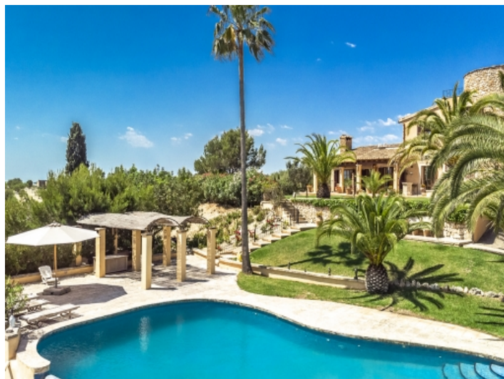
Mediterranean pool oasis