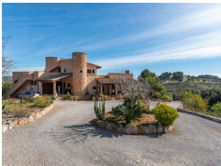
Driveway to the finca