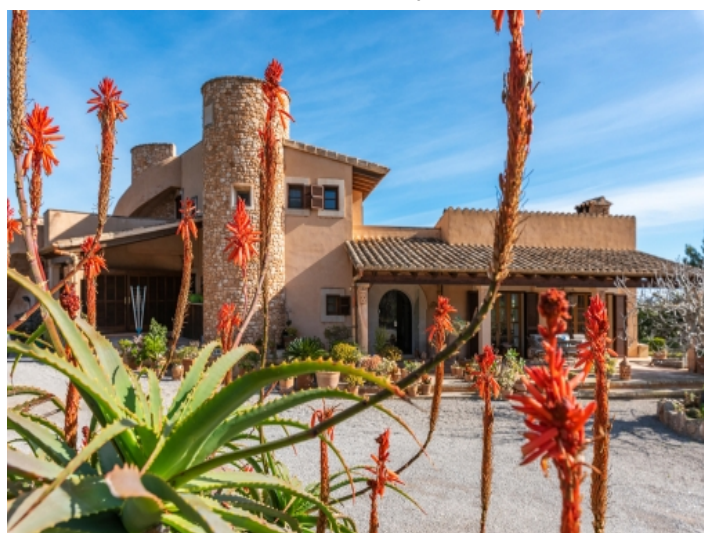
Front view and access