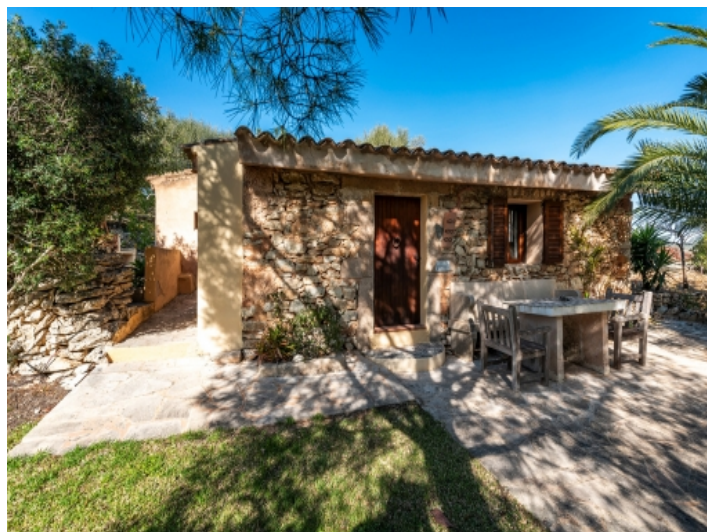
Separate guest house