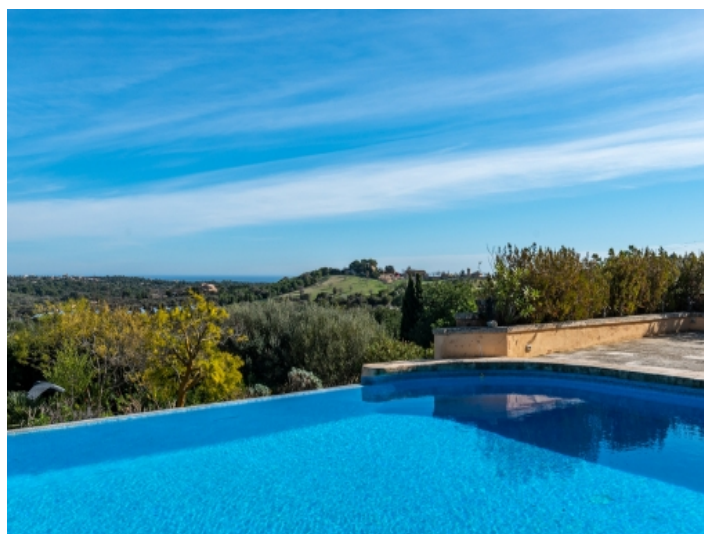
View from the pool