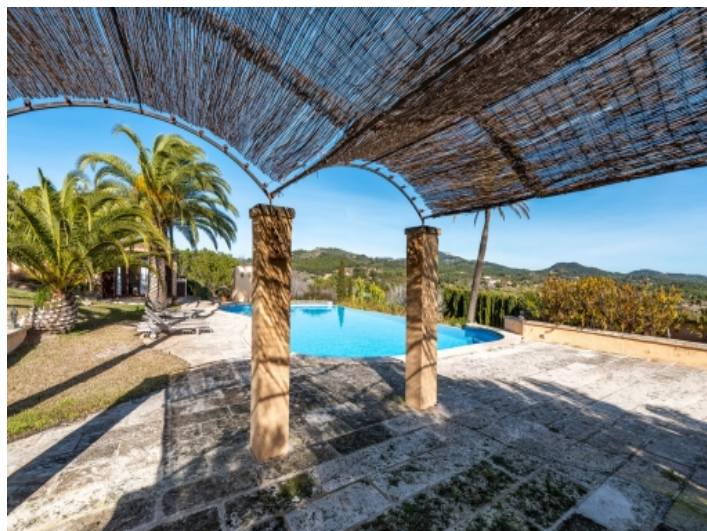
Covered pool terrace