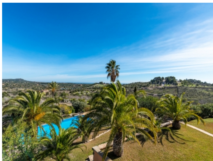
Dreamlike sweeping views