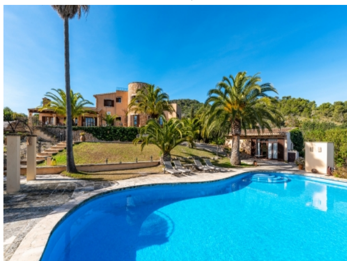
Large, tranquil pool area