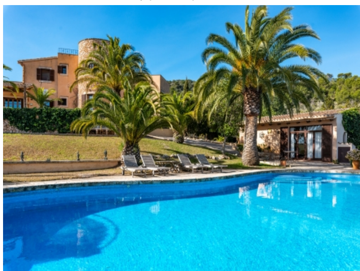
Finca, guest house and pool