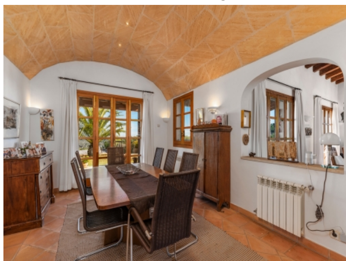
Dining area with vaulted stone ceiling