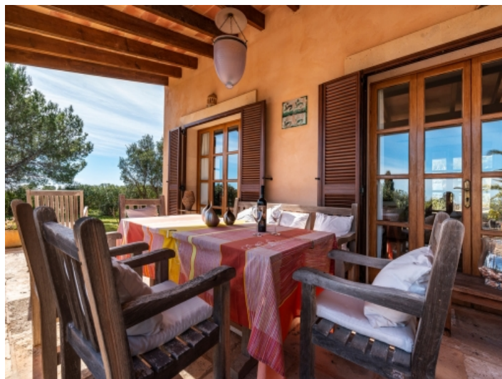
Covered outdoor dining area