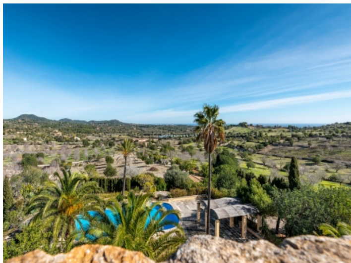
Stunning panoramic views