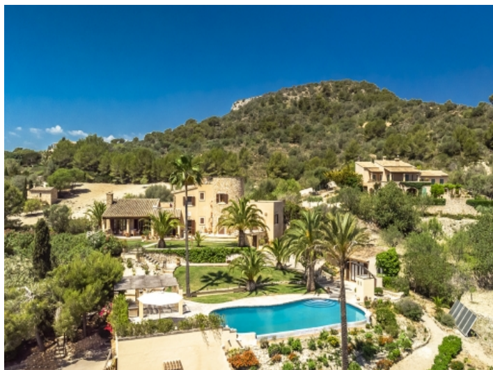
Wonderful garden and pool area