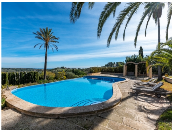
Very private pool area