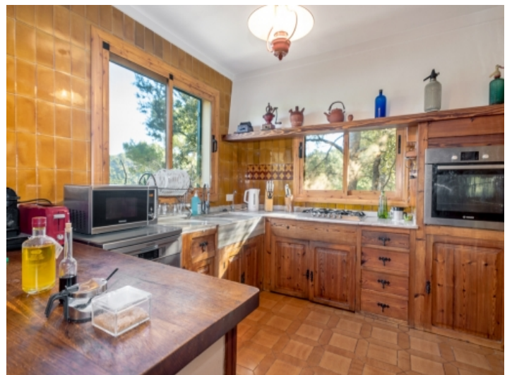
Rustic country house kitchen