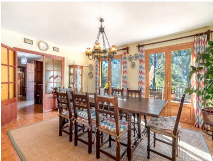
Rustic dining area with terrace access