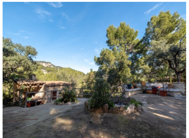
Very private outdoor area