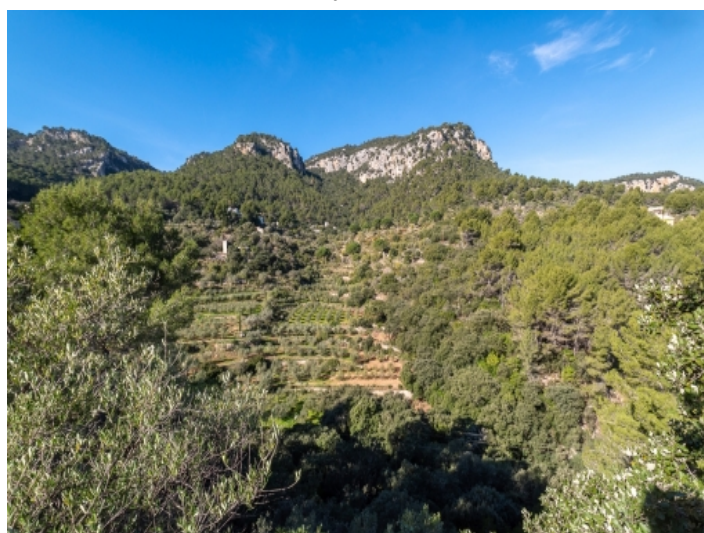
Wonderful mountain views