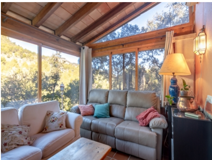
Lounge area in the wintergarden