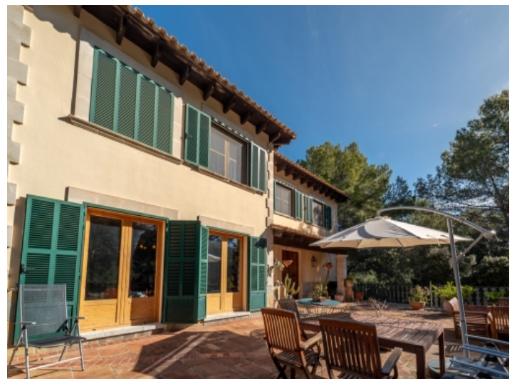
Large, sunny terrace