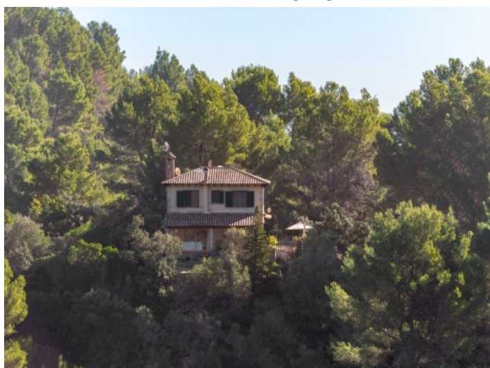
Finca in the middle of natura