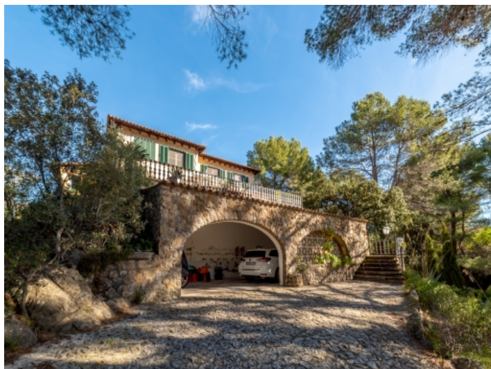
Exterior view and garage