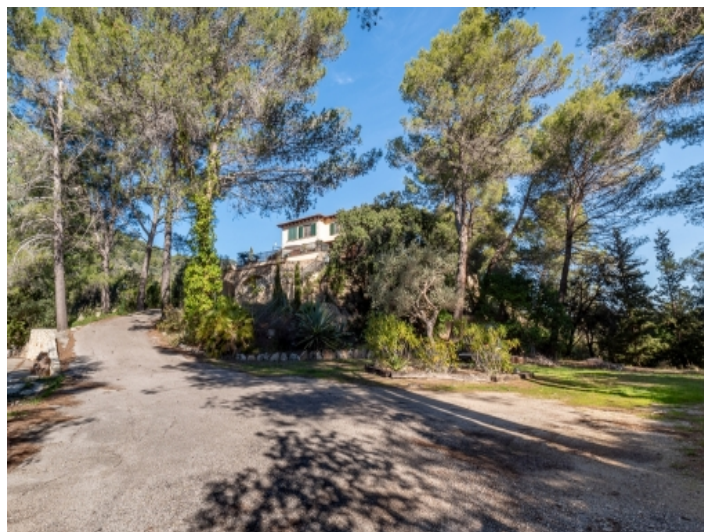
Driveway to the finca