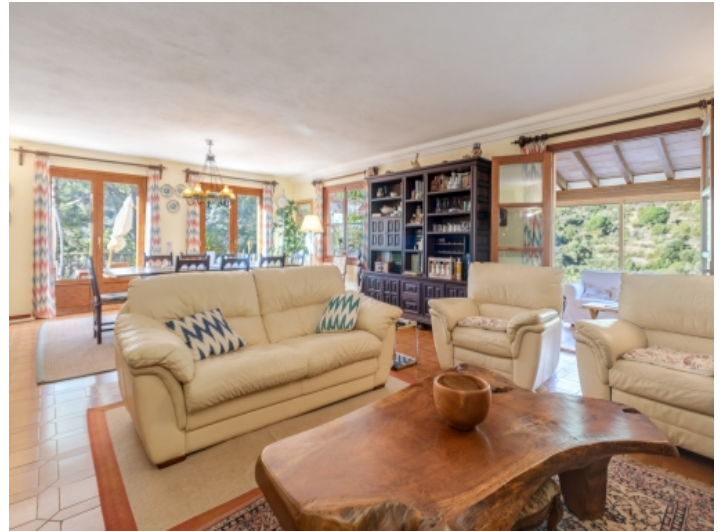
Lightflooded living and dining area