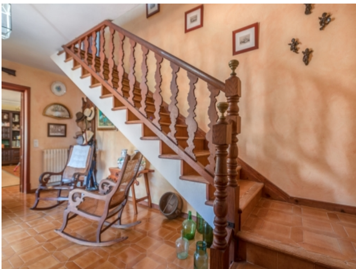
Stairs to the upper floor