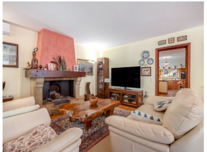
Living area with cozy chimney