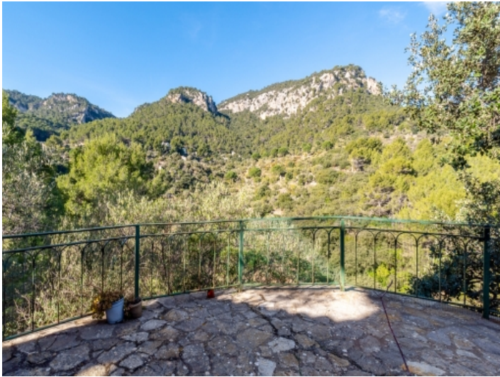
Dreamlike viewing point from the terrace