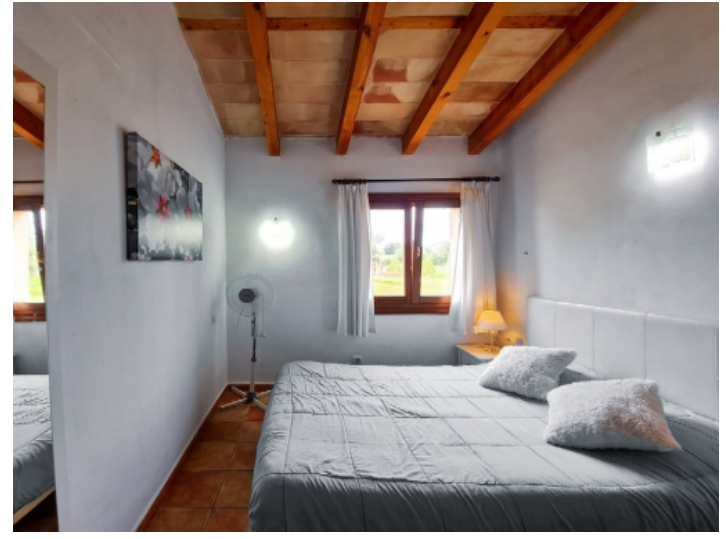
Bedroom house 2