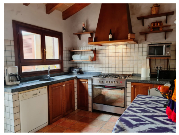
Kitchen house 2