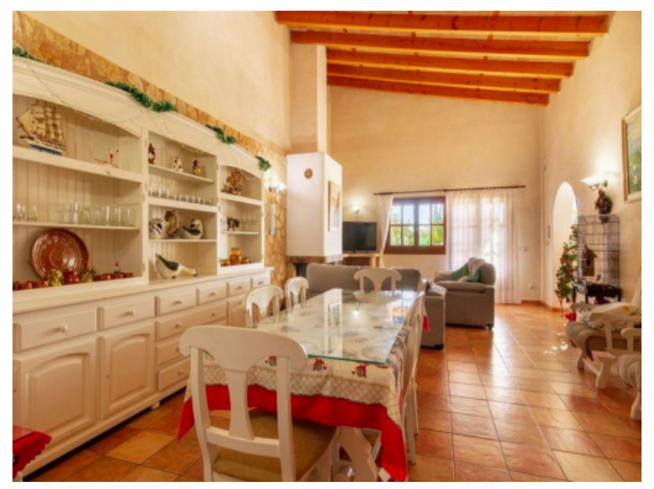
Dining area house 2