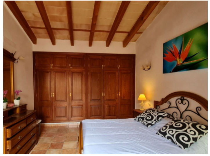
Bedroom house 2