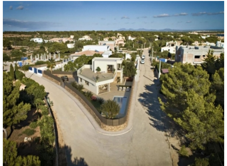
Exterior view of the villa