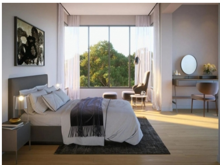
Noble master bedroom