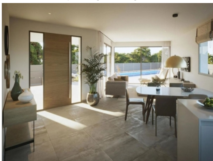
View to the entrance area