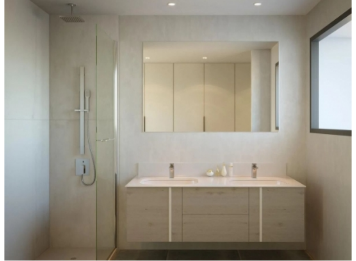
Bathroom with walk-in shower