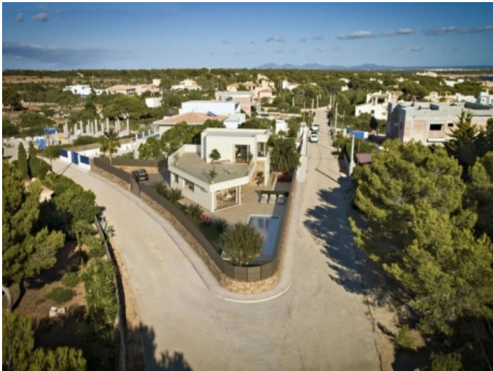
Exterior view of the villa