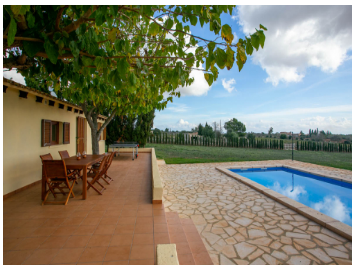
Terrace and pool