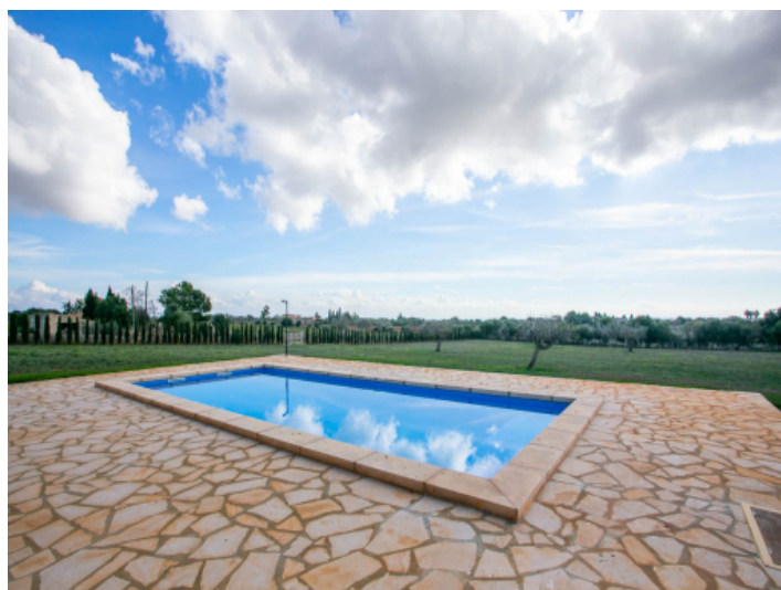
View of the pool