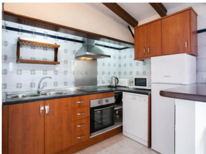
Rustic kitchen of the finca