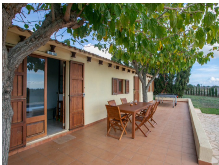
Terrace with dining area