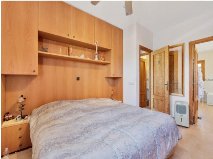
Double bedroom with bathroom en suite