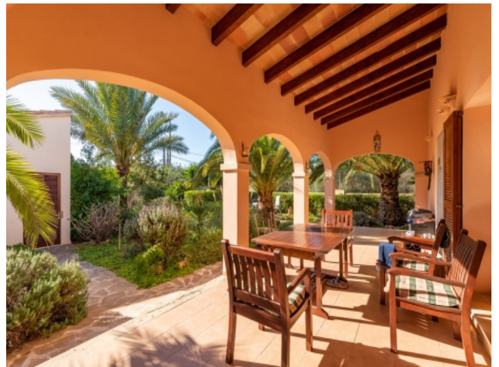
Charming, covered terrace