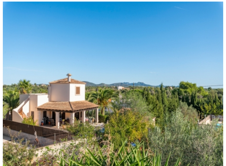
Sweeping views from the roof terrace