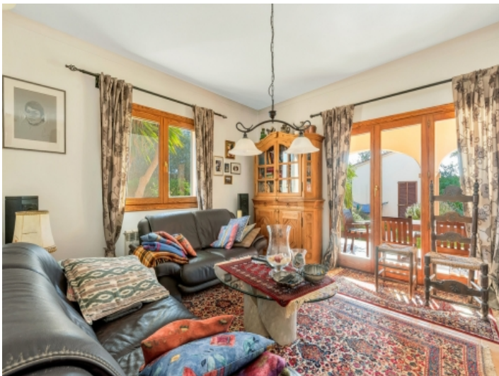
Living area with terrace access