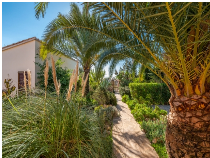
View to the entrance door