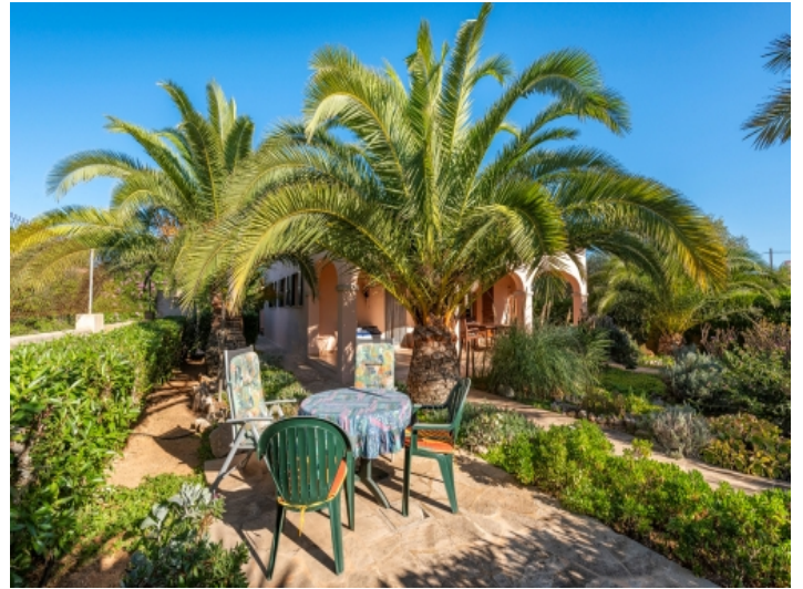
Mediterranean garden with plam trees