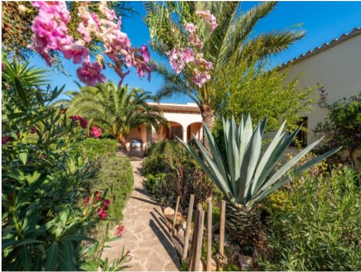
Lovely access to the plot