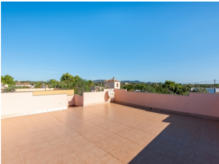
Roof terrace with ample space