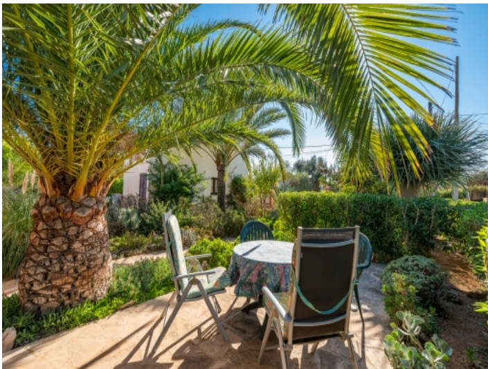
Idyllic terrace in a wonderful garden