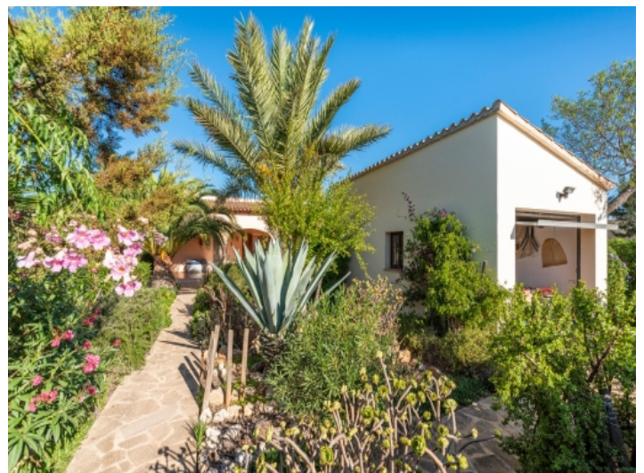
View to the garage