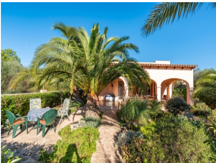
Exterior view of the house