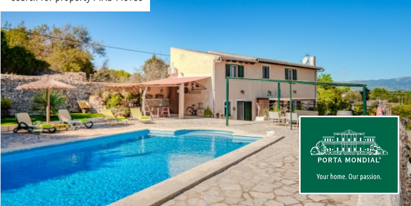
Sencelles search for property MAL-115735