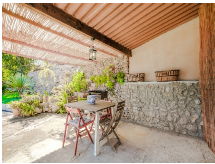
Covered outdoor dining area