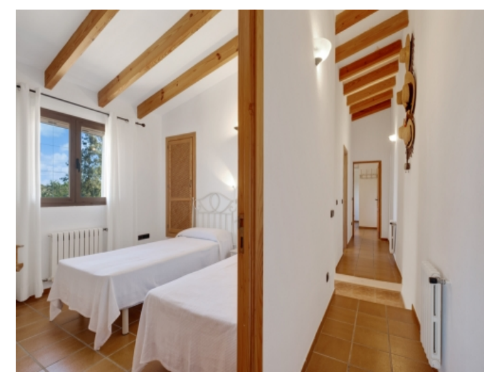
Bedroom and corridor on the upper floor