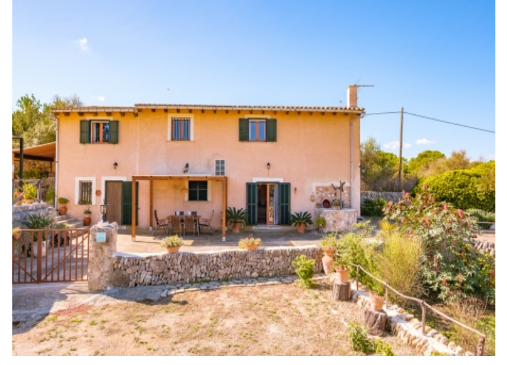
Front view and entrance to the finca