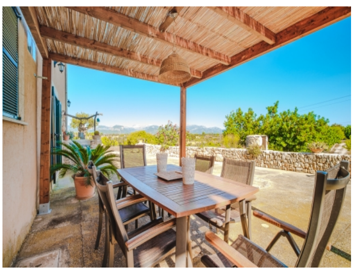
Charming front terrace with sweeping views