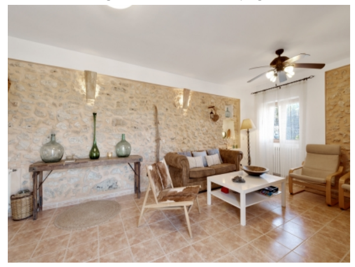
Living area with authenic stone wall