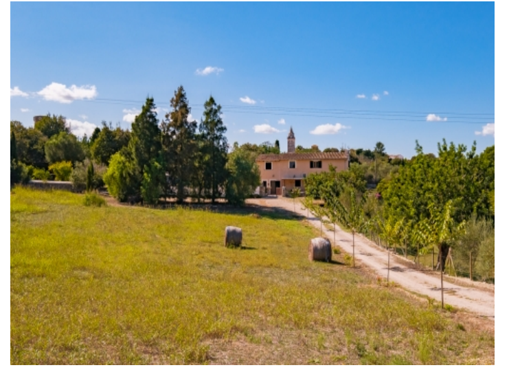
Long driveway to the finca