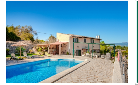
Sencelles search for property MAL-115735