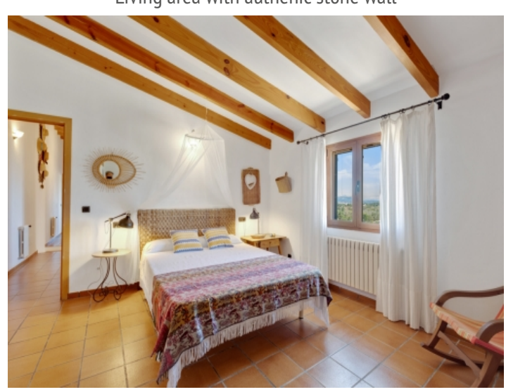
One of 3 double bedrooms

PORTA MALLORQUINA • C./ COLOM 20 2°, 07001 PALMA, SPAIN TEL.: +34 971 698 242 • INFO@PORTAMALLORQUINA.COM • WWW.PORTAMALLORQUINA.COM