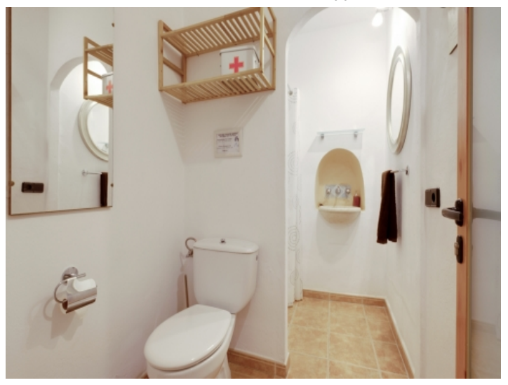
Shower bathroom on the ground floor