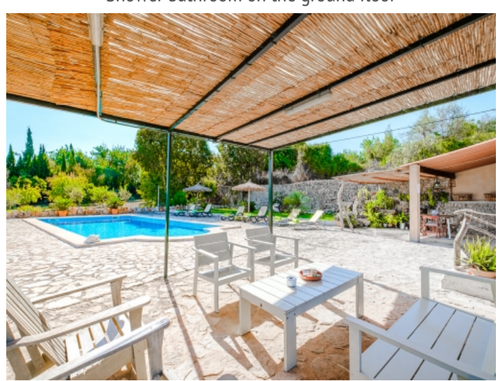
Tranquil lounge area next to the pool