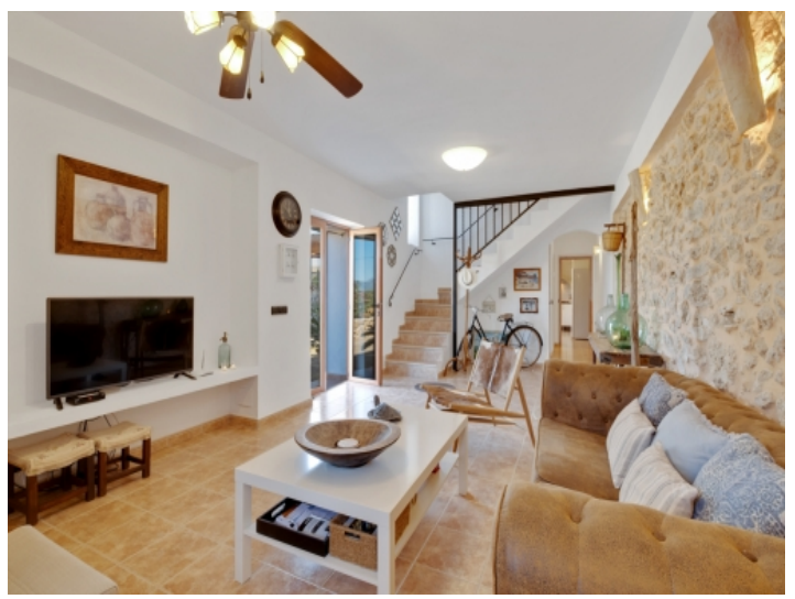
Beutiful living and entrance area