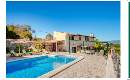
Sencelles search for property MAL-115735