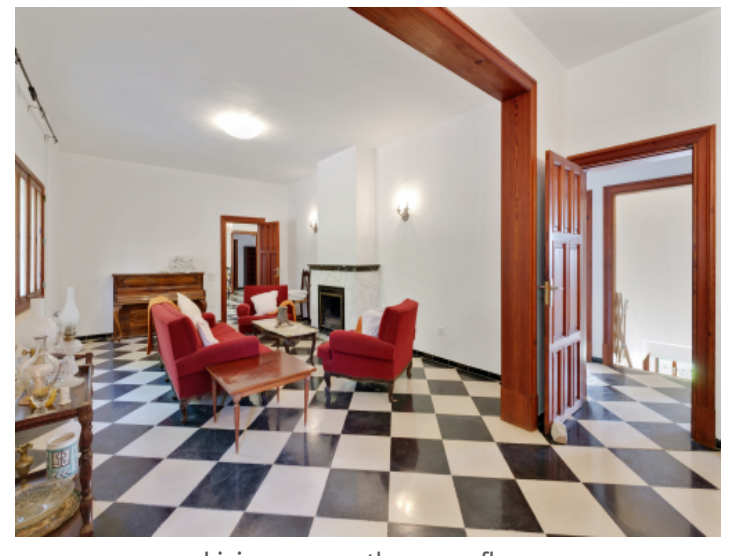
Living area on the upper floor