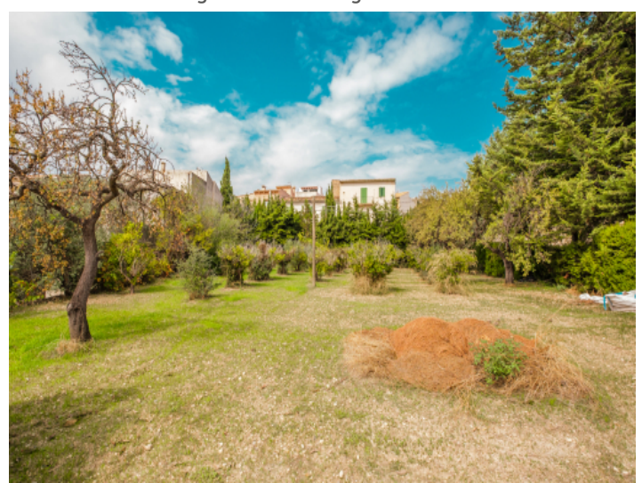
View of the plot