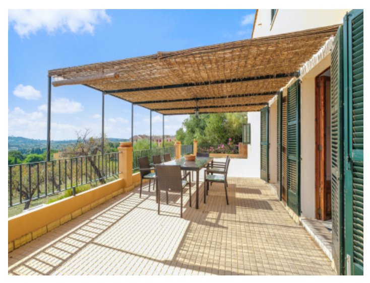
Beautiful covered terrace