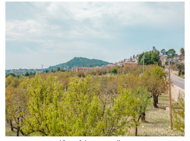
View of the surroundings