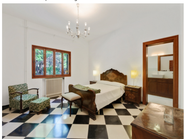
Bedroom with bathroom en suite