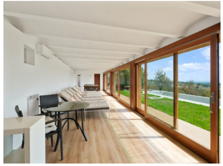
Spa area with a view