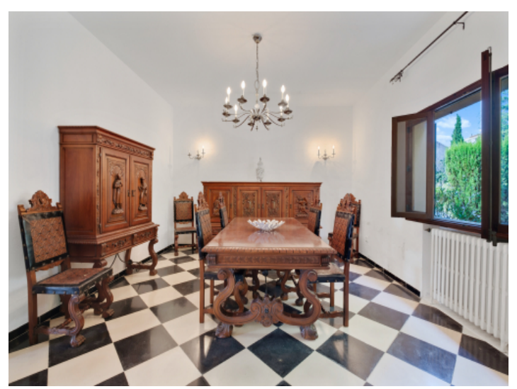
Mallorcan dining area