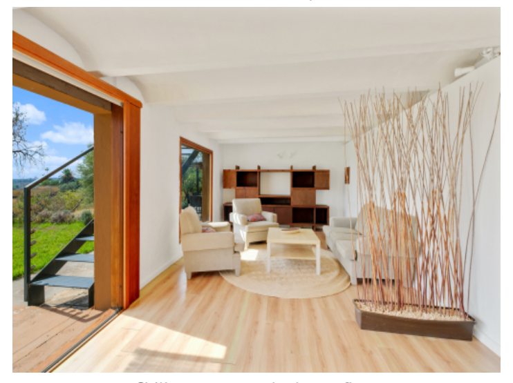
Chill out area on the lower floor