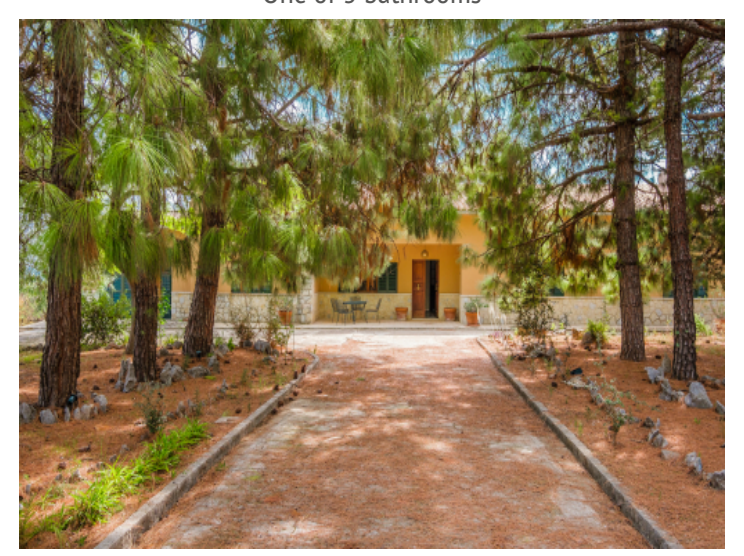
Green, idyllic surroundings