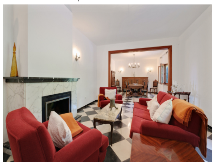
Fire place of the living area