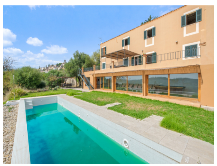
Exterior view and pool