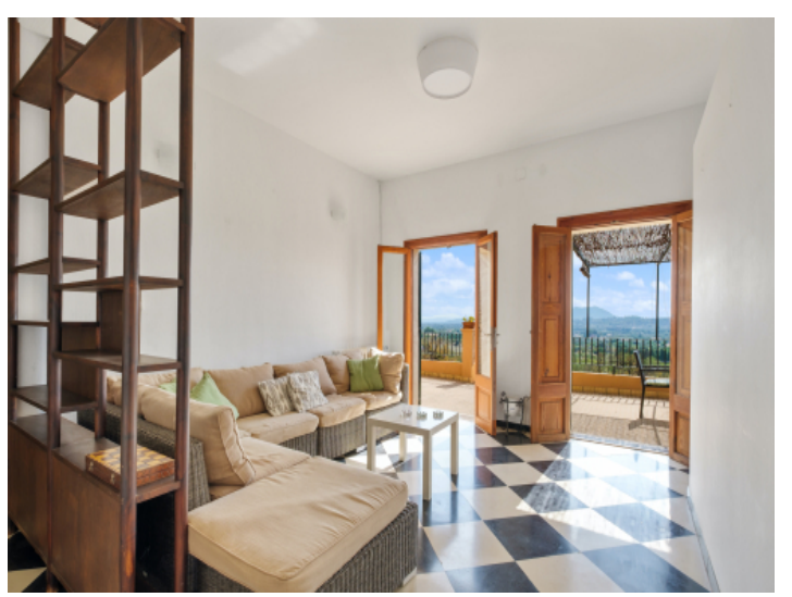
Separte living area with terrace access