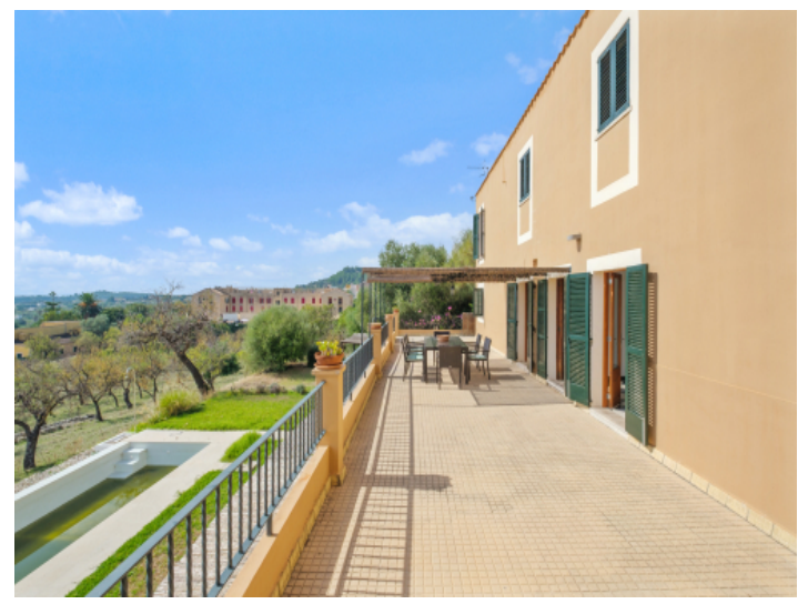
Large terrace with garden views