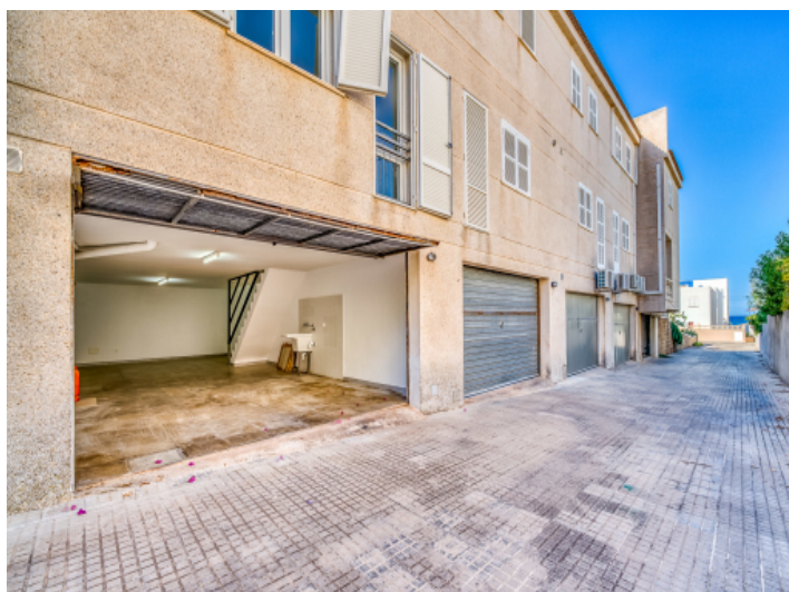
Large double garage