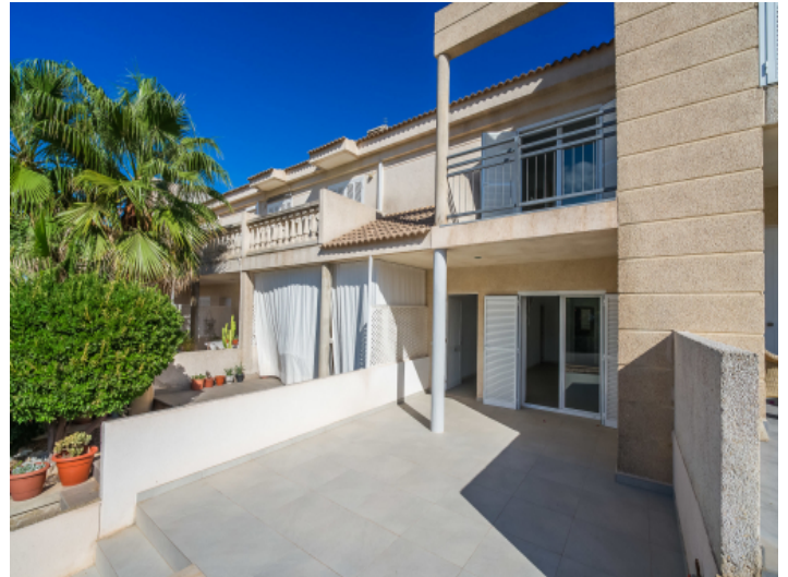
Front terrace and access to the house