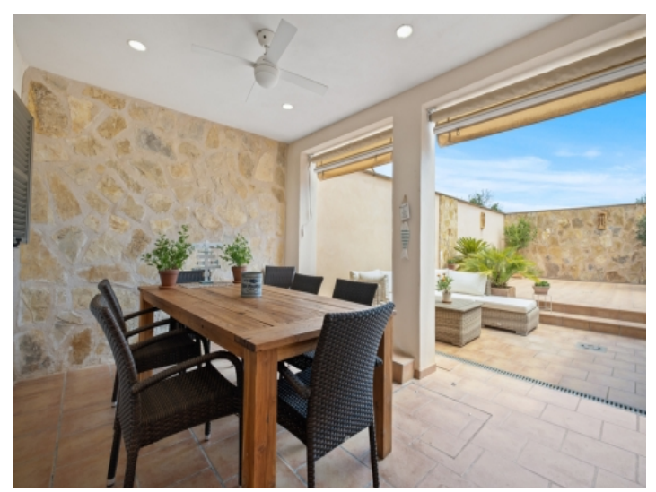
Covered dining area