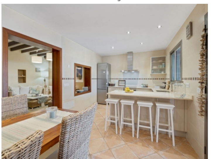
Adjoining kitchen and dining area