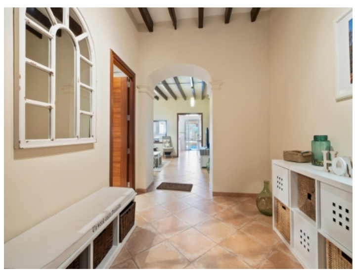
Inviting entrance area