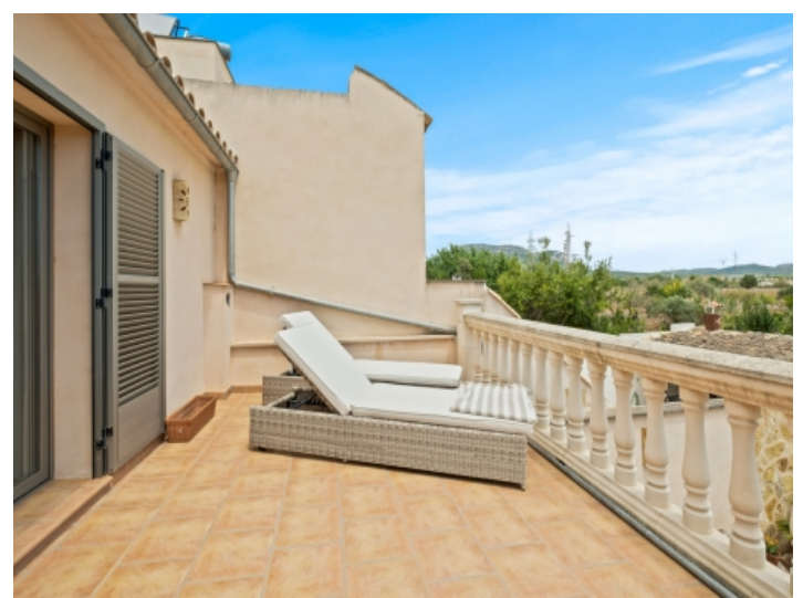
Spacious sun terrace