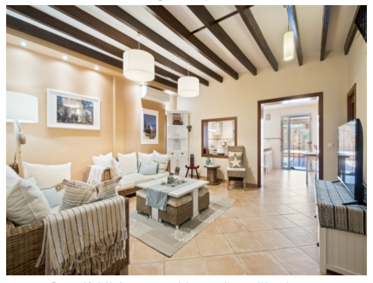
Beautiful living area with wooden ceiling beams