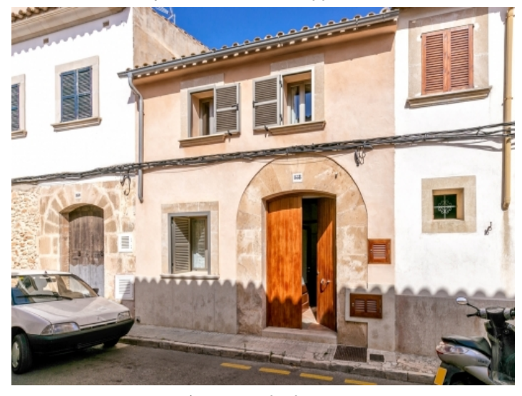
Access to the house