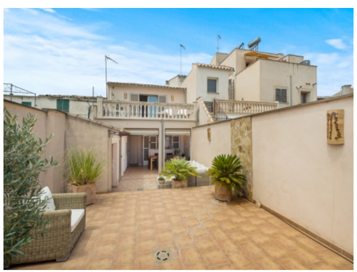
Large, own patio