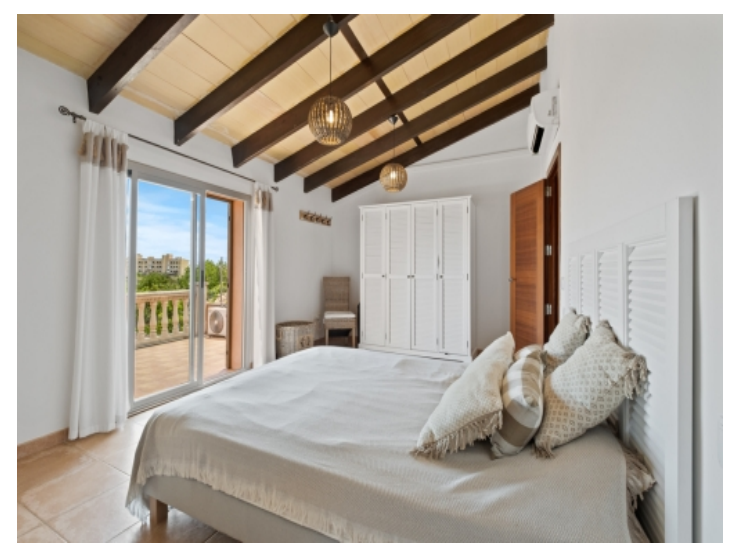
Master bedroom with won terrace