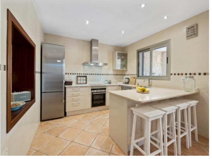
Modern, open kitchen