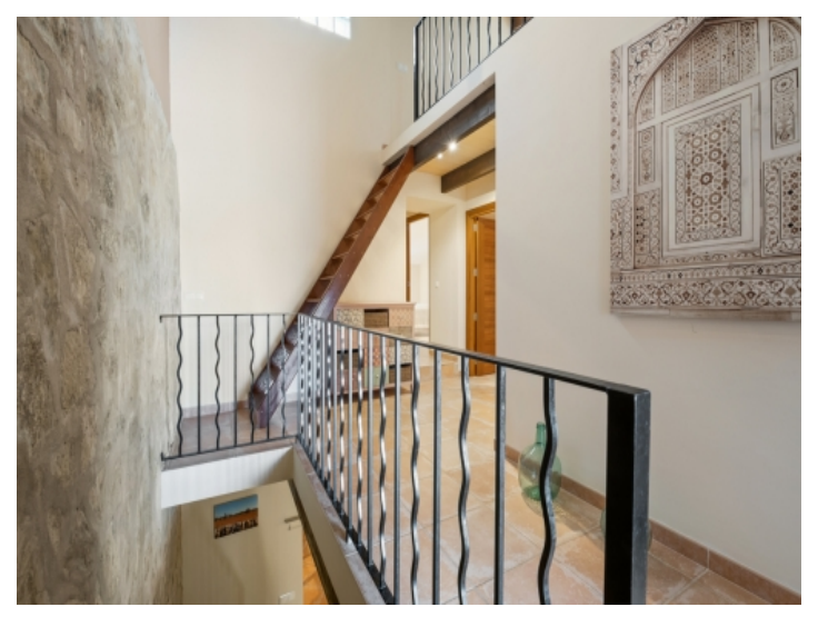
Stylish access to the upper floor