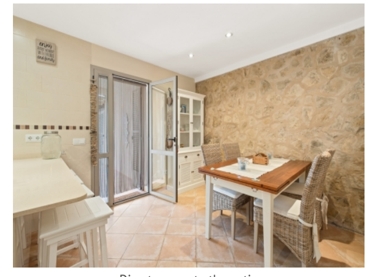
Direct access to the patio