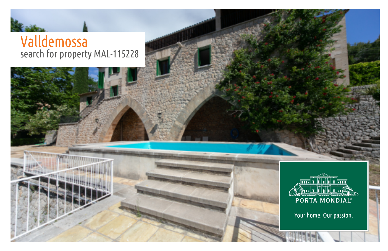
Mansion house with extraordinary views over Valldemosa