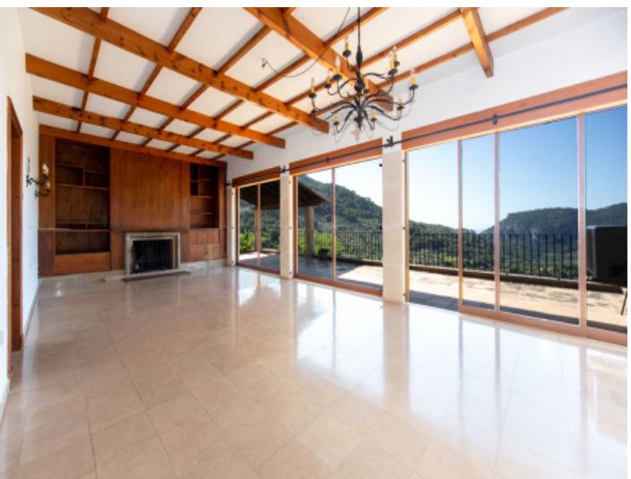
Lightflooded living area with panorama windows