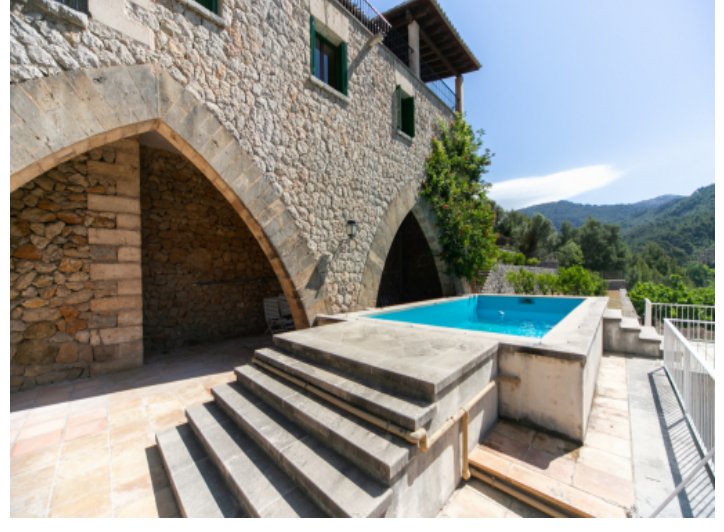
Pool and partly covered terrace

PORTA MALLORQUINA • C./ COLOM 20 2°, 07001 PALMA, SPAIN TEL.: +34 971 698 242 • INFO@PORTAMALLORQUINA.COM • WWW.PORTAMALLORQUINA.COM