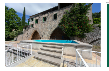
Valldemossa search for property MAL-115228