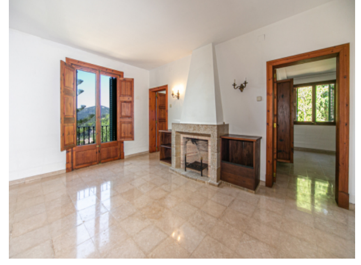
Further room with fireplace