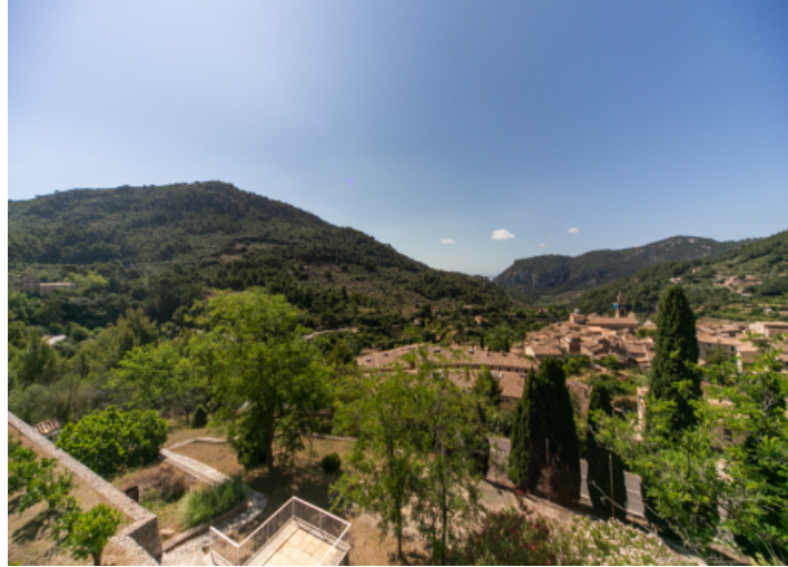
Impressive views over Valldemossa