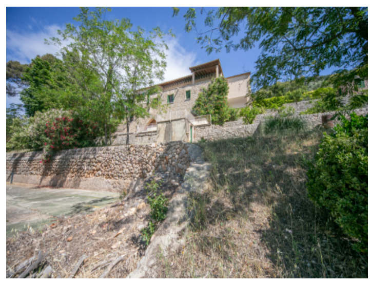
Lovely landscape views