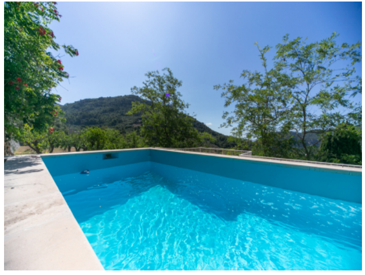
Pool for hot summer days