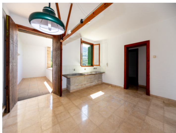
Old utility room