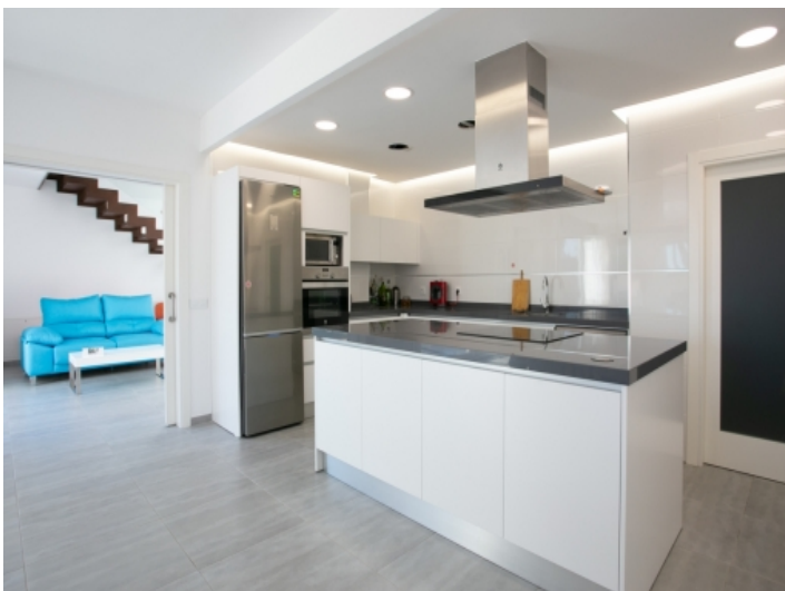
Alternative kitchen view