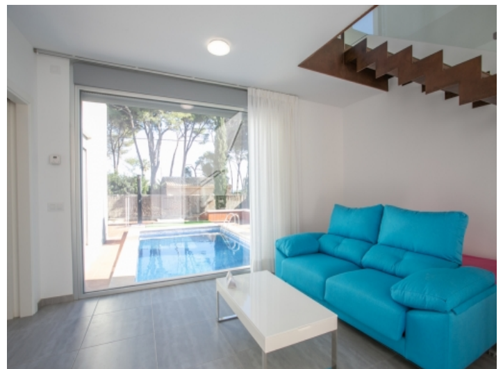
Lounge area with access to the pool area