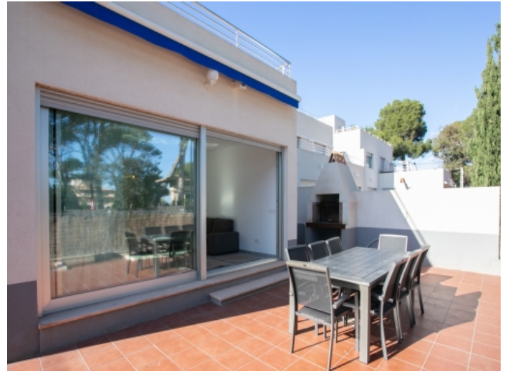
Terrace with bbq area