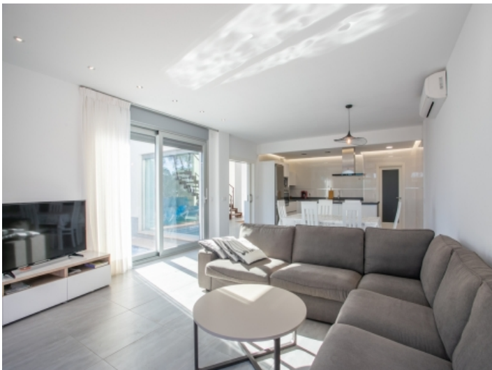
Lightflooded living and dining area