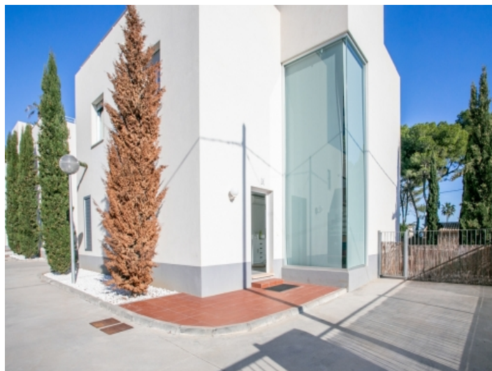
Access to the house