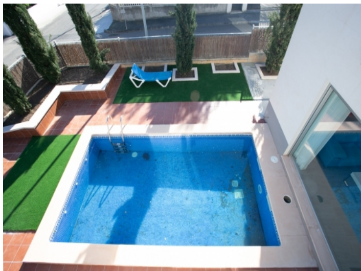
View to the pool area