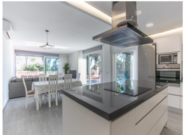
Modern and open kitchen