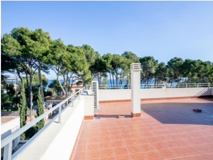
Roof terrace with wonderful sea views