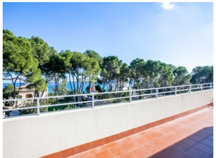
Beautiful sea views