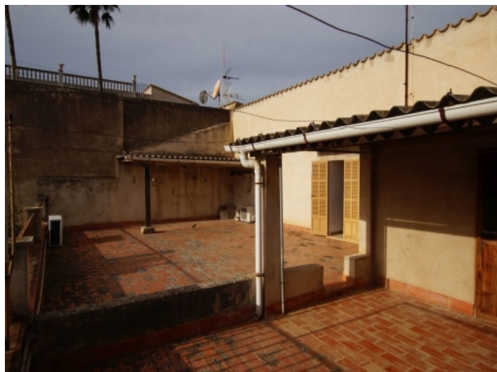
Alternative terrace view