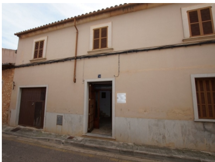
Exterior view of the house