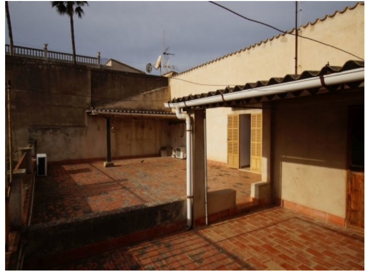
Alternative terrace view