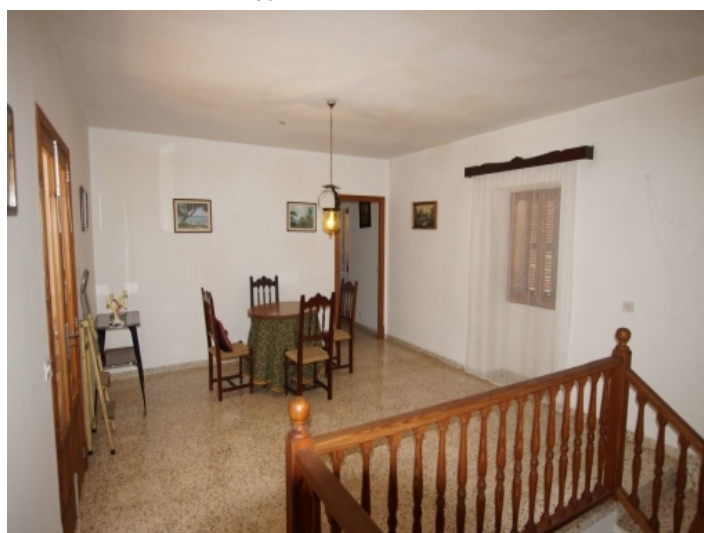
Gallery on the upper floor