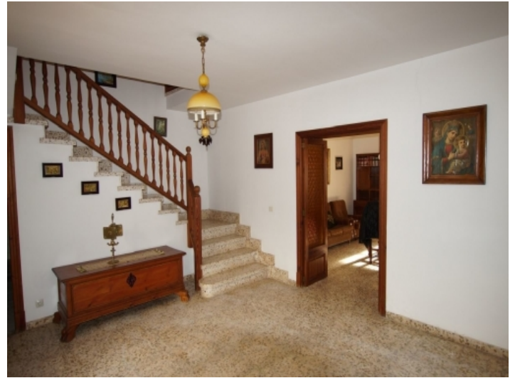
Typical entrance area