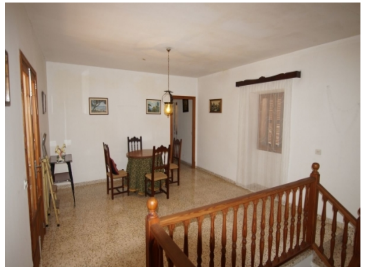
Gallery on the upper floor