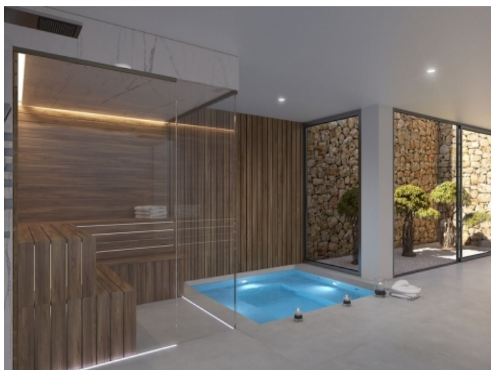
Attractive spa area with sauna