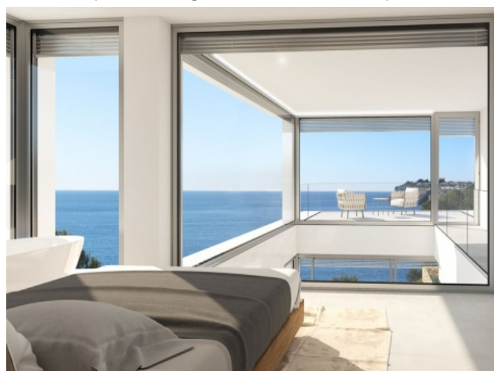
Bedroom with panoramic windows