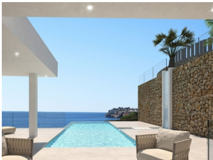
Beautiful pool area