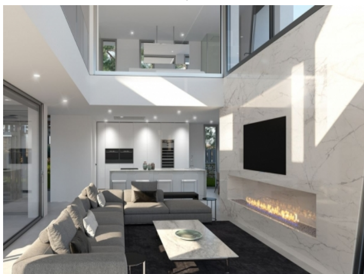
Modern living area with fireplace