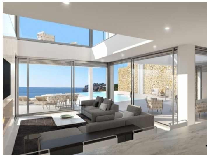
Spacious living area with access to the pool