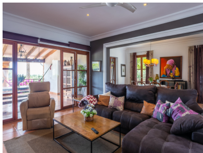
Living area with direct terrace access