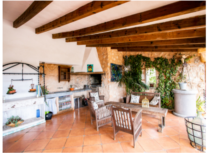
Large, covered terrace with bbq area