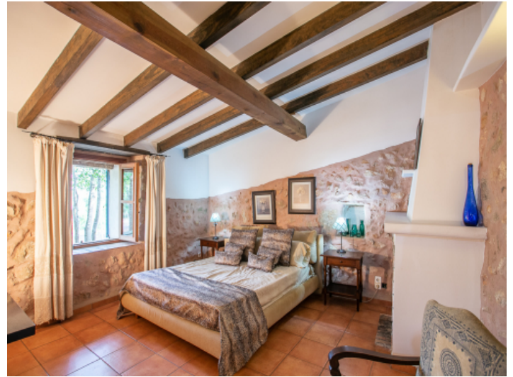
Authentic bedroom with sandstone wall