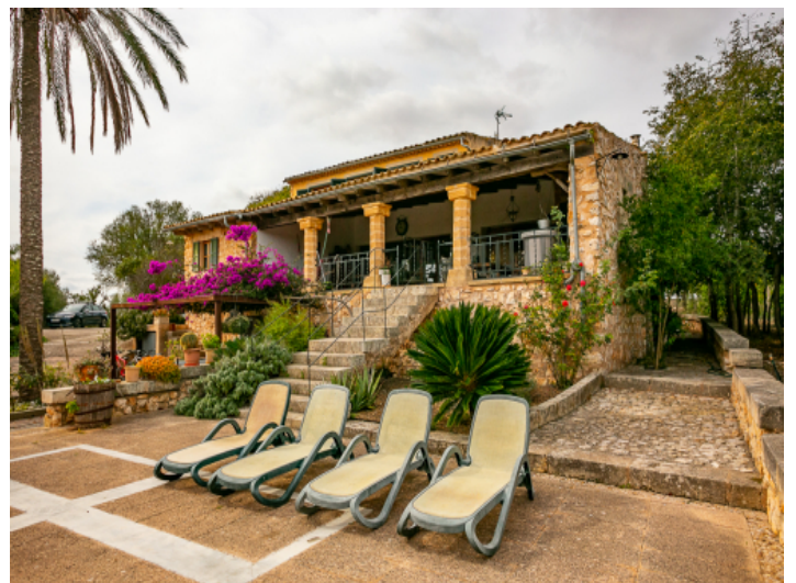
Spacious sun terrace