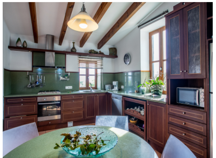
Lovely kitchen with dining area