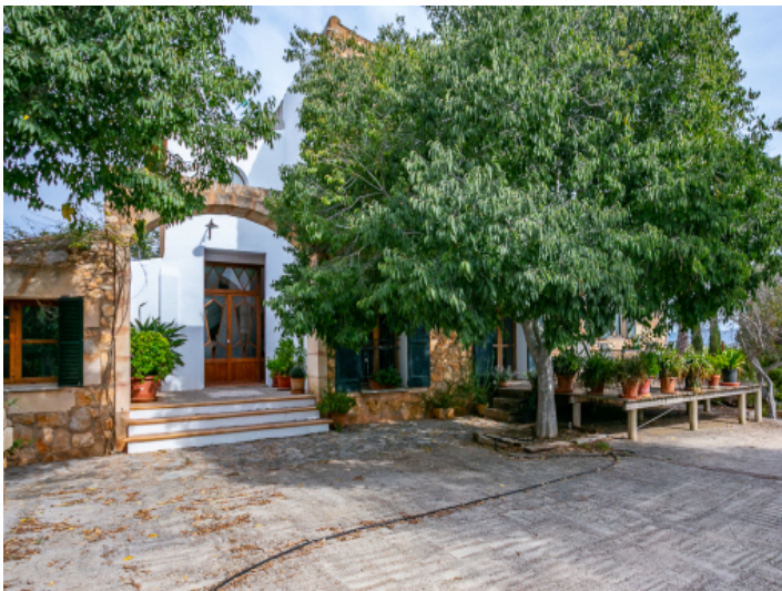
Access to the charming finca