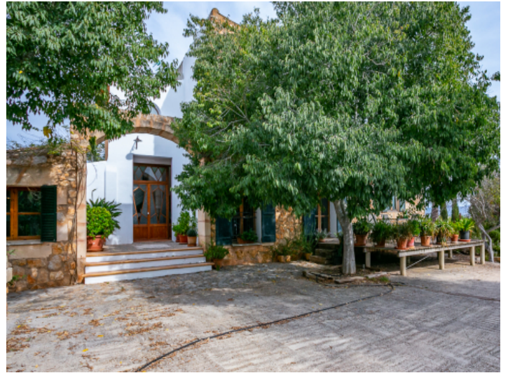
Access to the charming finca