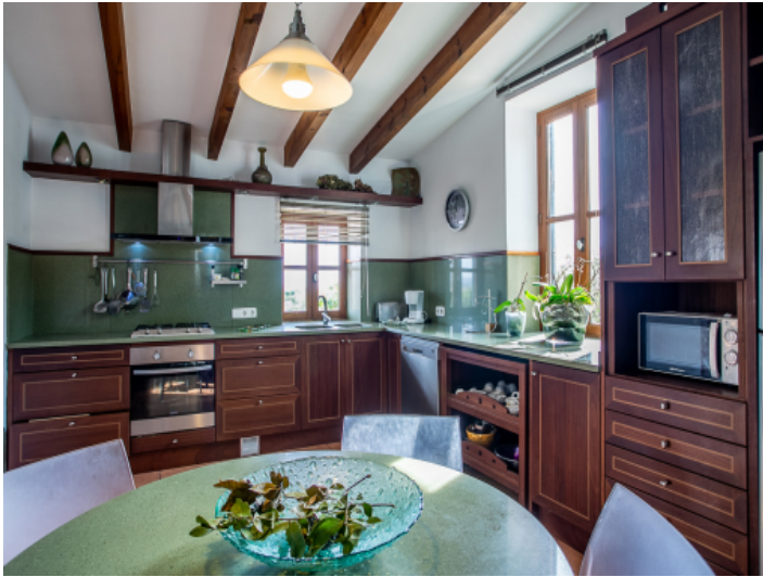
Lovely kitchen with dining area