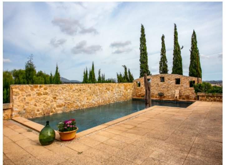
Very private pool area