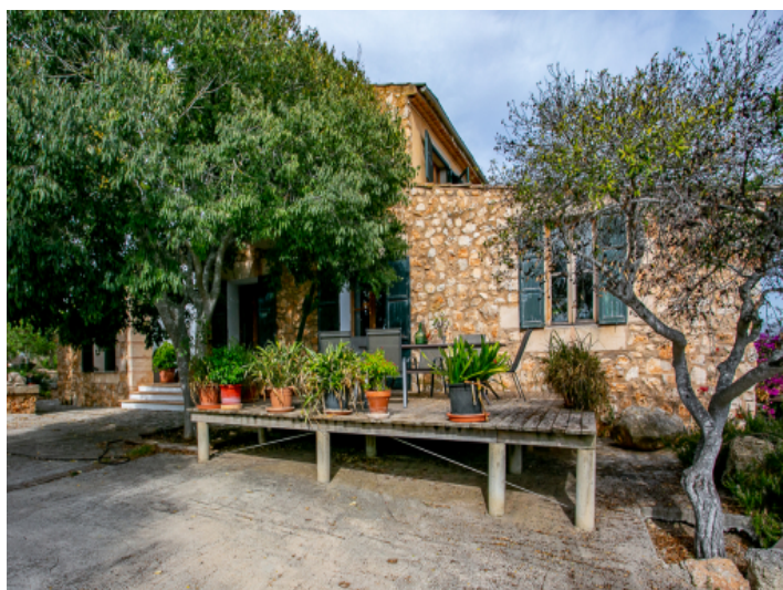
Idyllic front terrace