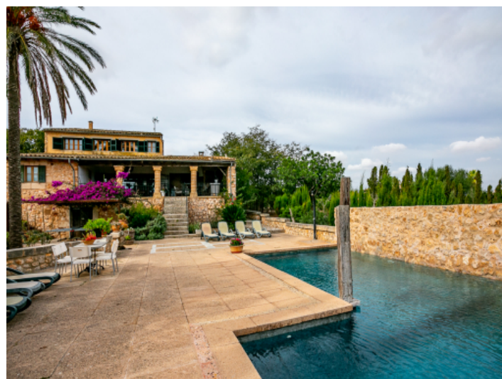
Beautiful terrace and pool area