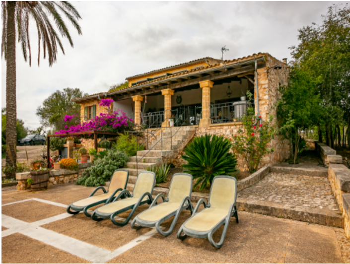
Spacious sun terrace