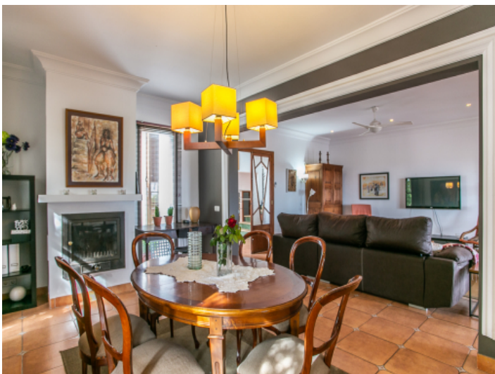
Beautiful dining area with fireplace