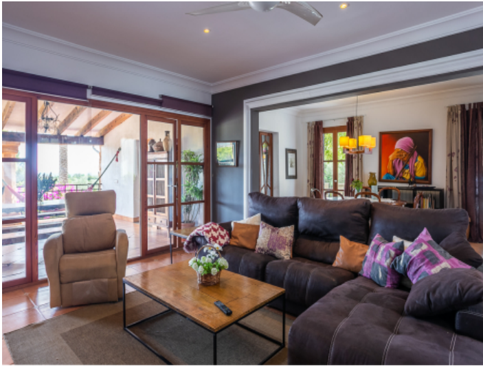
Living area with direct terrace access