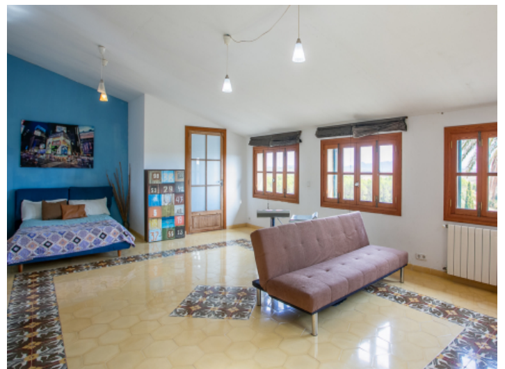
Large bedroom on the upper floor