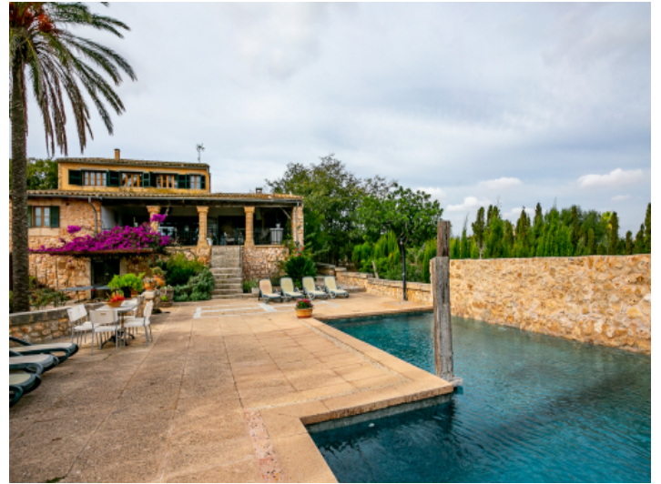
Beautiful terrace and pool area