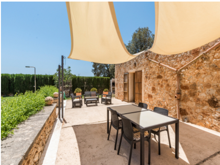
Charming dining area on the terrace