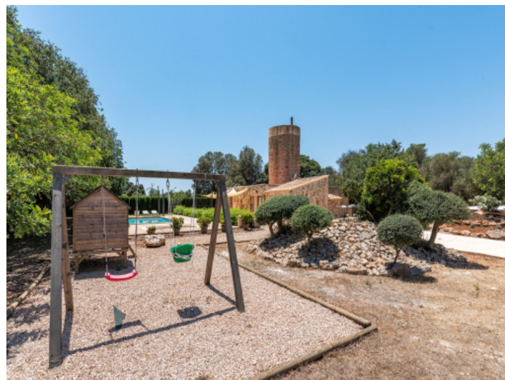
Spacious outdoor area