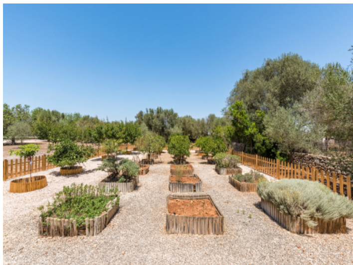
Fruit and vegetable garden