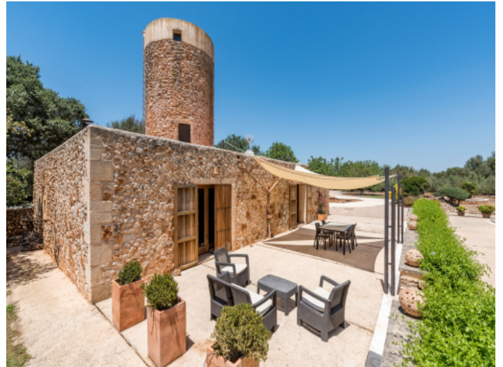
Exterior view of the beautiful stone mill finca