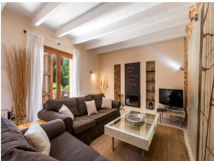
The living area provides a fireplace