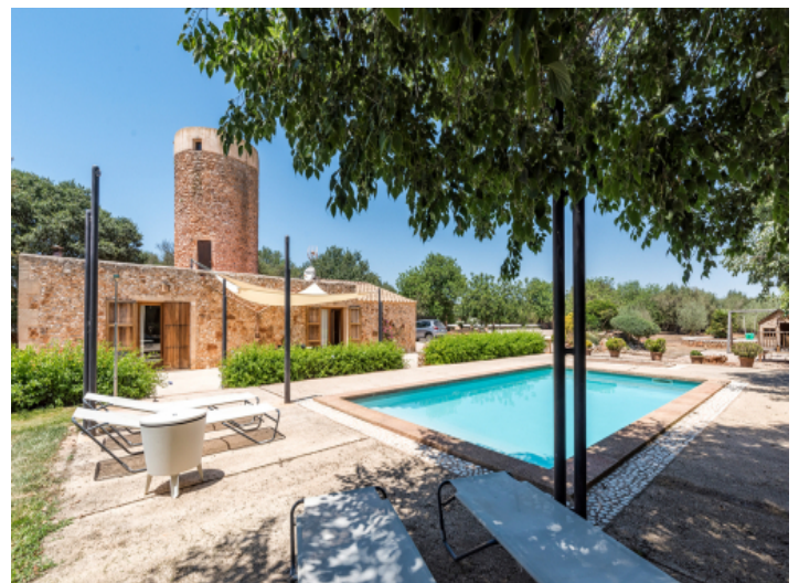
Pool area with absolute privacy