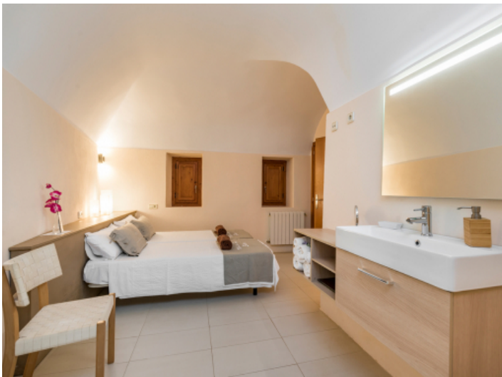
One of 3 modern bedrooms