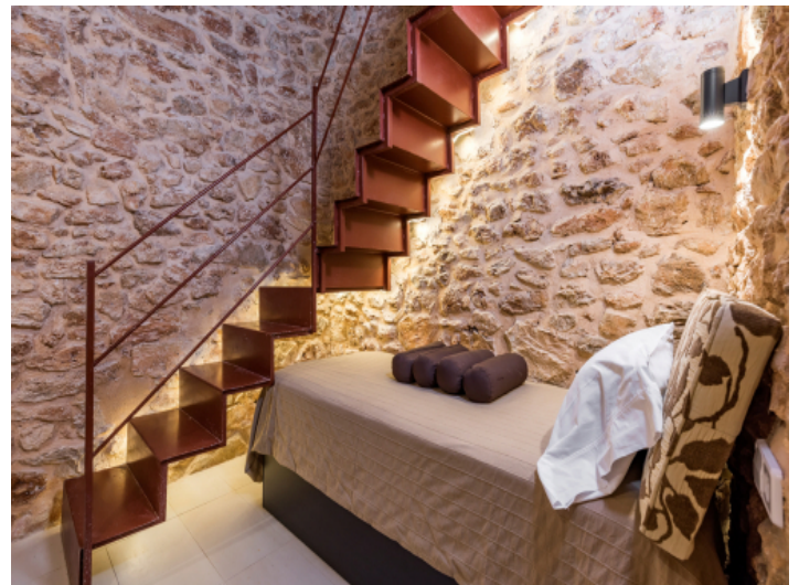
Bedroom with authentic stone wall