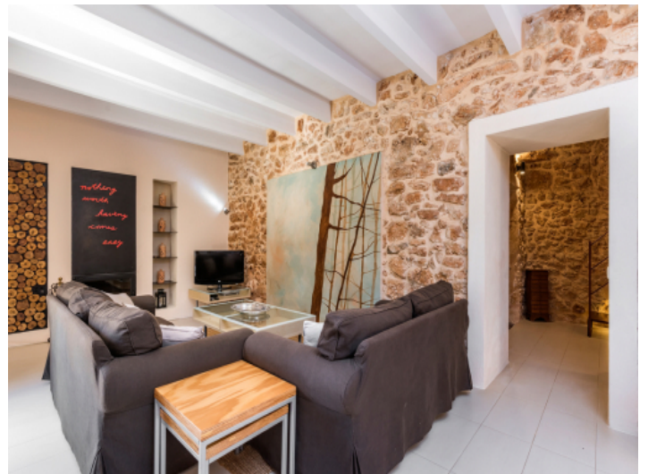
Cosy living area with natural stone wall