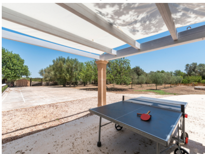
Outdoor area with many possibilities