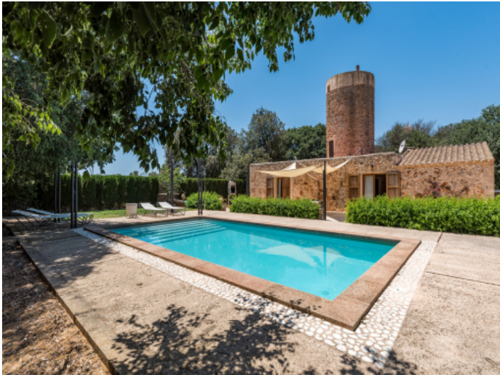
Well-tended pool area