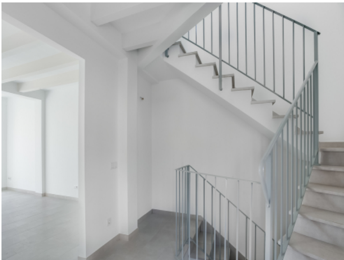
Staircase of the house