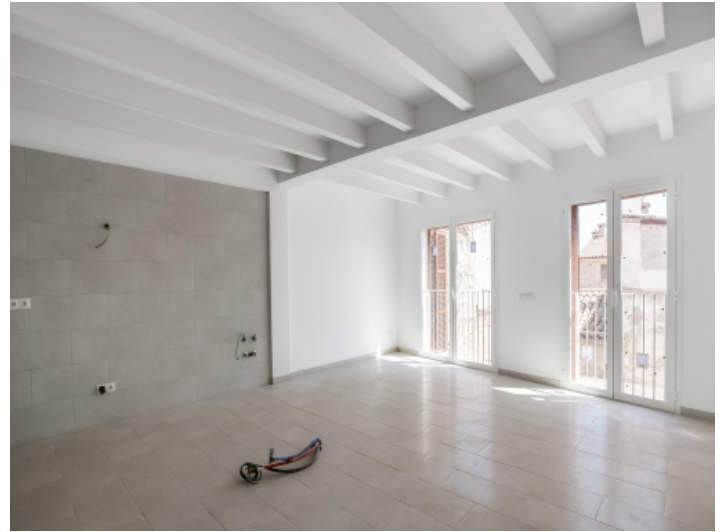
Light-flooded living and dining area