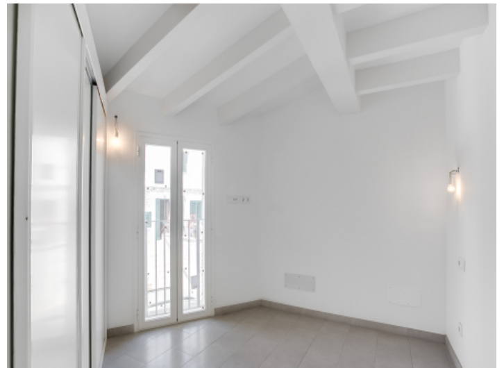
Lovely bedroom with French balcony