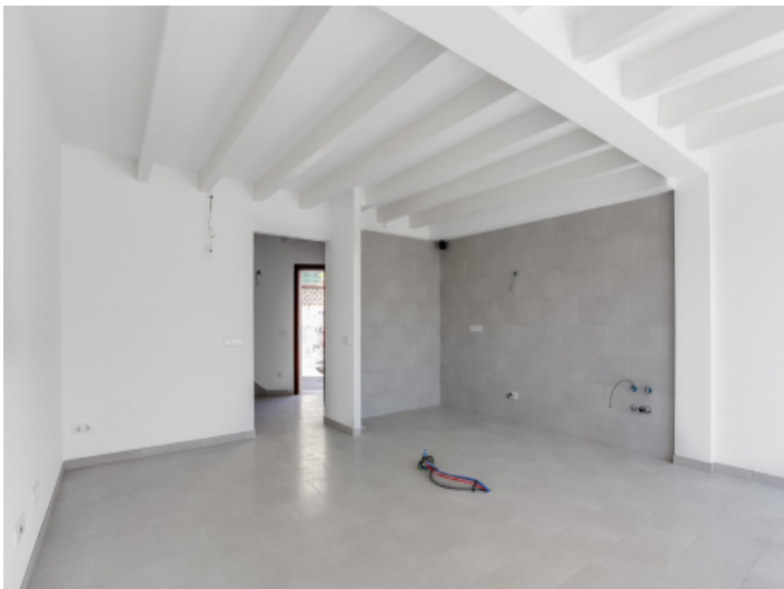
Future kitchen area