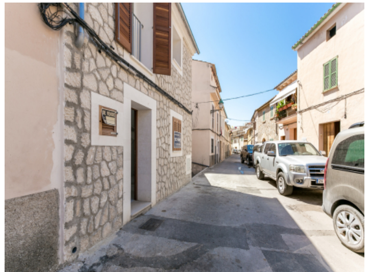
Entrance to the house