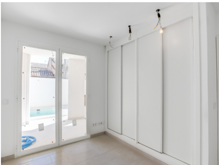
Second bedroom with access to the pool