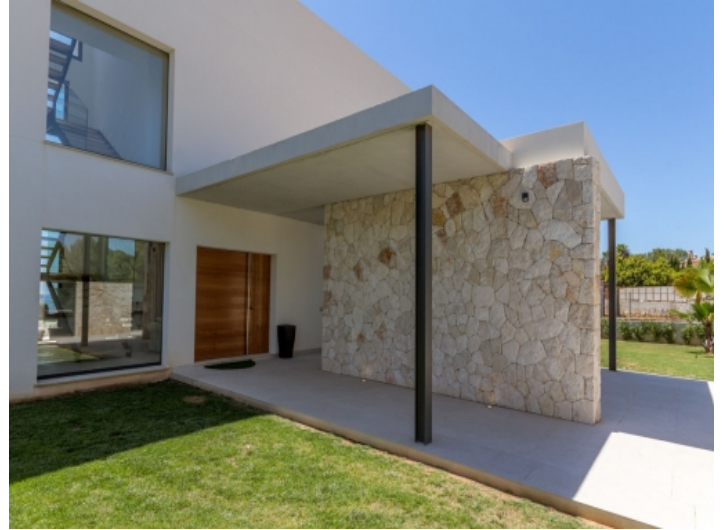
Attractive entrance area