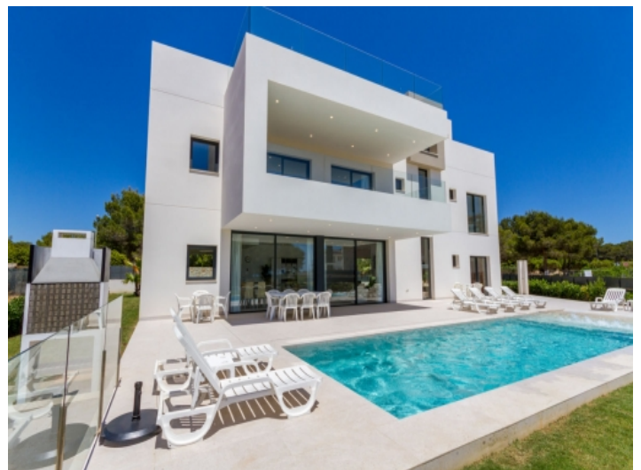
Well tended pool area