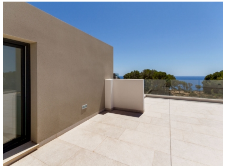
Sunny roof terrace