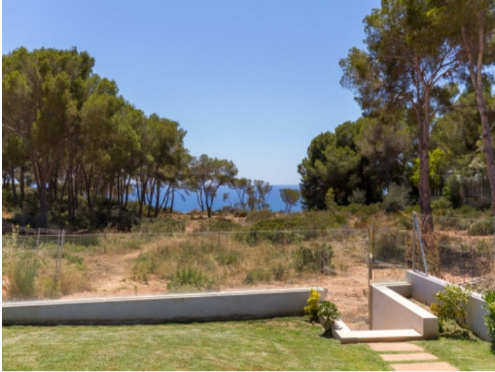
Direct access to the sea