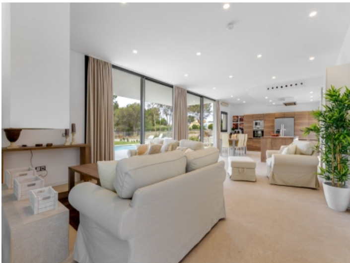
Living area with panoramic windows