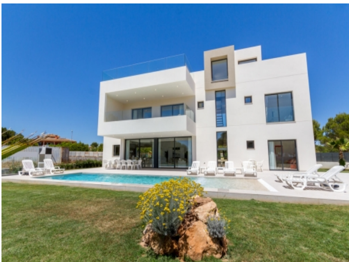
Pool and garden area