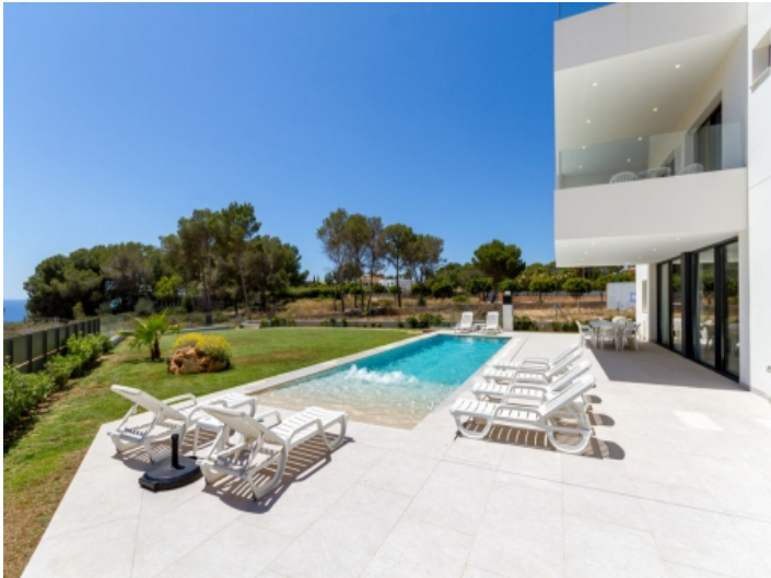
Gorgeous pool and garden area