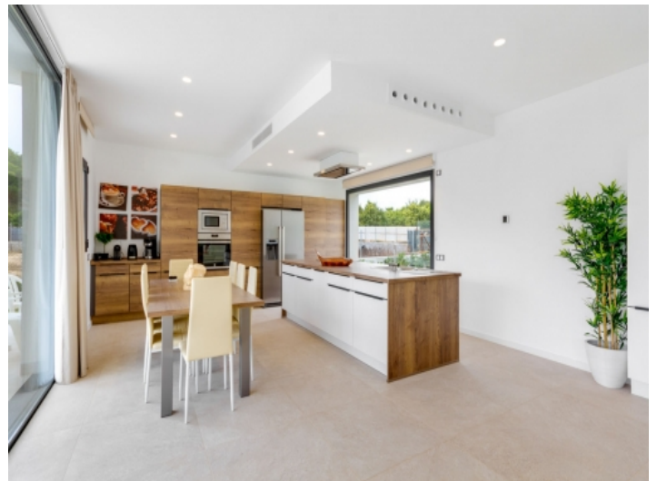
Modern kitchen and dining area