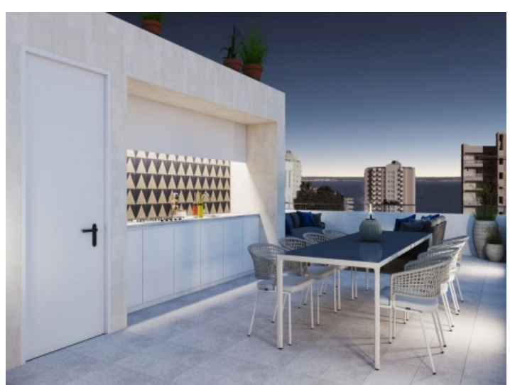
Dining area on the roof terrace