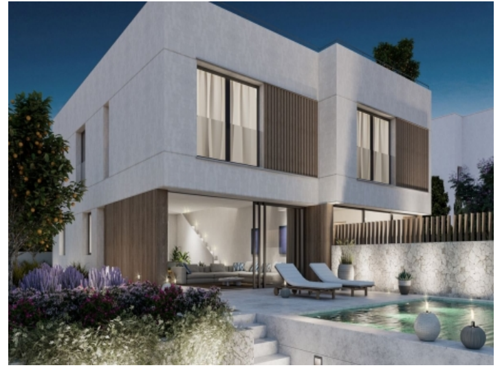
Wonderful pool area