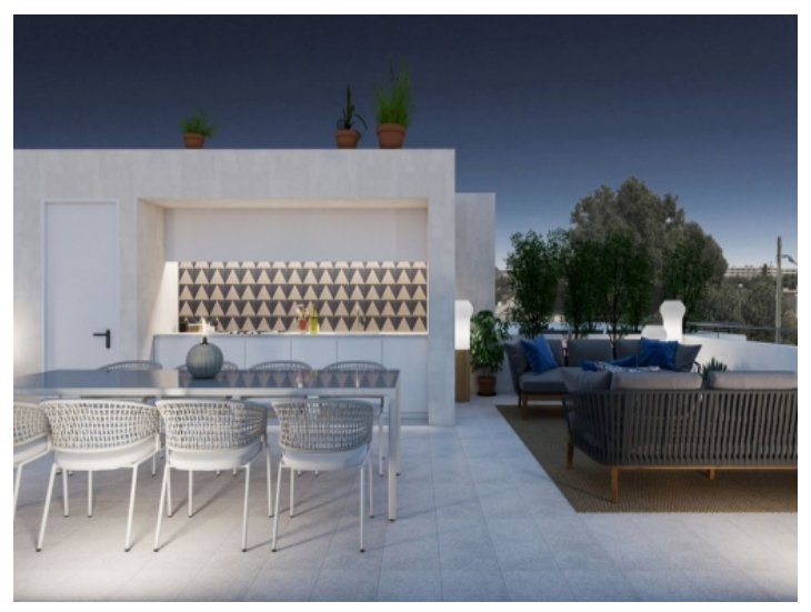
Roof terrace with chill-out lounge