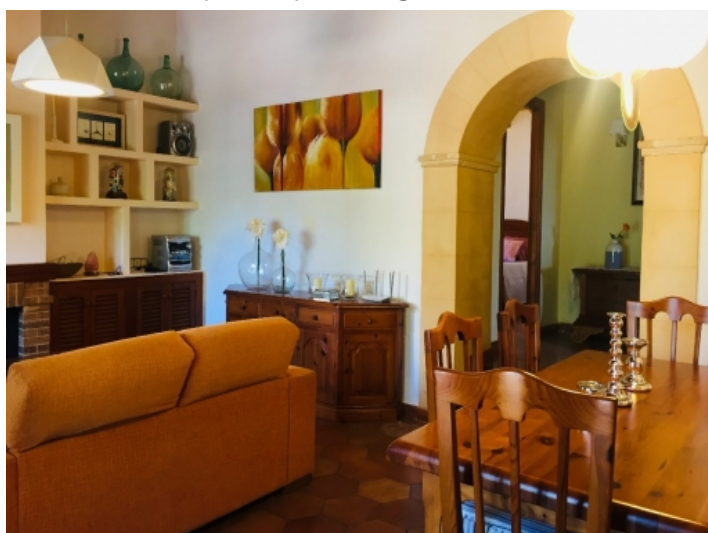
Appealing living and dining area