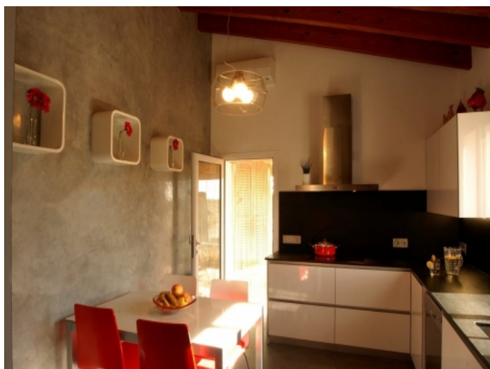
Modern kitchen with small dining area