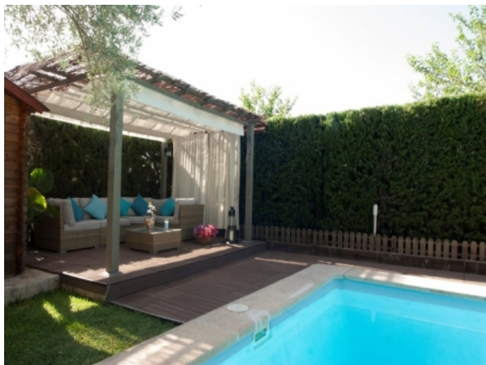
Chill-out lounge next to the pool