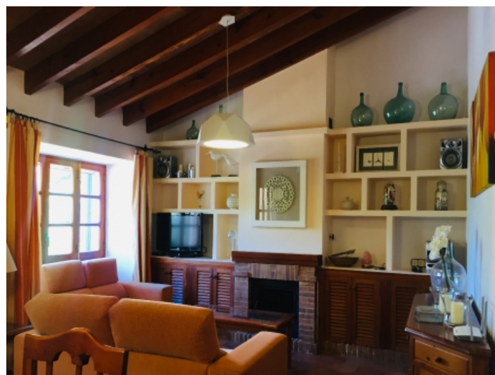
Rustic living area with fireplace