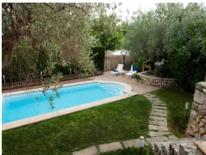
Spacious pool and garden area