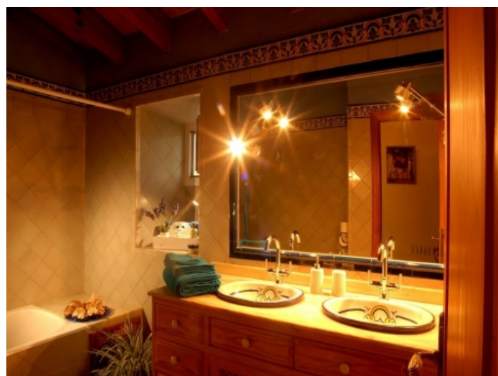
Charming bathroom with bathtub