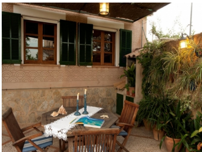
Dining area on the terrace