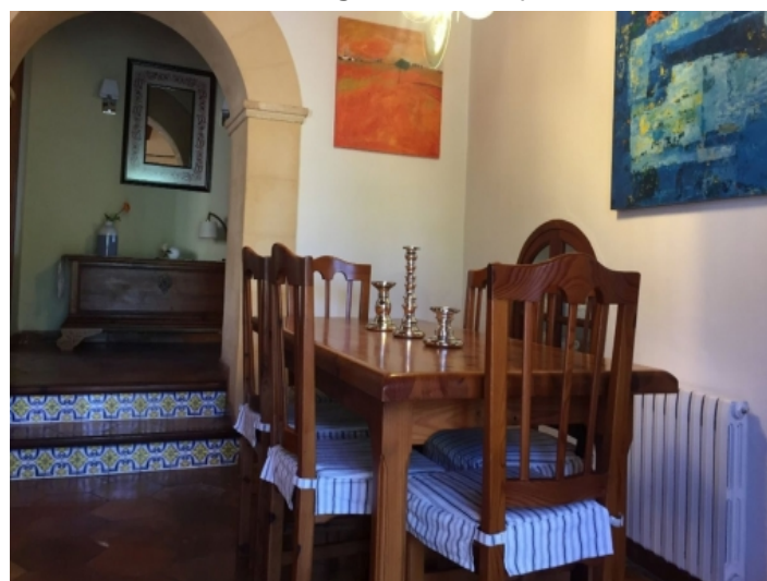
Dining area with wooden furniture