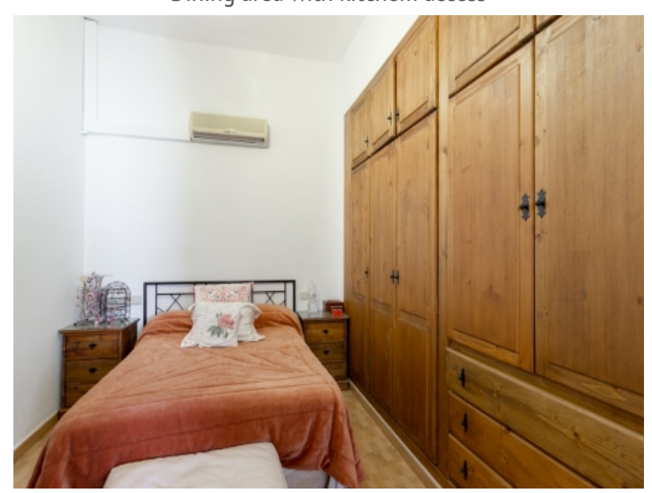
Bedroom with built-in wardrobe