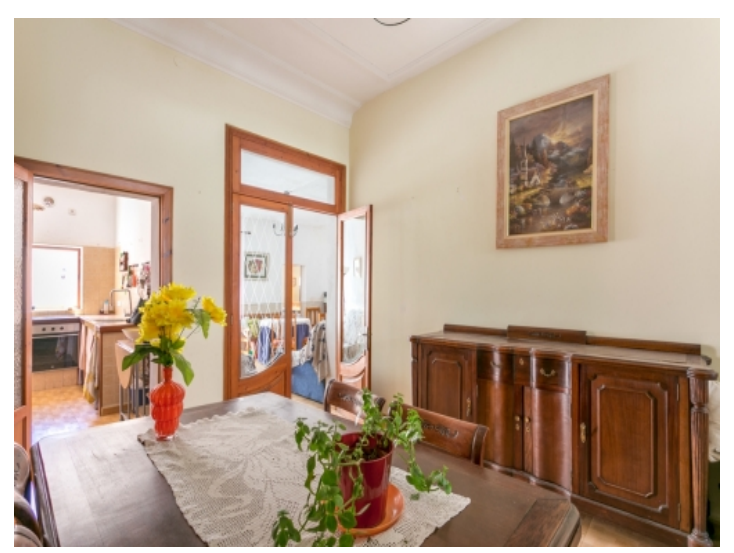
Dining area with kitchem access