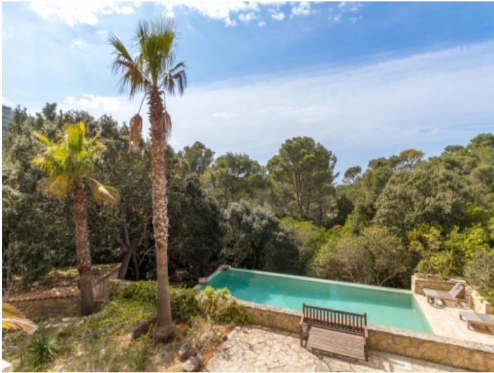
Pool area surrounded by nature