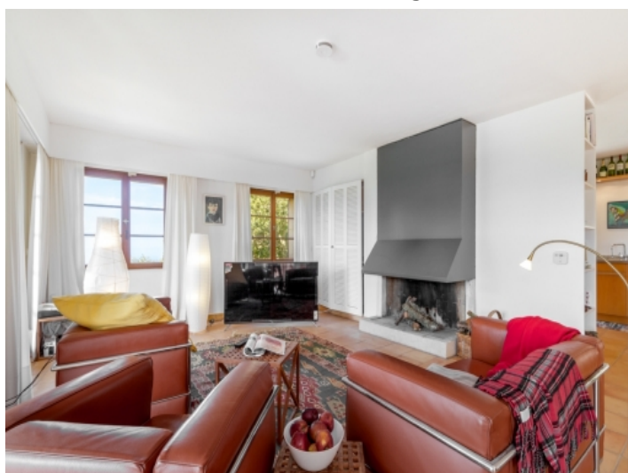
Living area with fireplace