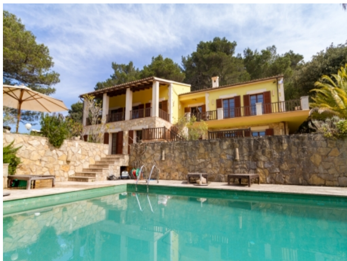
Pool area with sunloungers