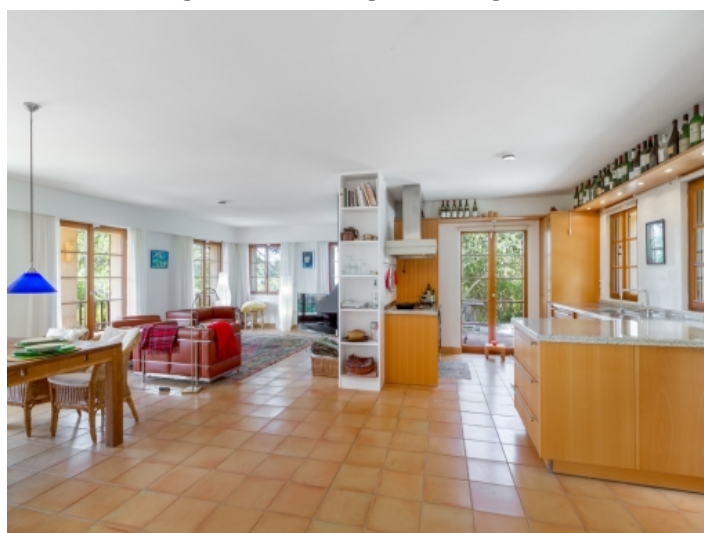
Living area and open kitchen