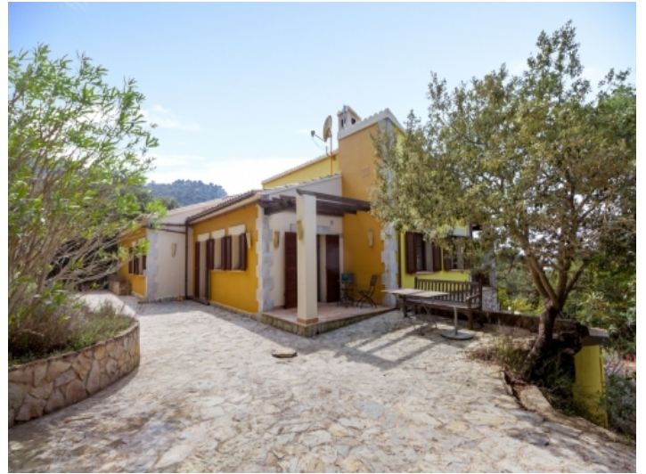
Access to the property