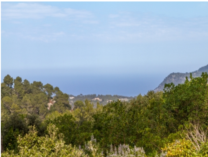
Fantastic sea views