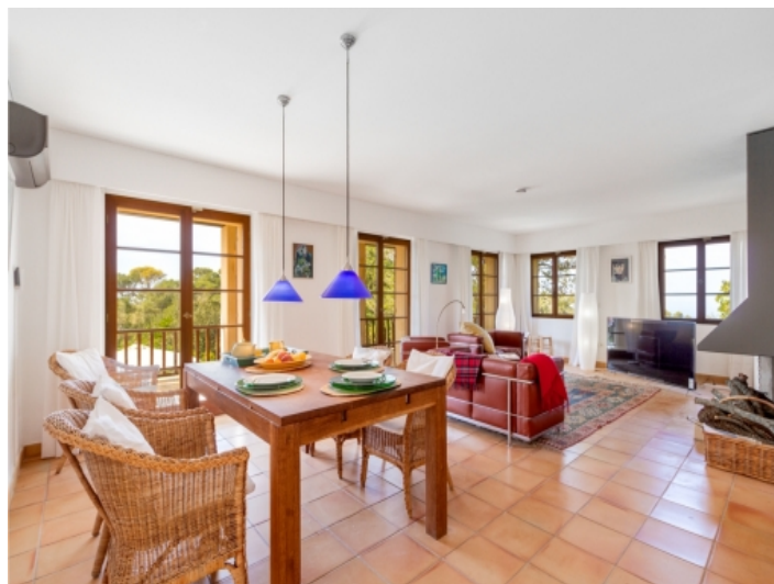
Light-flooded living and dining area