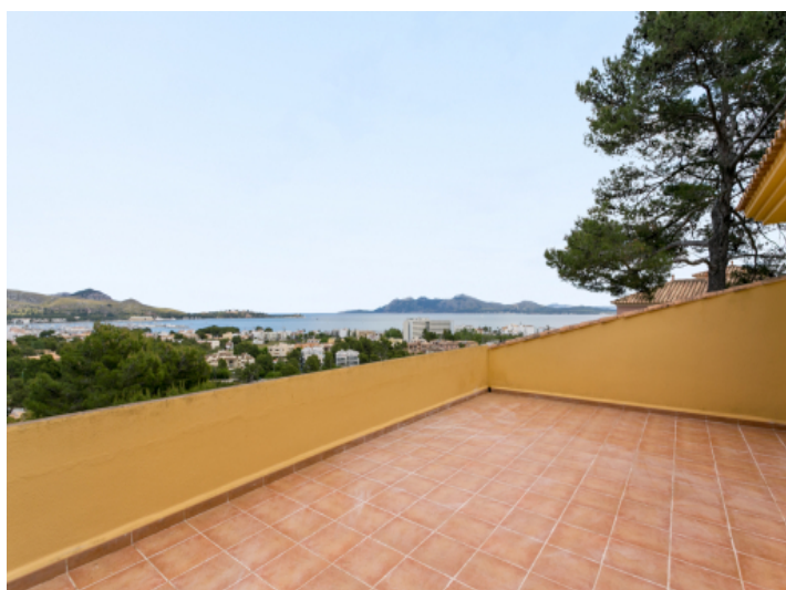
Fantastic seaview-villa in Port Pollensa