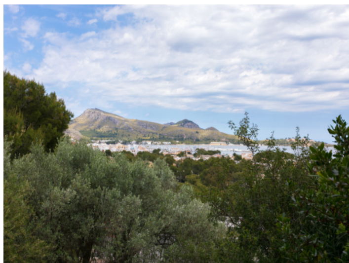
Impressive sea views