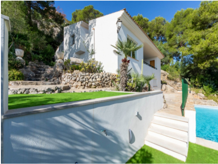
Sunny terrace and pool area