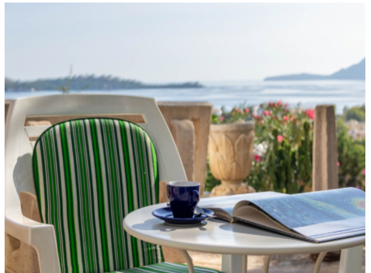
Mediterranean sea views from the terrace