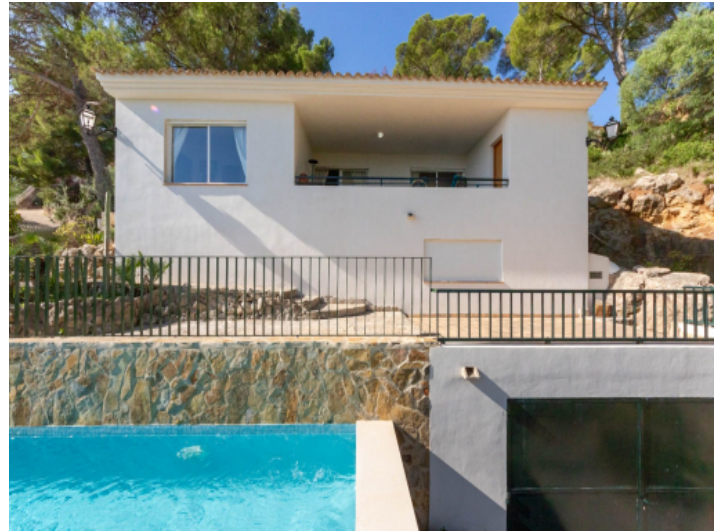
Views from the pool to the villa