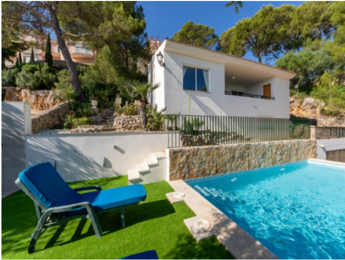
Idyllic pool area