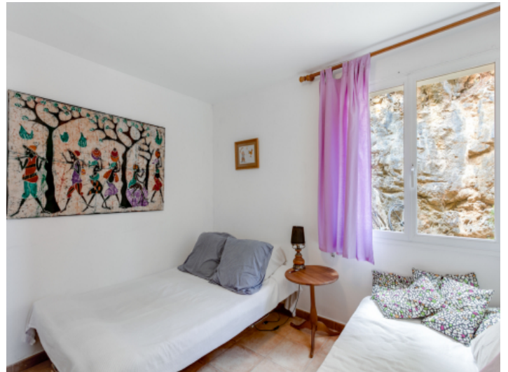
Bedroom with 2 single beds