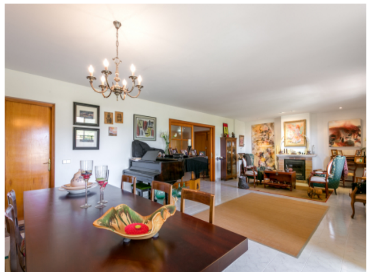
Living and dining area with fireplace