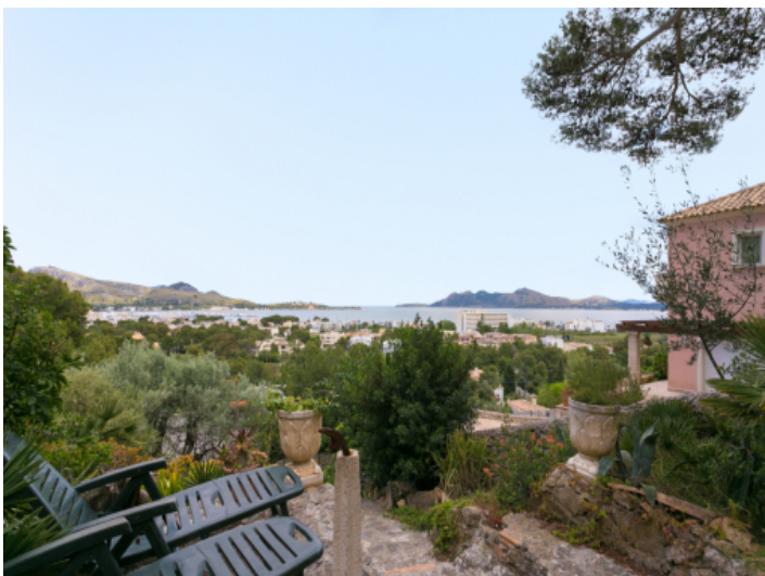
Terrace with panoramic views