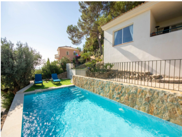
Views from the pool to the terrace