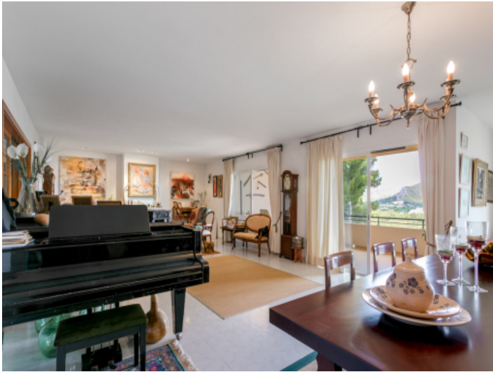
Living and dining area with mountain views