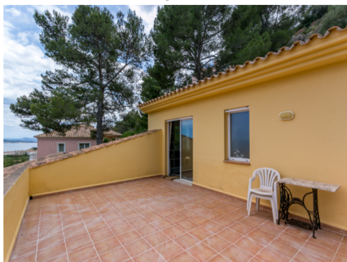
Spacious roof terrace