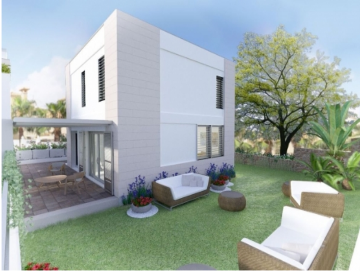
Wonderful garden area