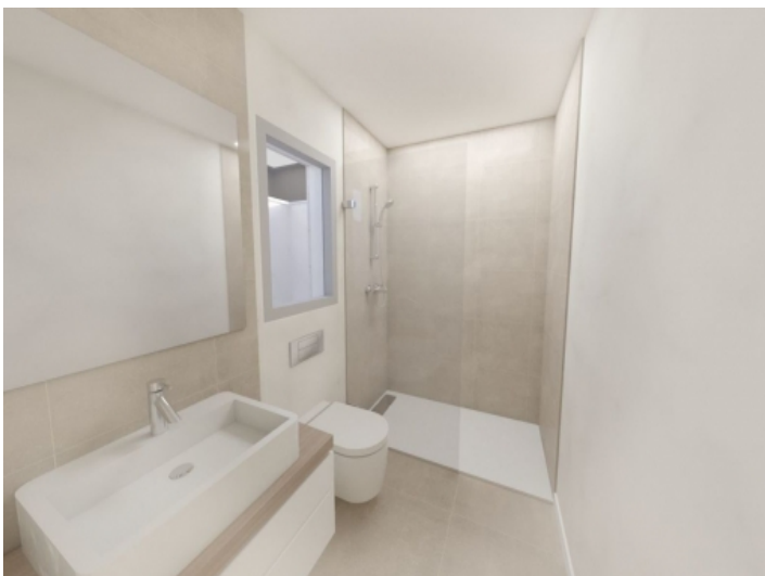
Beautiful bathroom with shower