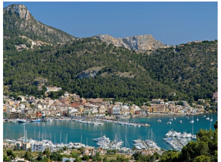
Beautiful view of Port d'Andratx