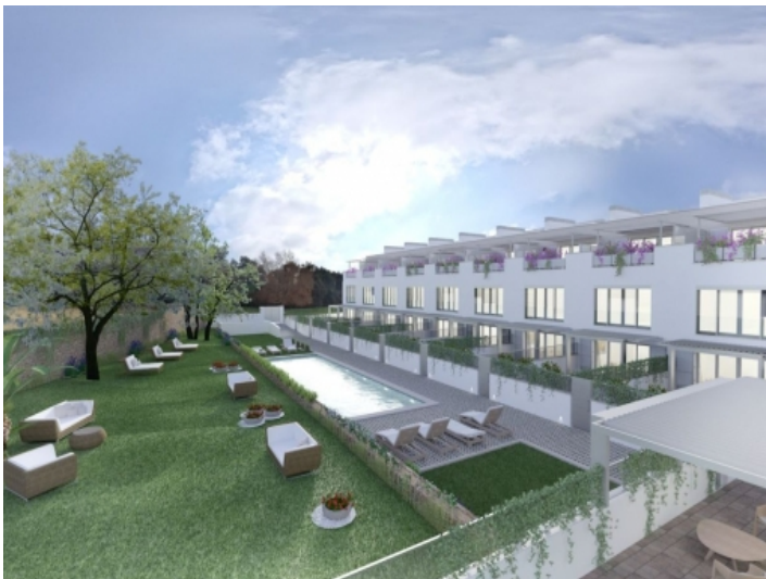
Exterior view of the complex