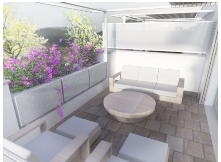
Terrace with cosy chill-out lounge