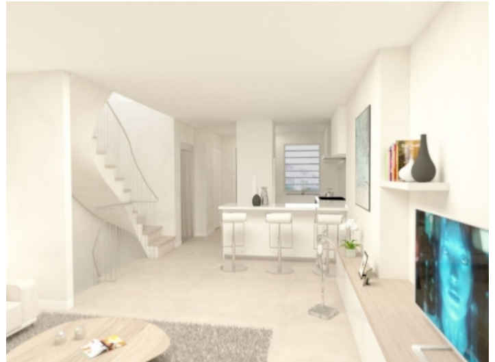
Modern kitchen with staircase