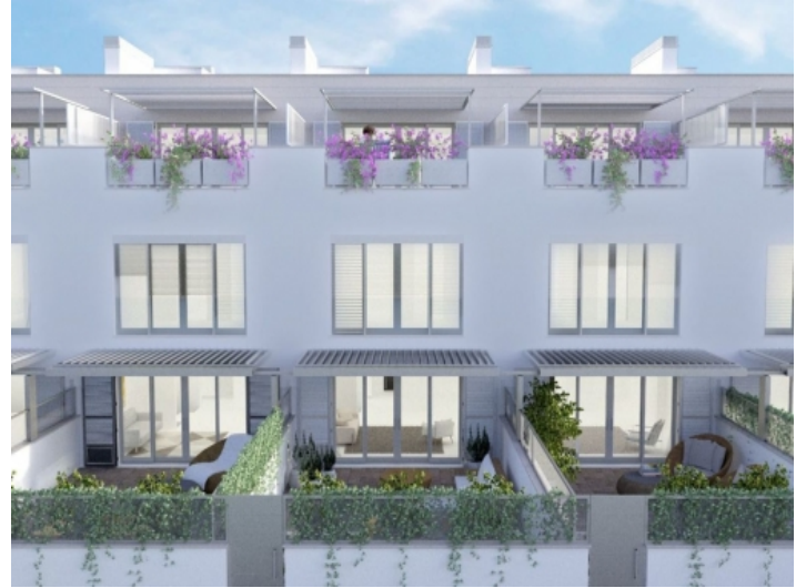
Exterior view of the complex