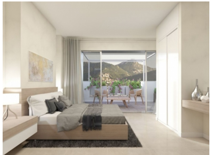
Possible view of the bedroom with mountain views