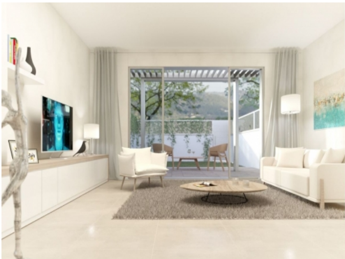
Possible view of the living area