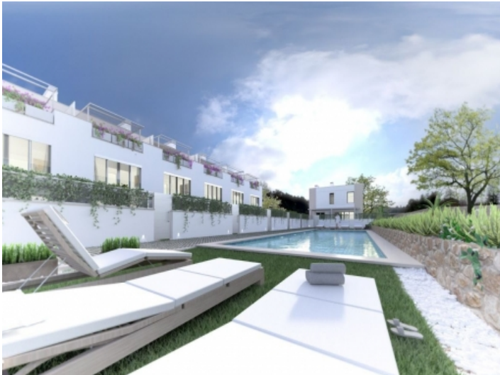
Newly-built residential complex with terrace and pool area in