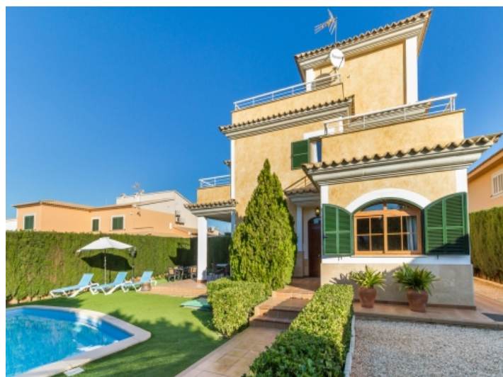
Lovely front view of the house