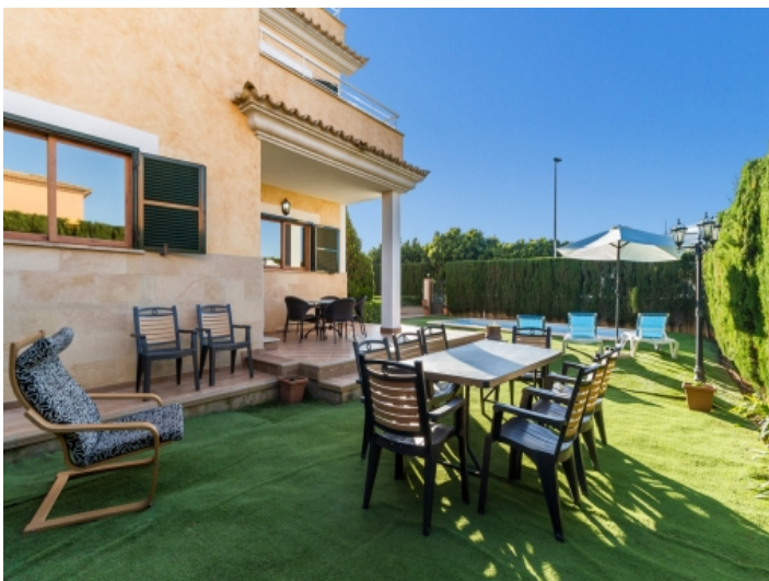
Dining area in the garden