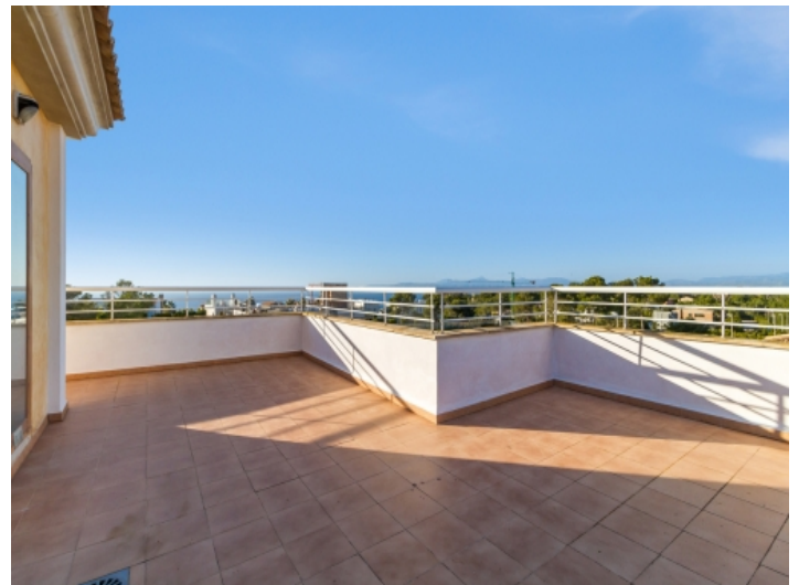
Marvellous terrace with views