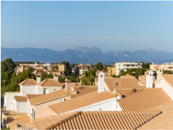
Gorgeous mountain views