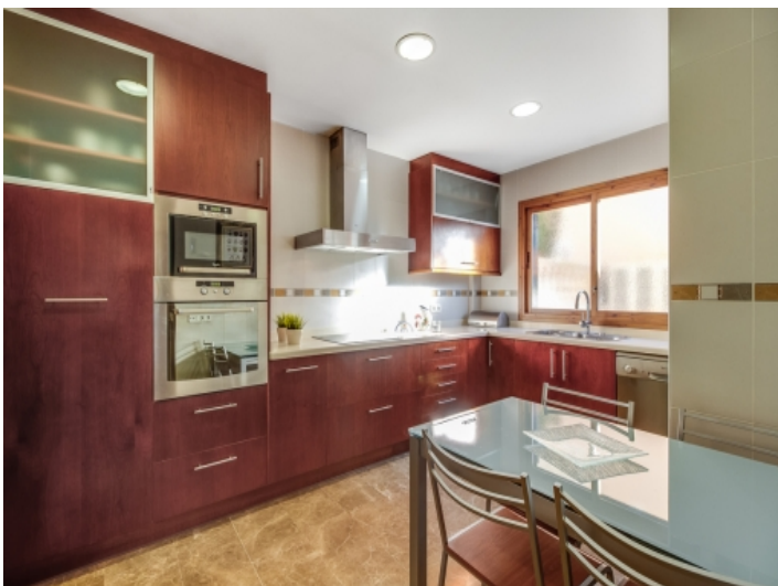
Fully equipped, charming kitchen