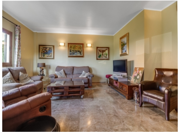
Cosy and spacious living area