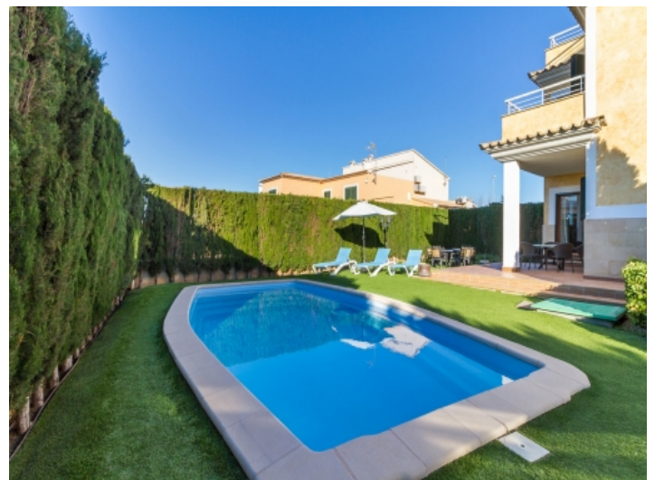
Wonderful pool area