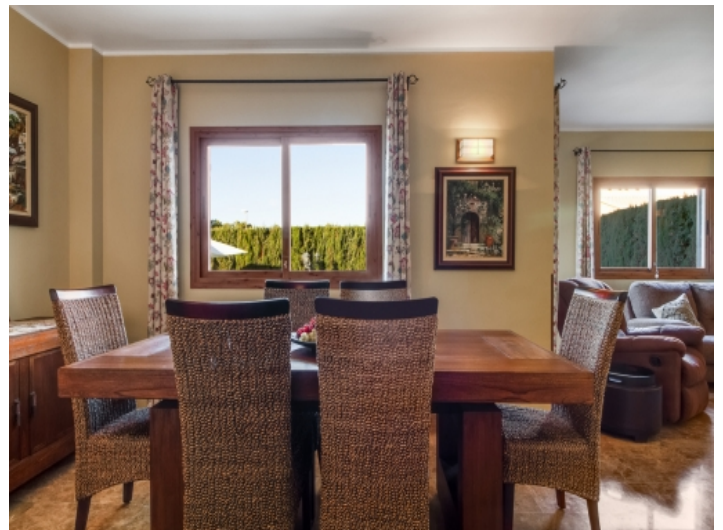
Beautiful, bright dining area