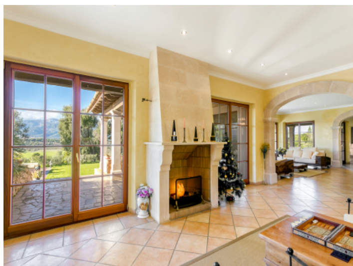
The living area creates a cosy atmosphere