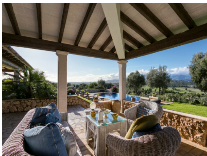
Cosy chill-out lounge on the terrace