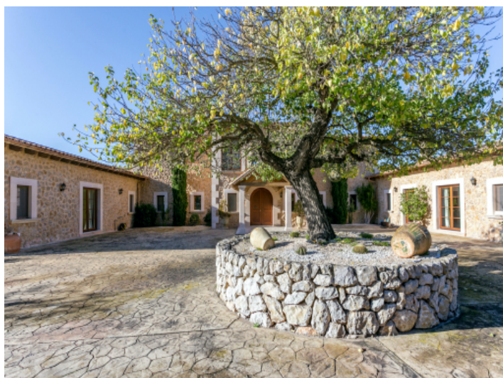
View of the beautiful patio