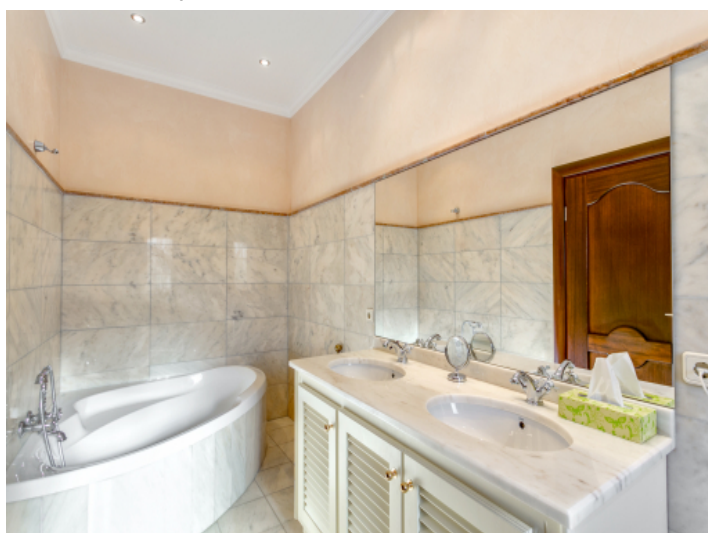
Lovely bathroom with bathtub