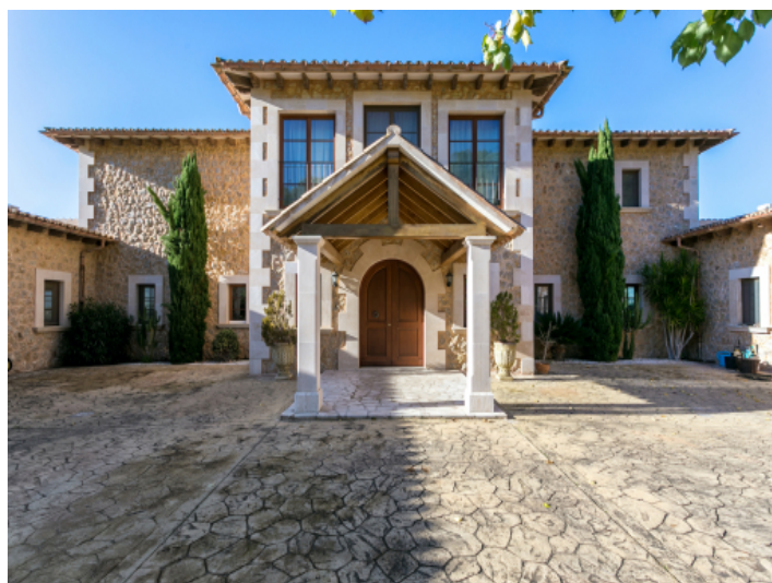
Front view of the finca