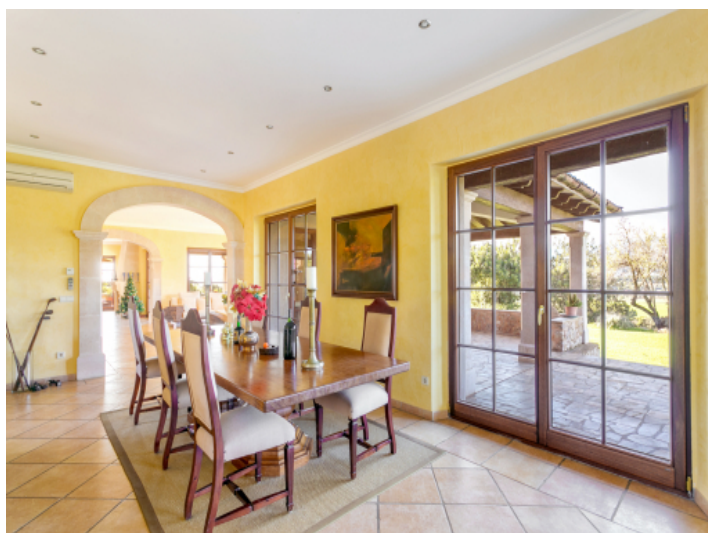
Bright dining area with access to the terrace