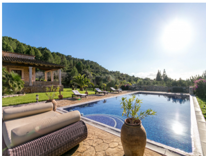
Marvelous pool area with sunbeds