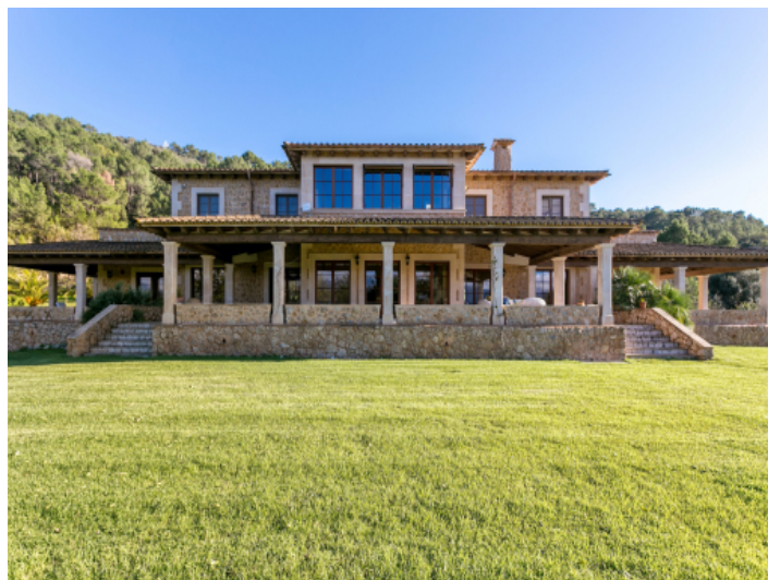
Alternative view of the property