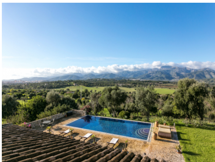
Gorgeous mountain views