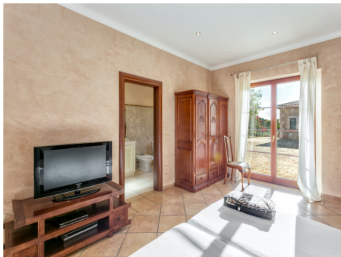
Further bedroom with bathroom en Suite