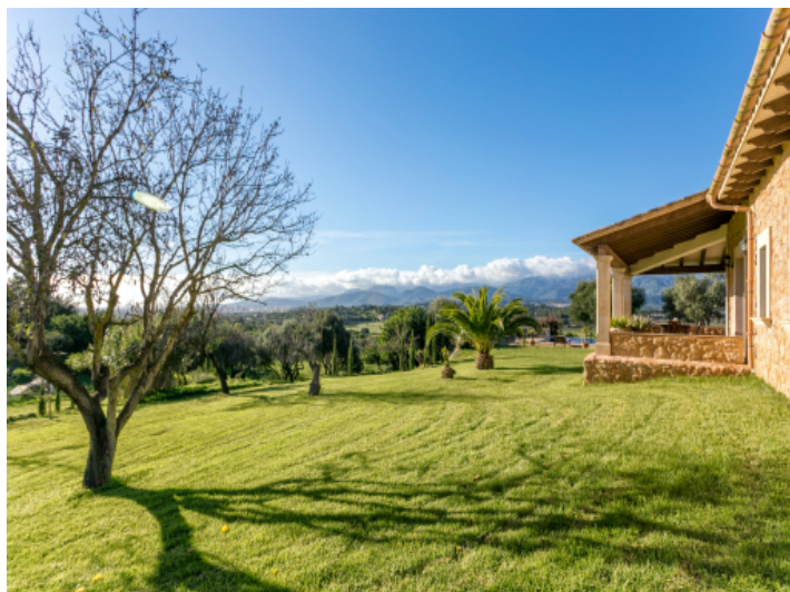
Outdoor area of the finca