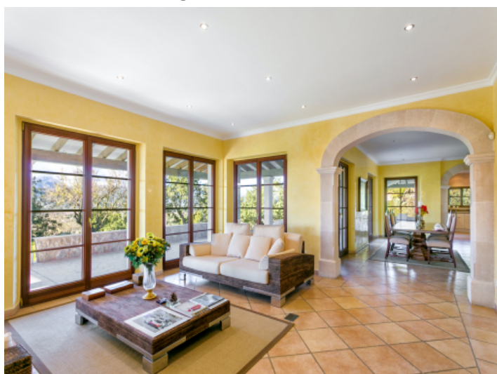
Light-flooded living area with large windows