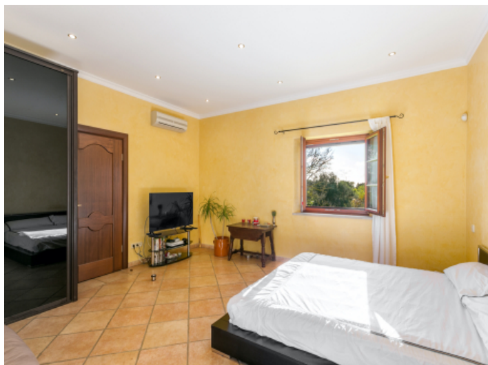
Spacious bedroom with double bed