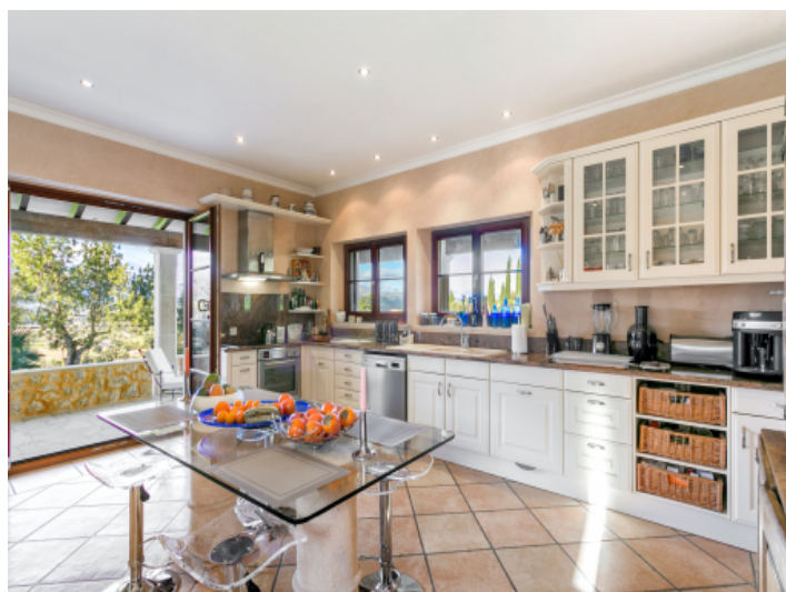
Large kitchen with further dining area