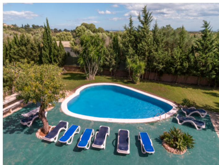
Views to the pool and garden