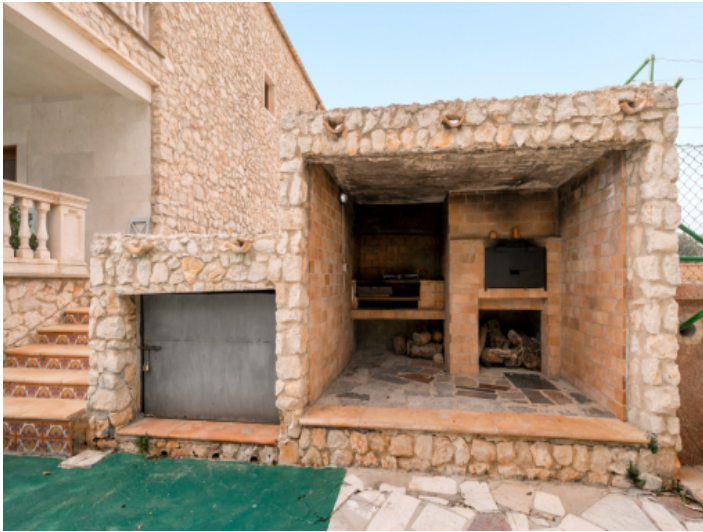
Mallorca barbecue area