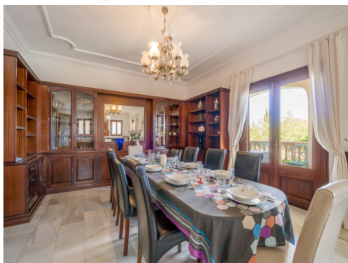
Spacious dining area