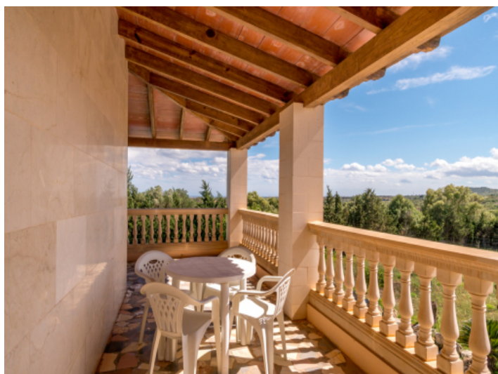
Balcony with sweeping views