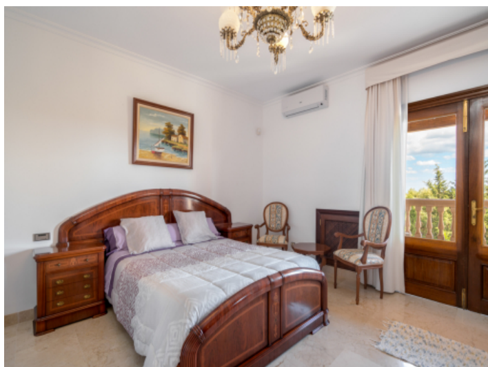
One of 5 double bedrooms