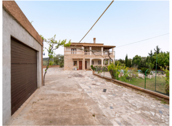
Access to the finca