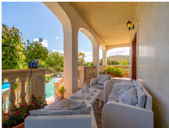
Lovely terrace with access to the pool