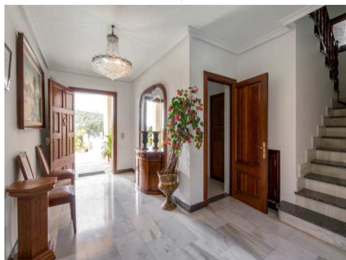
Entrance area with access to the upper floor