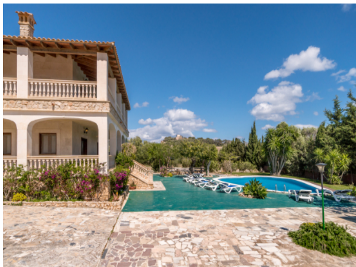
Large, private pool area