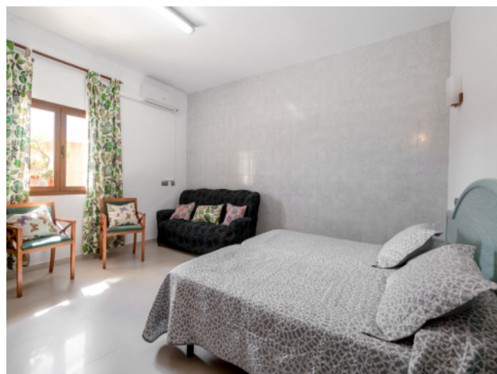
Bedroom with separate entrance