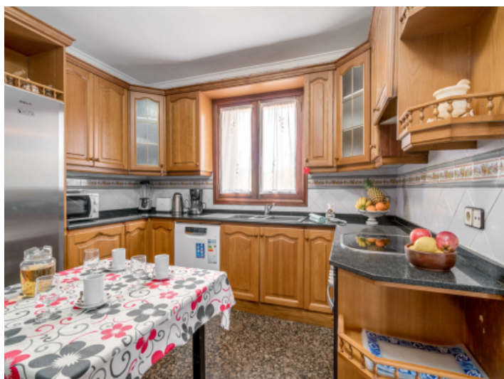
Wooden kitchen with dining area