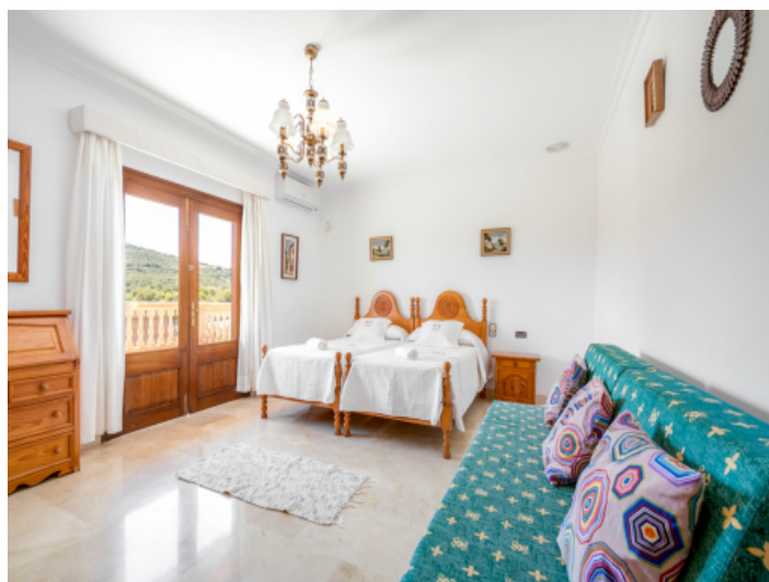
Bedroom with balcony access