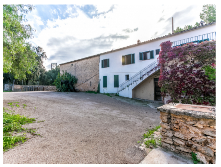
Large outdoor area of the finca