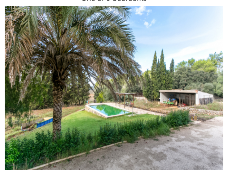
Pool area with small shed