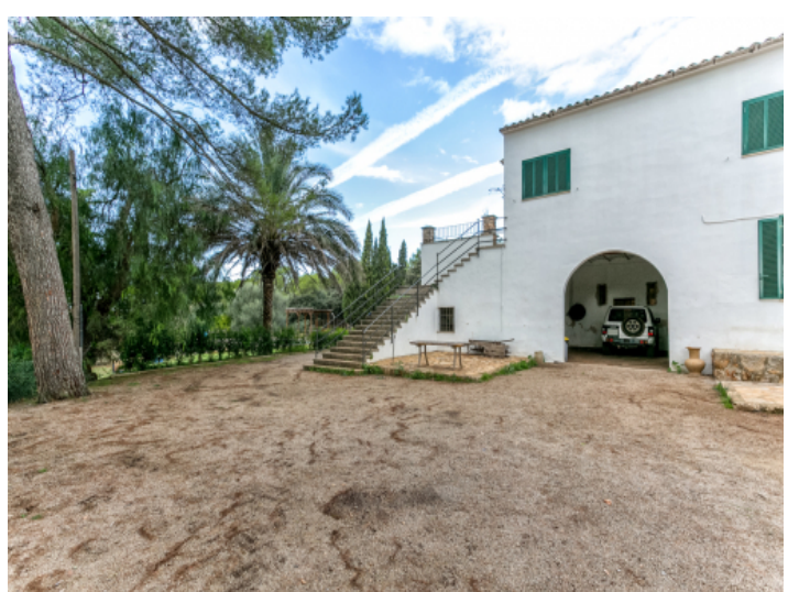
Exterior view of the finca