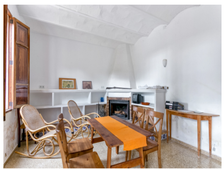
Charming dining area with fireplace