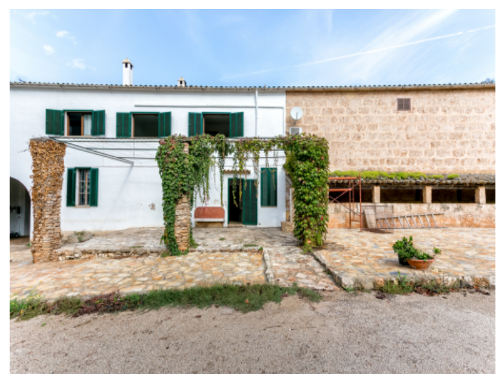
Front view of the rustic finca