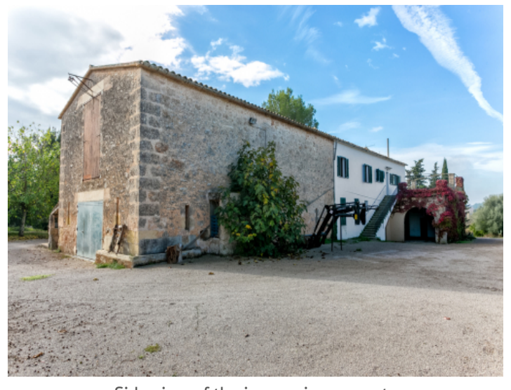
Side view of the impressive property