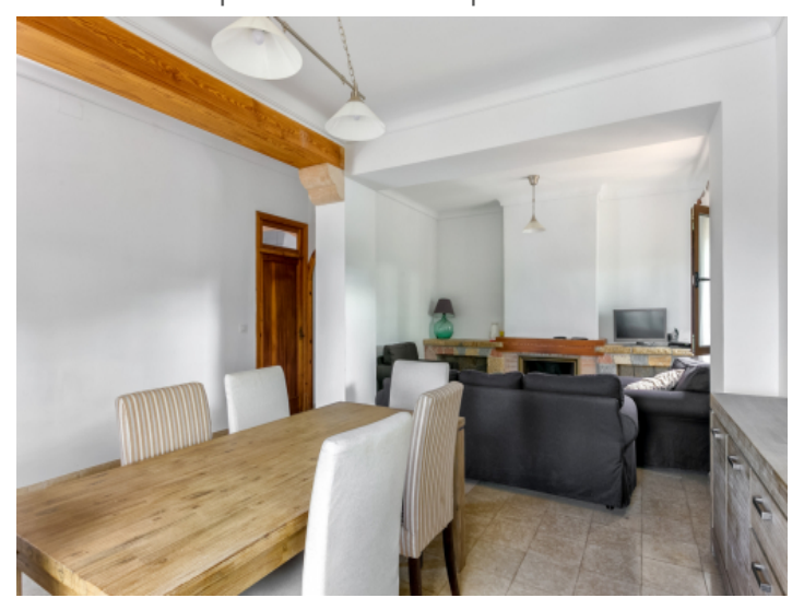
Living and dining area with fireplace