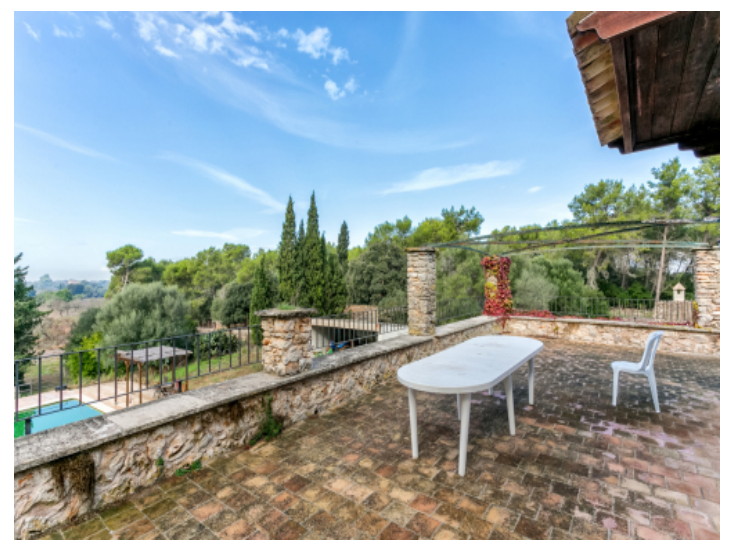
Spacious terrace with pool views