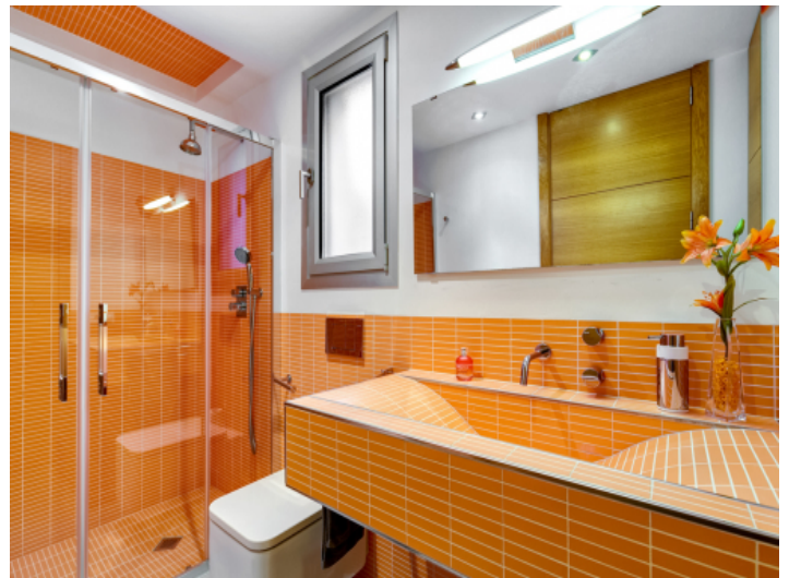
The second bathroom in orange