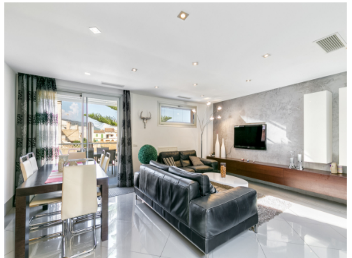
Modern living and dining area with terrace