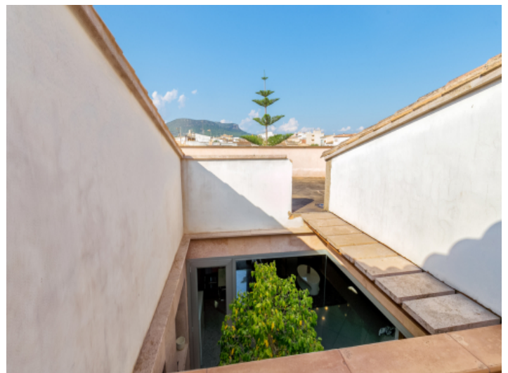
Modern patio and roof terrace