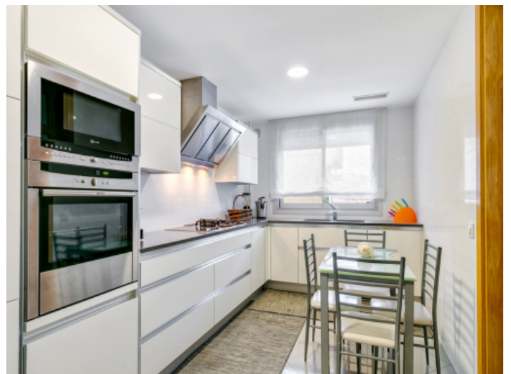
High quality kitchen with dining area