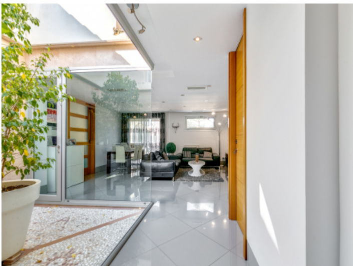
Modern living concept