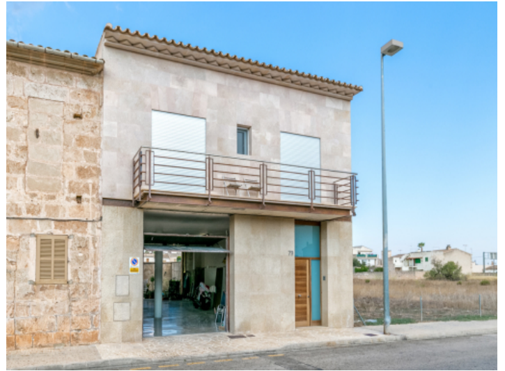
Exterior view of the town house