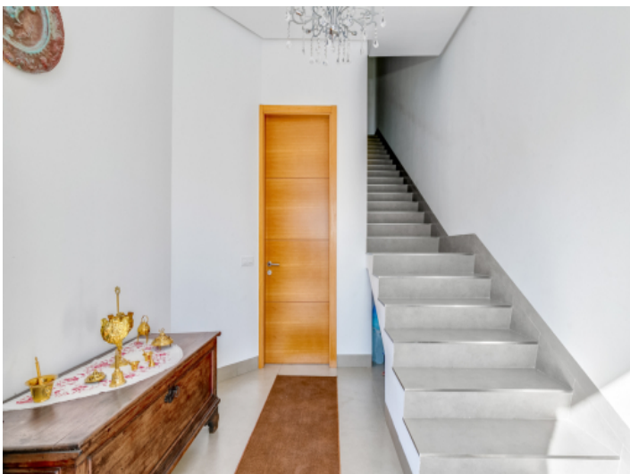
Attractive access to the living area