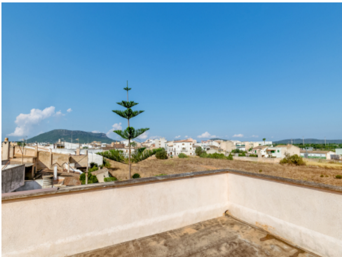
Roof terrace with beautiful views