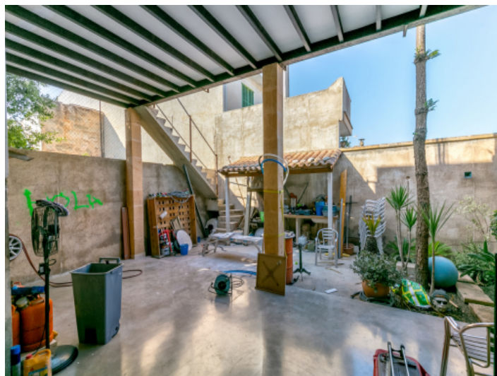
The outside area offers ample space