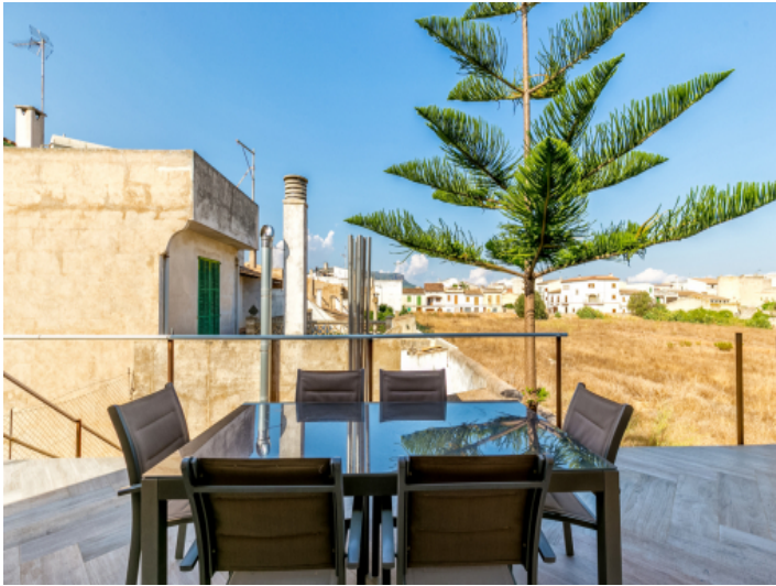
Terrace with views over the surroundings