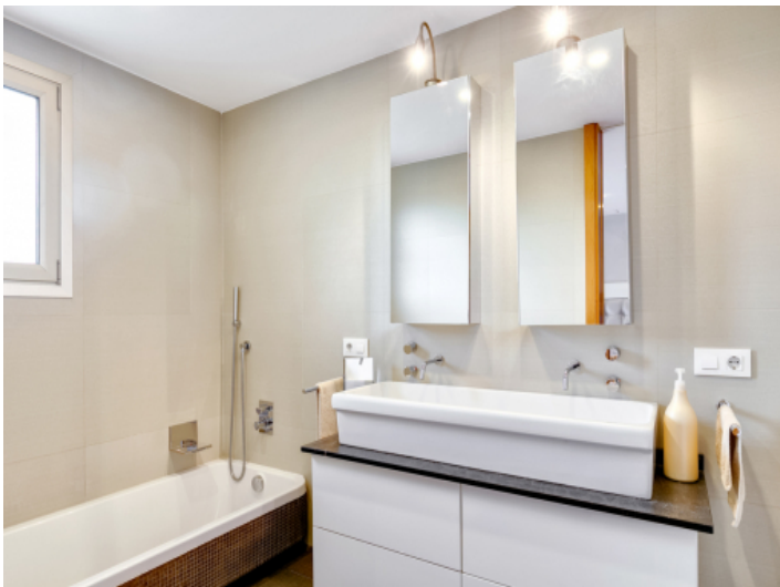
Elegant bathroom with bathtub