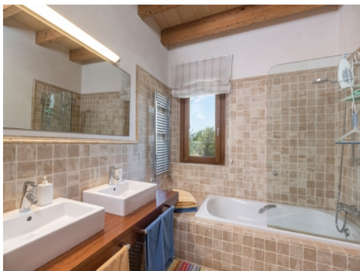
Charming bathroom with double sink and bathtub