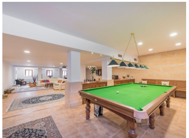
Extensive poolroom with lounge area