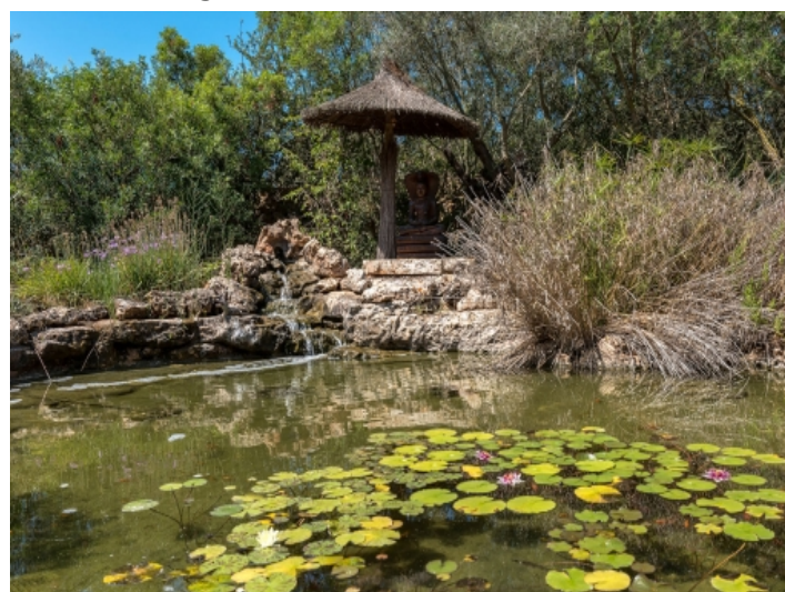
This artificial pond is part of the outdoor area