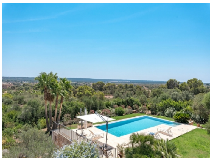
View from the terrace to the kempt pool area