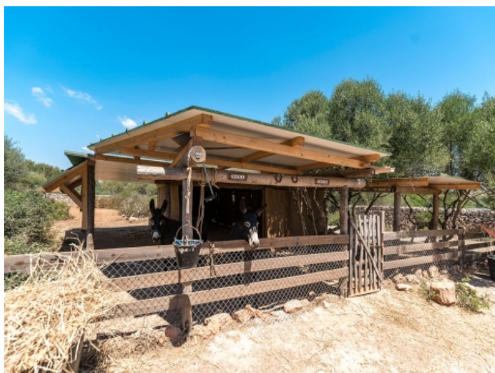
Stable for horses or donkeys