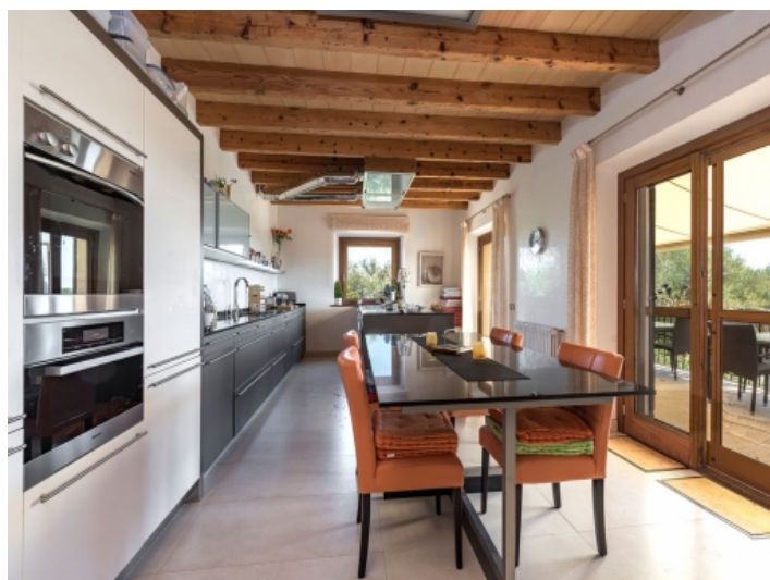
Modern and fully equipped kitchen