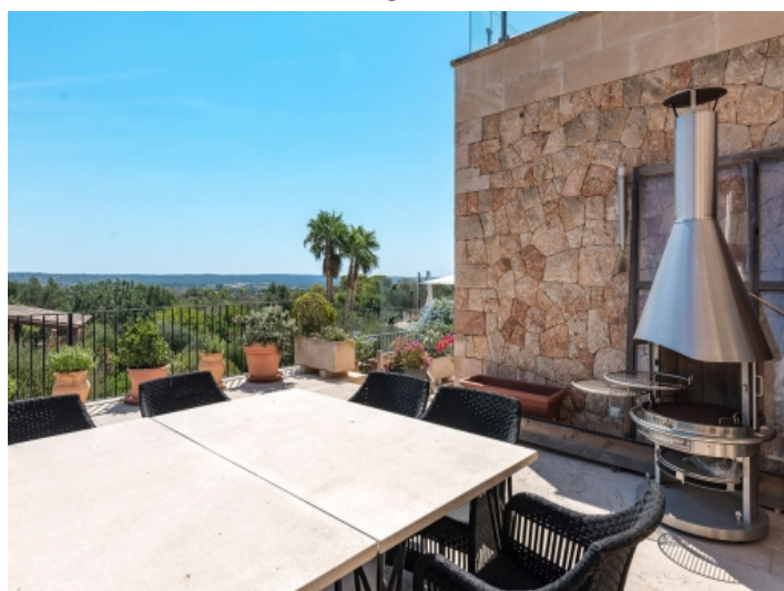
Sun terrace with BBQ area