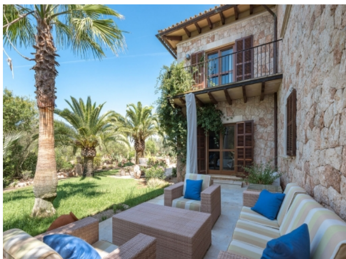
Another terrace of the finca with lounge furniture