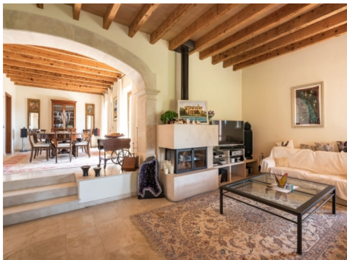
Rustic living room with fireplace for colder days