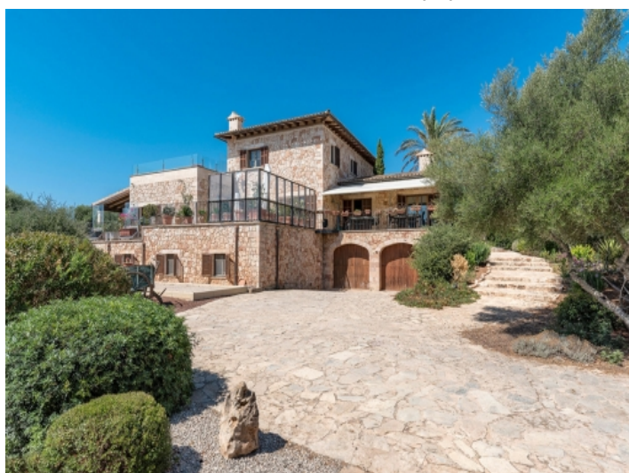
Front view of the finca with several terraces