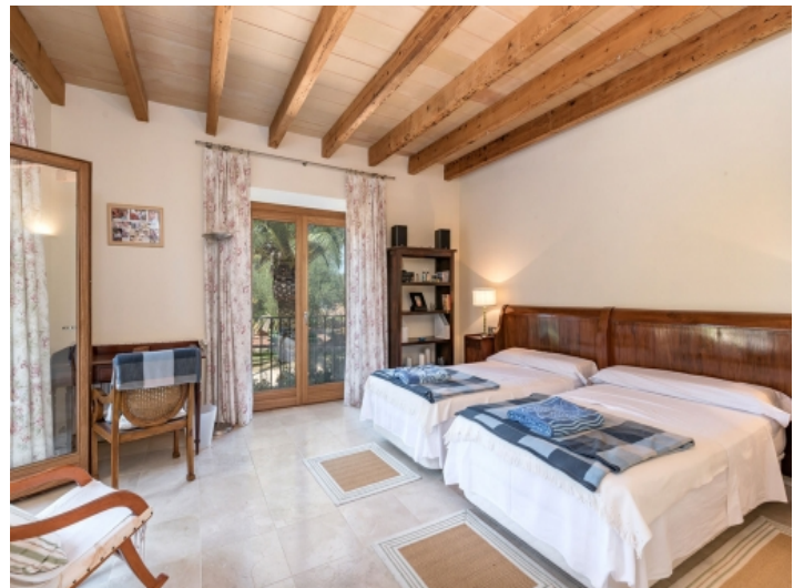
Another bedroom with access to the outdoor area