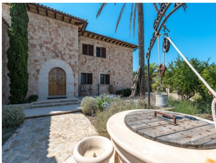
Welcoming entrance area with font