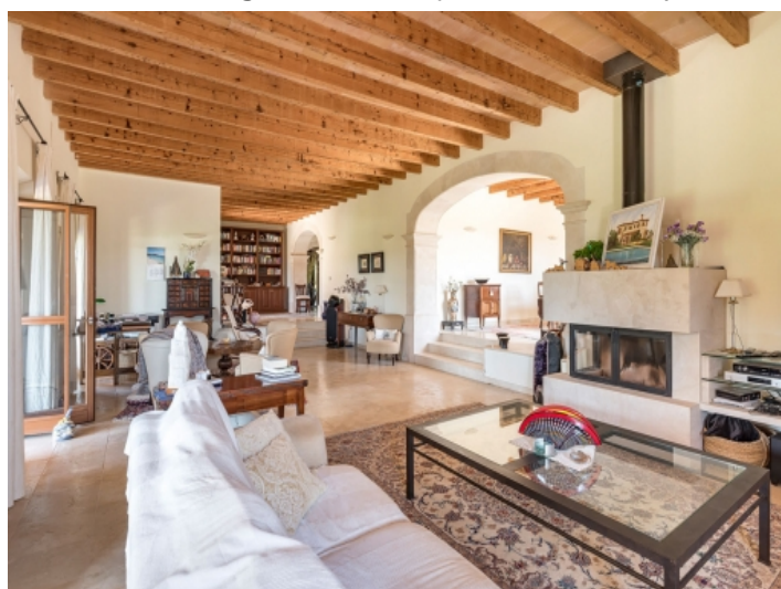
Alternative view of the living area