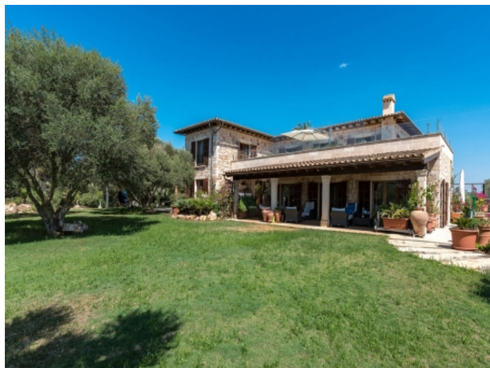
Fantastic garden area