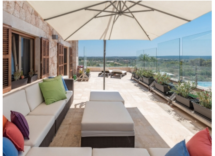
Lounge area with stunning view to the pool