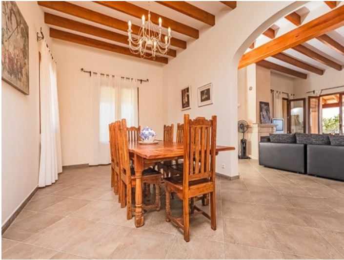
Bright dining area