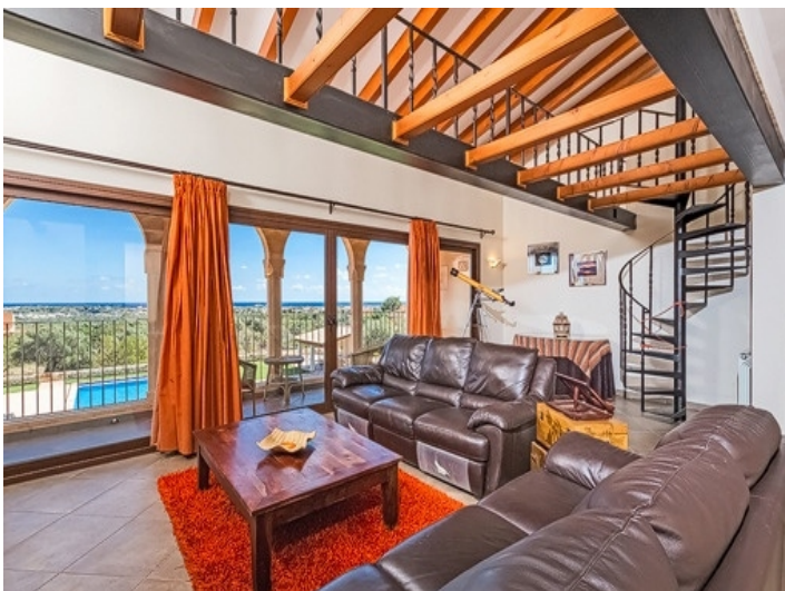
Bright living area on the upper floor