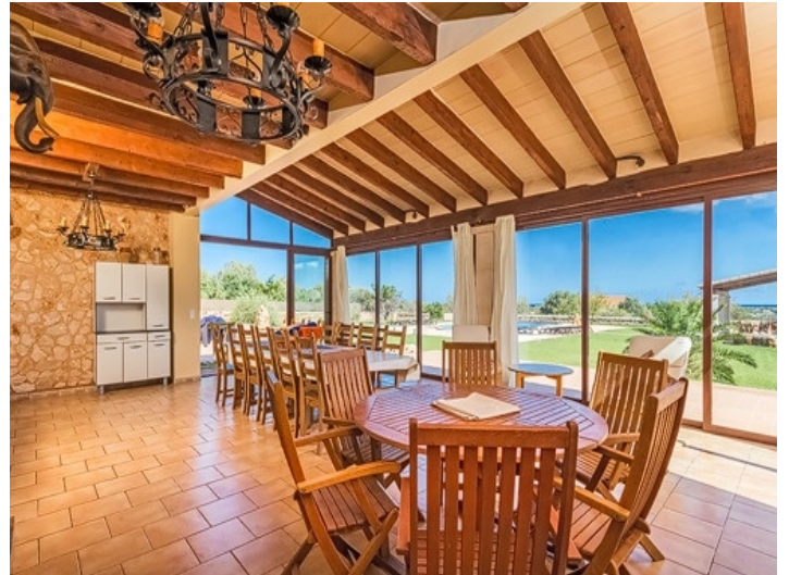
Covered terrace with panoramic windows