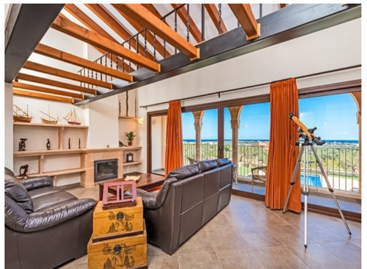
Light-flooded living area with fireplace