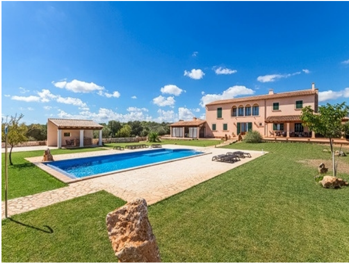
Finca with large plot of 21,000 sqm