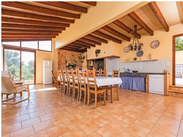
Spacious dining area