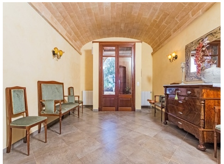
Antique entrance area