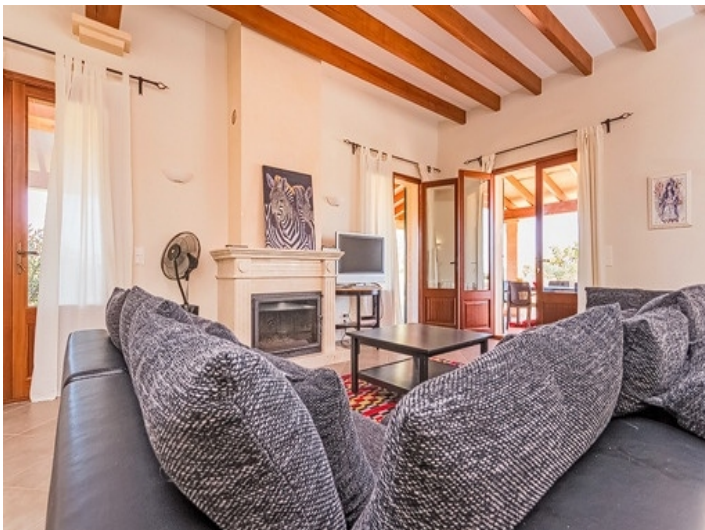
Cosy living area with fireplace