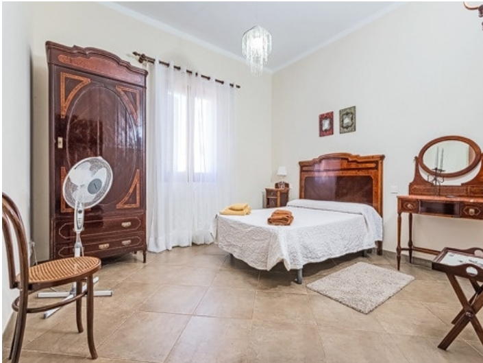
One of six bedrooms