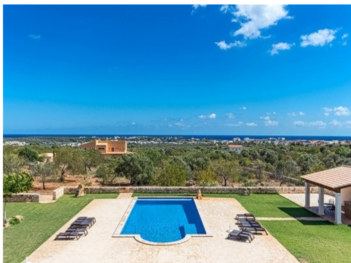
Fantastic view of the sea and the garden