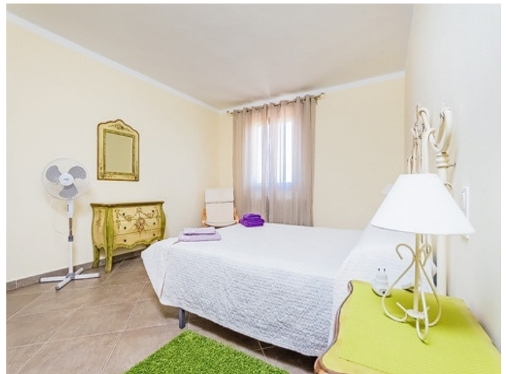
Spacious master bedroom