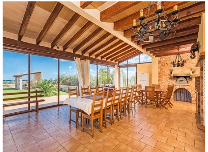
Alternative view of the dining area