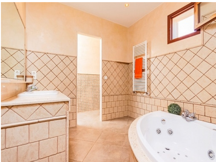
Master bathroom with bath tub