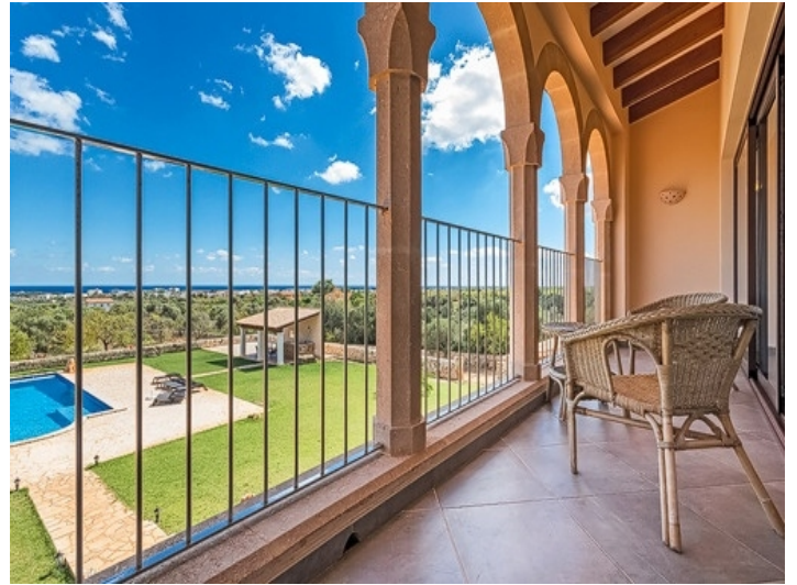
Beautiful sea views