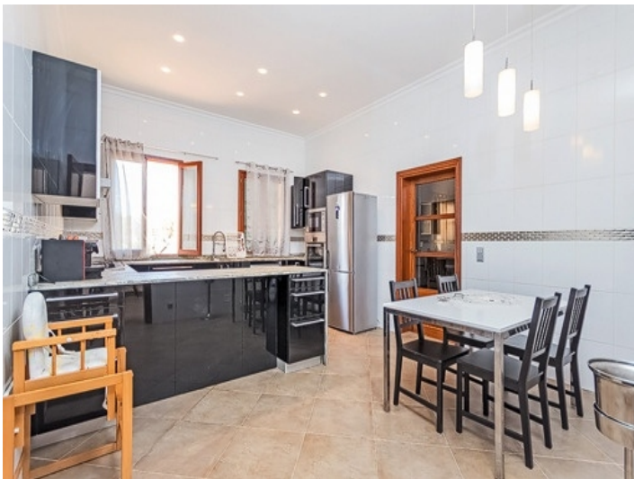
Alternative view of the kitchen