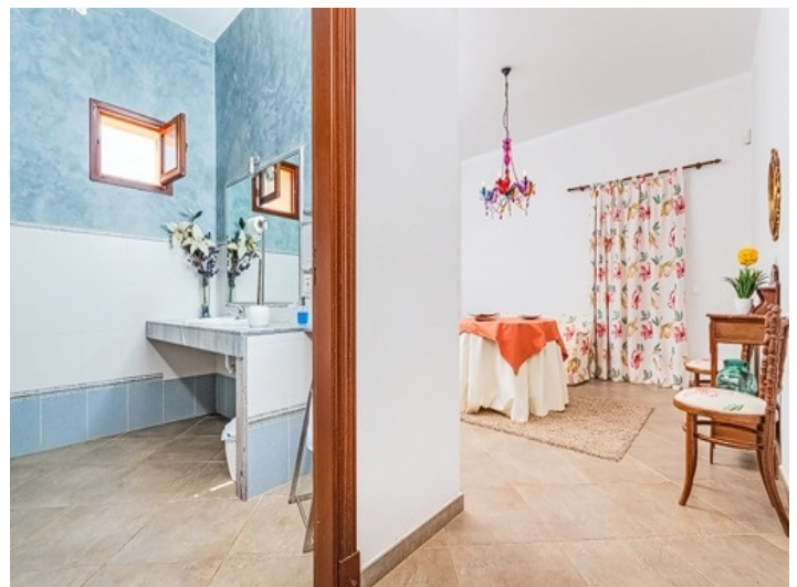
Bedroom with bathroom en suite