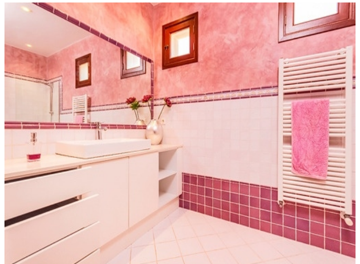
Further bathroom with heating