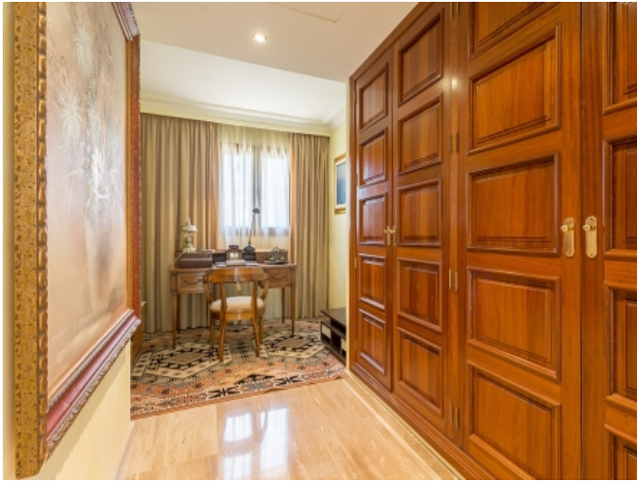
Further office corner with roomy fitted wardrobes