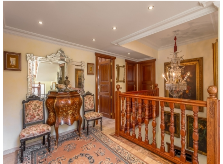
Open gallery on the upper floor