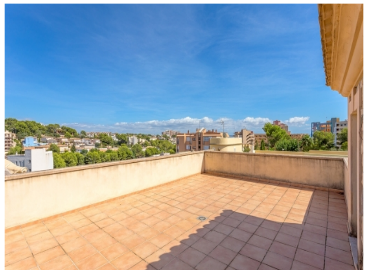
The large roof terrace offers views to the surroundings