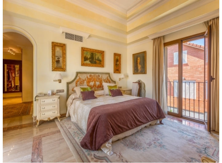
Master bedroom with dressing area