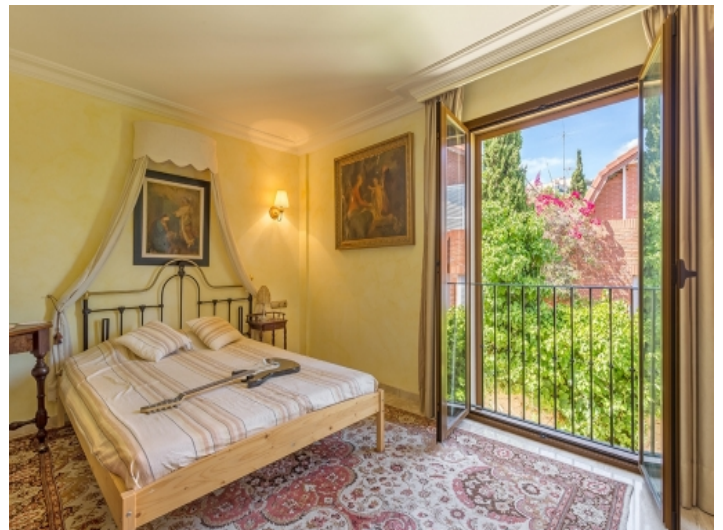
One of 8 bedrooms with natural light