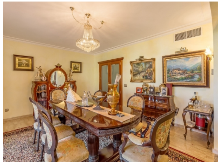
Dining area with antique furniture