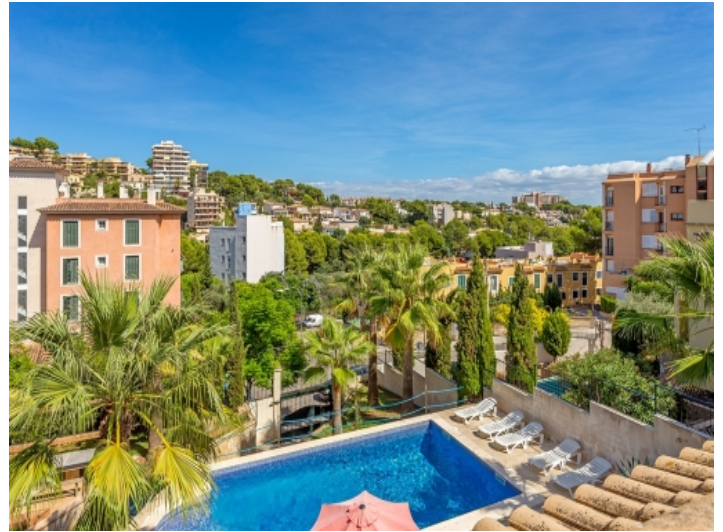
Views to the beautiful pool area