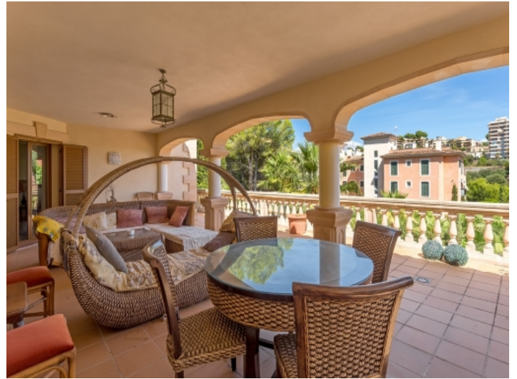
Covered terrace with lounge and dining area