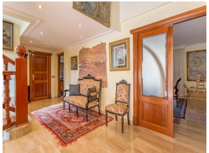
The generous house was built in 2004