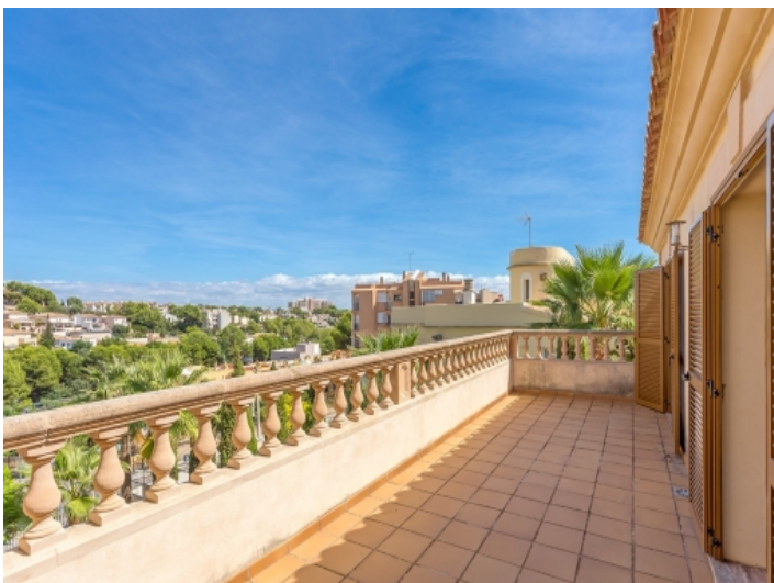
Balcony of 30 sqm with lovely views