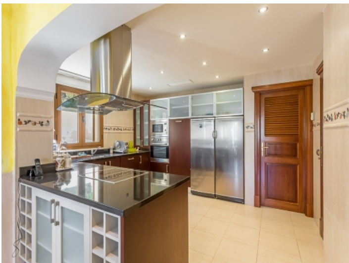
Fully equipped kitchen with cooking island