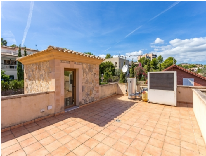
90 sqm roof terrace