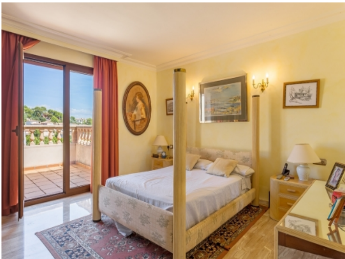
Double-bedroom with terrace access