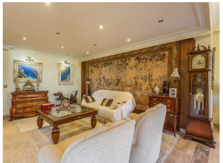
Living area in a traditional style