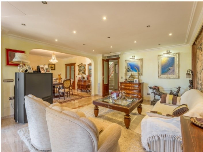
Spacious living and dining area of 100 sqm