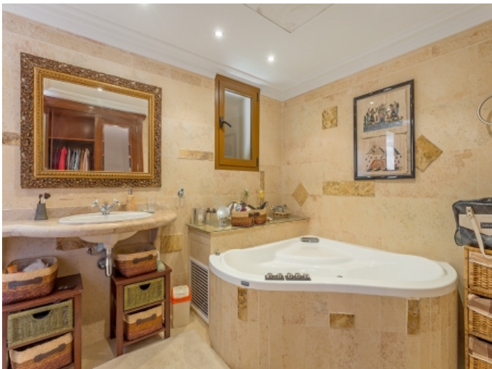
Master bathroom with large hydro-massage bathtub