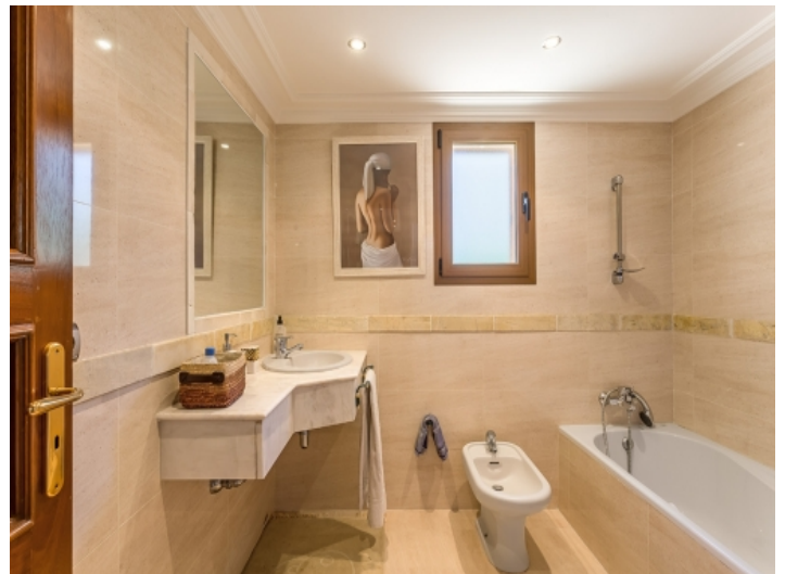
One of 8 en suite bathrooms