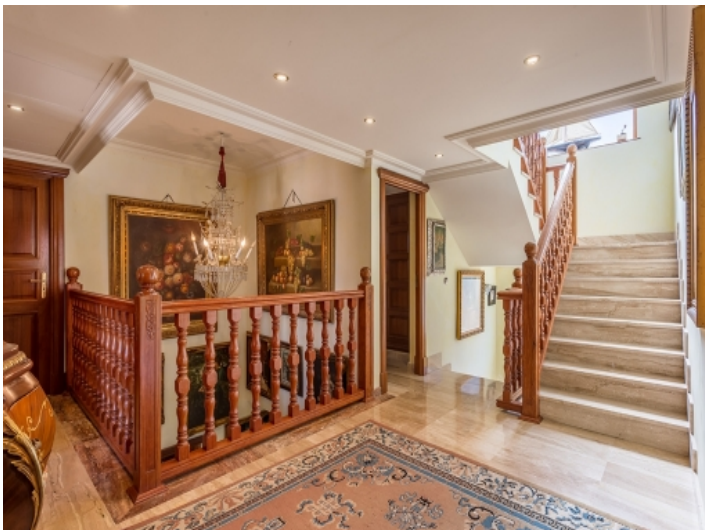
The impressive house has a living surface of 668 sqm