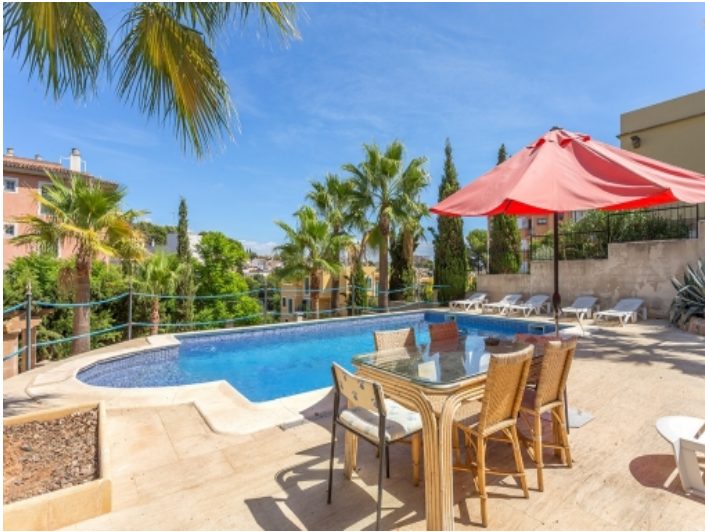
Wonderful pool area for summer days