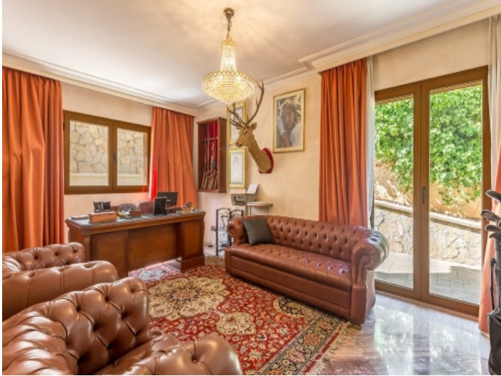
Office with seating area and access to the outside