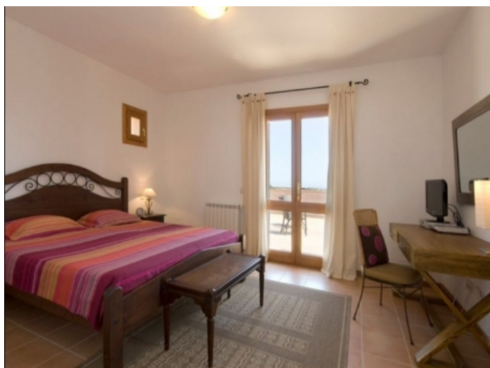
Bedroom with access to the terrace