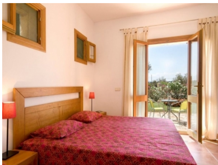
Bright double bedroom