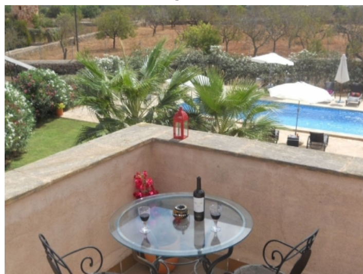
Seating area on the balcony