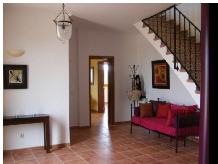
Entrance hall and staircase