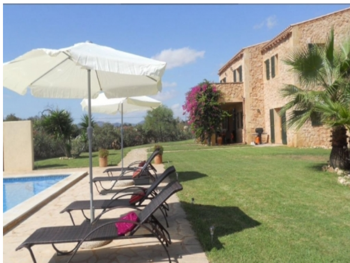
Garden and pool area