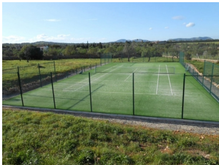
Fantastic tennis court