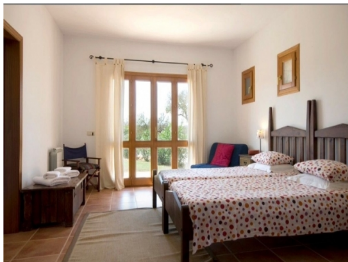
Double bedroom with bathroom en suite