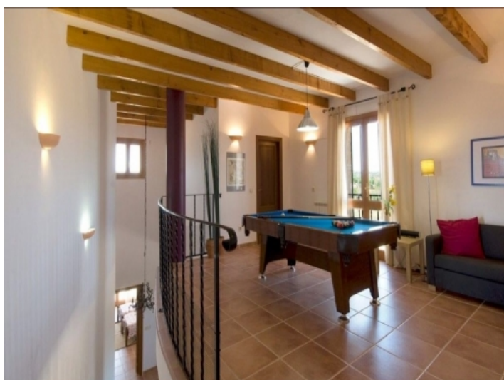
Chillout area with billiard table