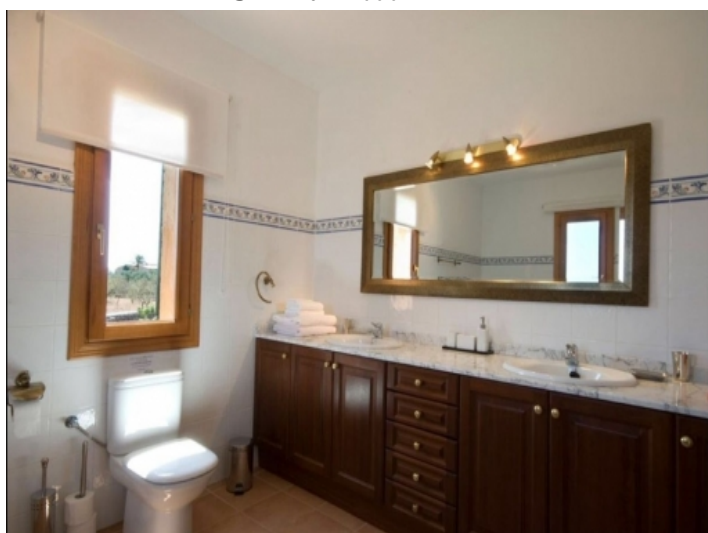
Bathroom with double washbasin