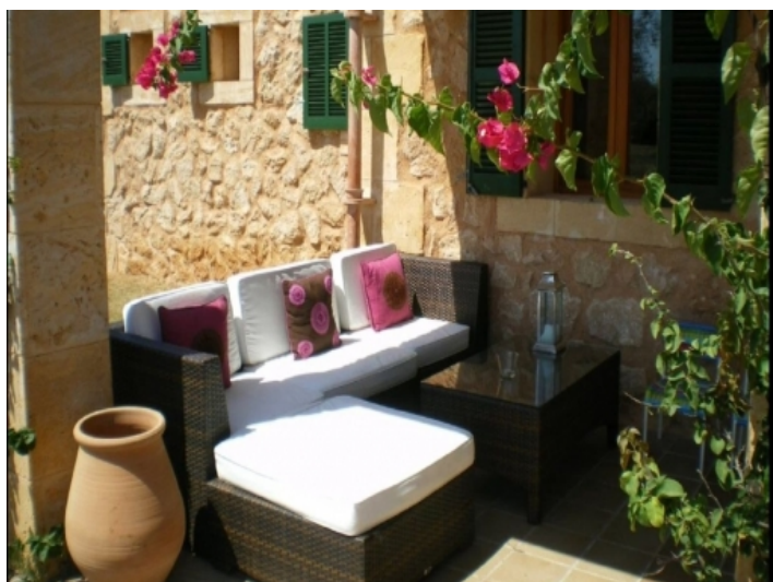
Idyllic, covered chillout area