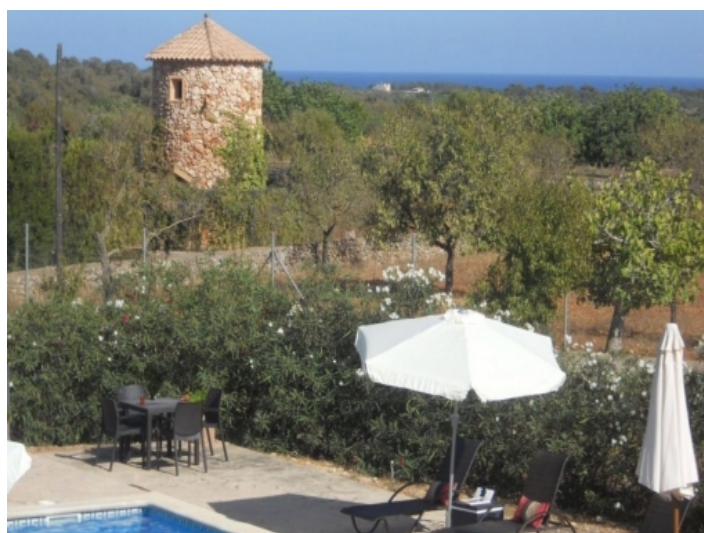
Landscape and sea views