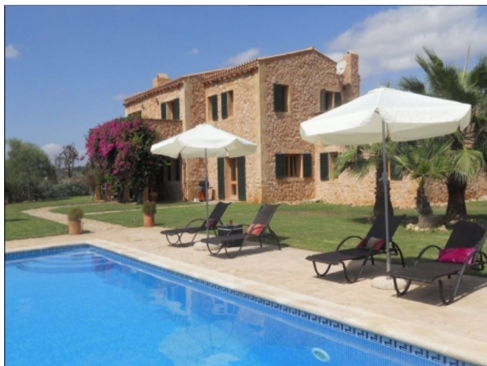
Beautiful pool and garden