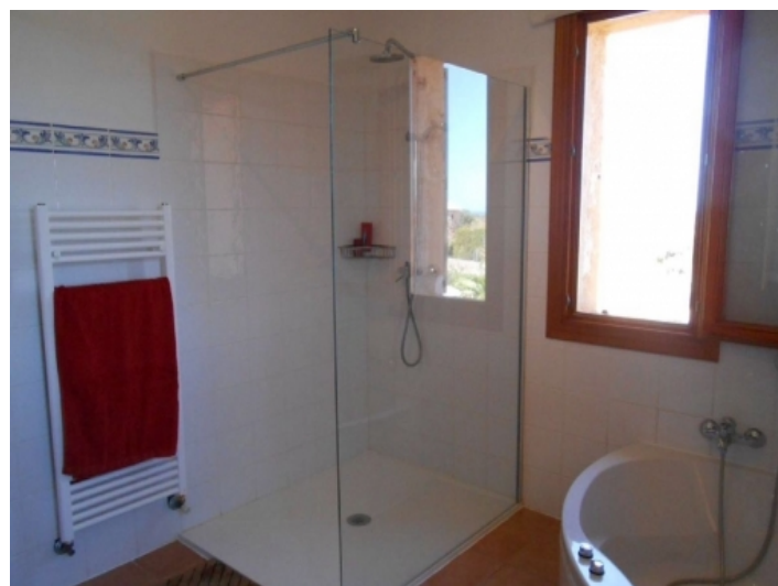
Bathroom with natural light and comfortable bathtub