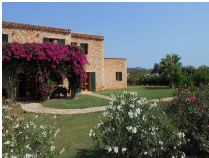
Exterior view from the backside