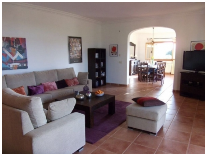
The finca has a living area of approx. 335 sqm