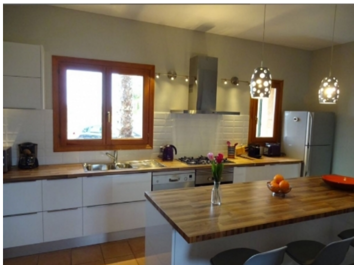
Large, fully euqipped kitchen