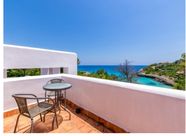
Terrace with fantastic sea views

PORTA MALLORQUINA • C./ COLOM 20 2°, 07001 PALMA, SPAIN TEL.: +34 971 698 242 • INFO@PORTAMALLORQUINA.COM • WWW.PORTAMALLORQUINA.COM