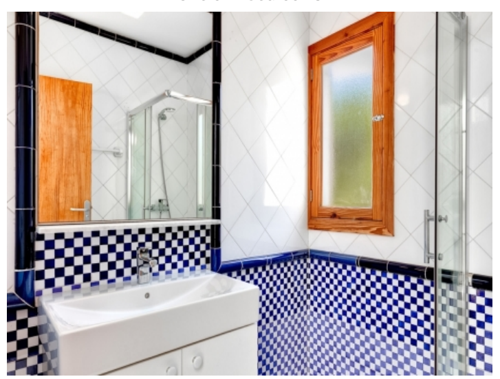
One of 4 bathrooms