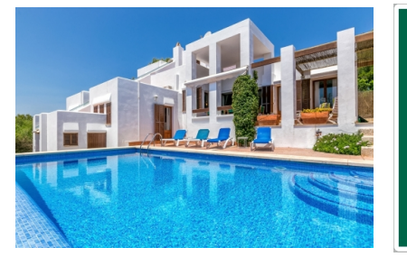
Cala Mandia search for property MAL-110749