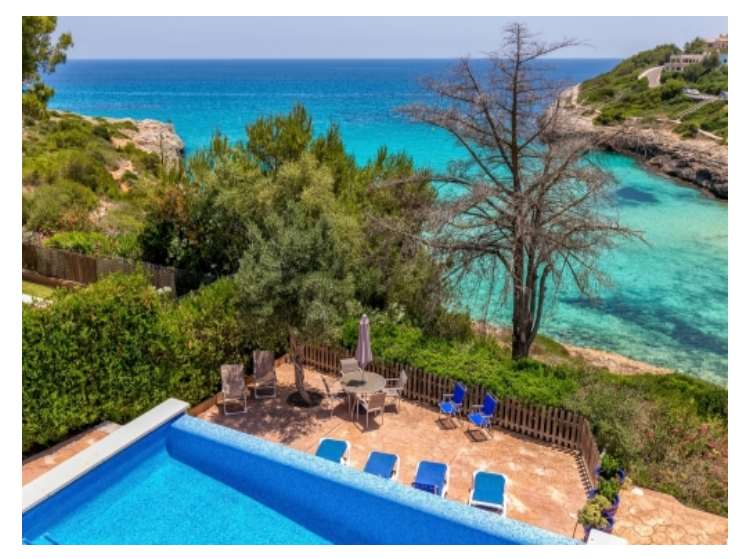
Located in first sea line