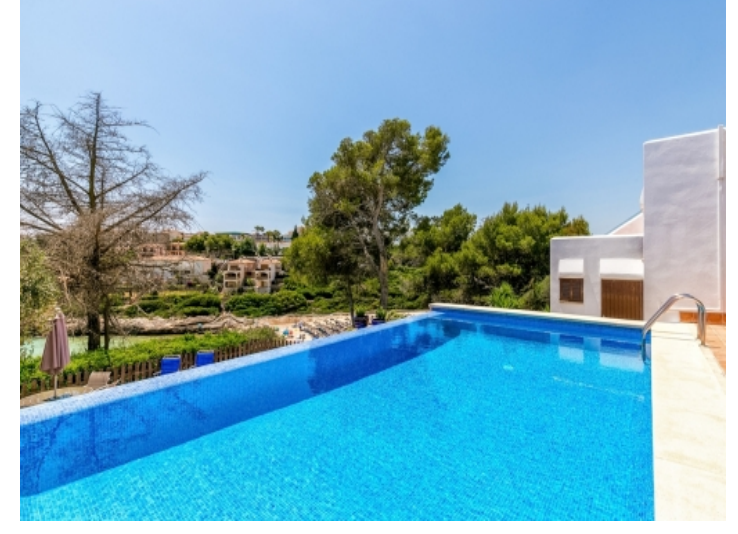
Large pool with views of the beach