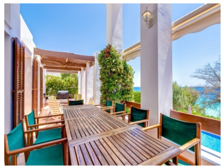
Spacious terrace with dining area and barbecue