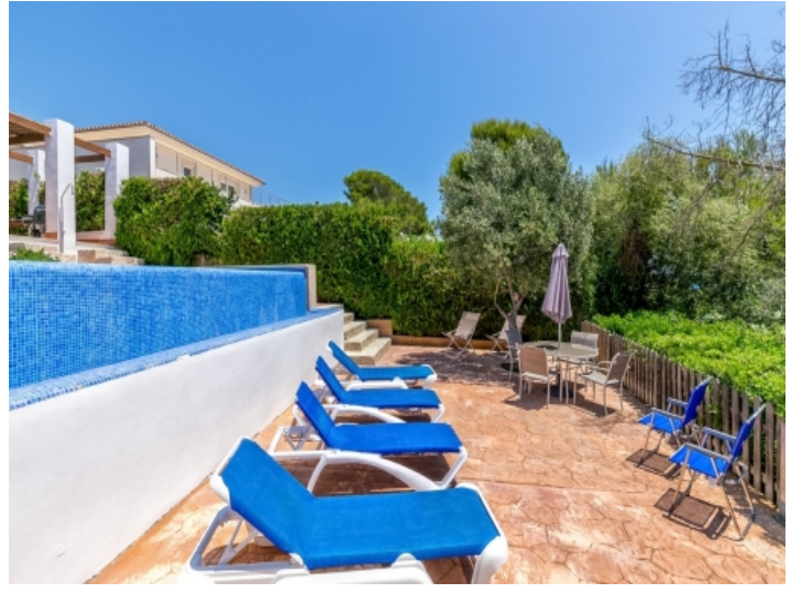
Lounge area beside the pool