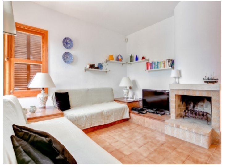
Living area with fireplace