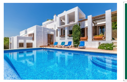
Cala Mandia search for property MAL-110749