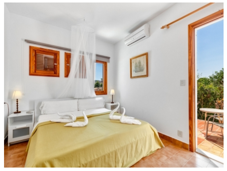
One of 4 bedrooms