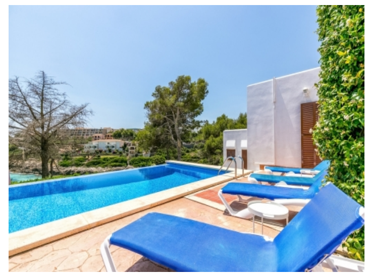
Sunny pool area with sea views