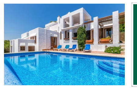
Cala Mandia search for property MAL-110749