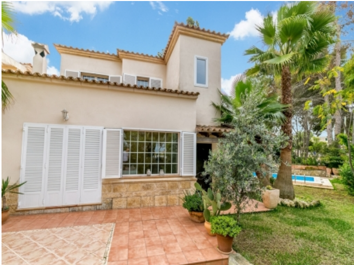
The house is surrounded by a beautiful, 550 sqm garden