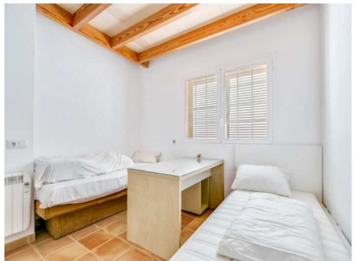
Comfortable bedroom with two single beds