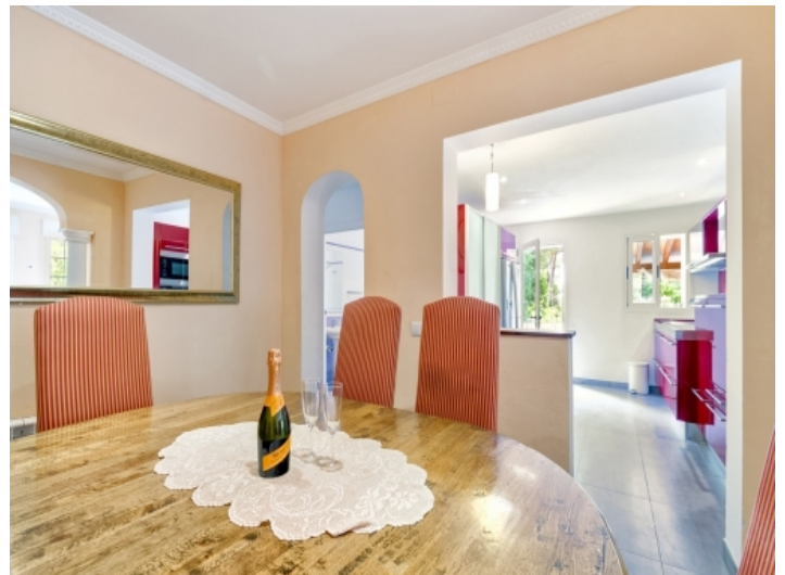
Friendly dining area with open kitchen