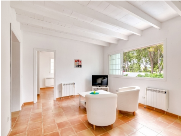
Further living area on the upper floor