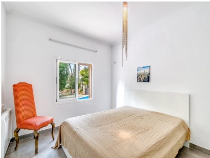
Bedroom with views to the outside area