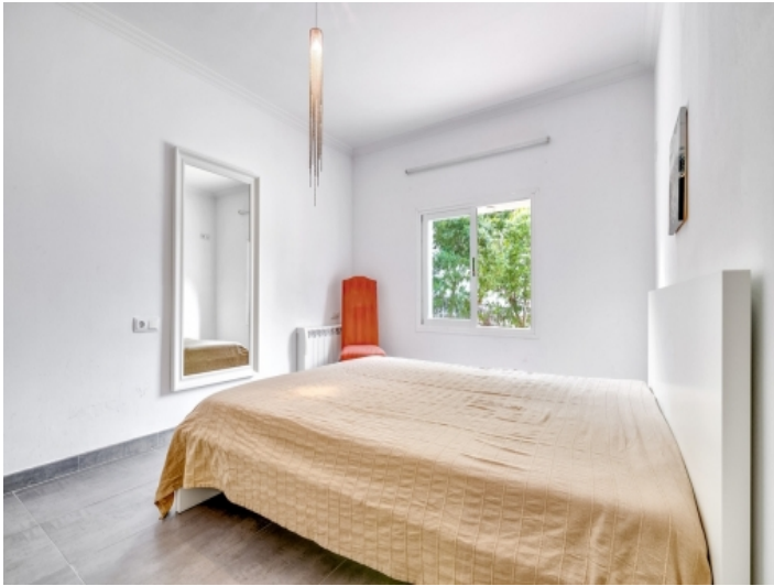
Double-bedroom with natural light