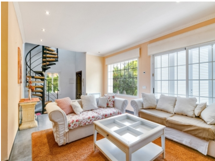
Living area with large windows and staircase which leads to