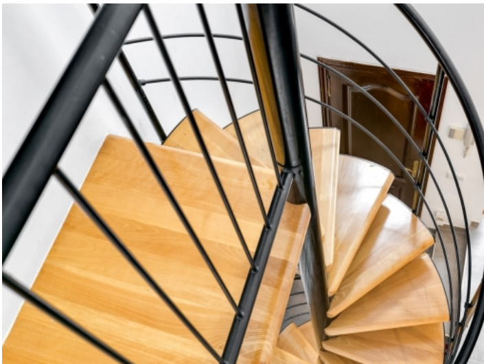
Spiral staircase which leads to the ground floor