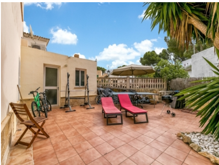
Large sun terrace