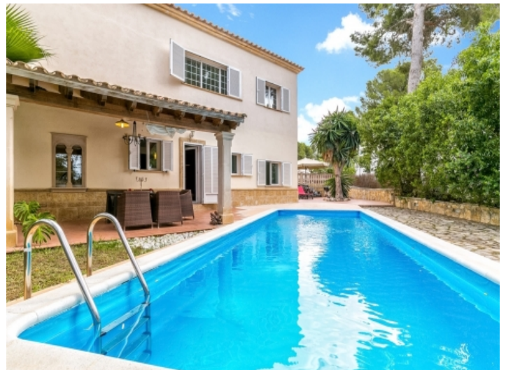
Idyllic pool area with terrace