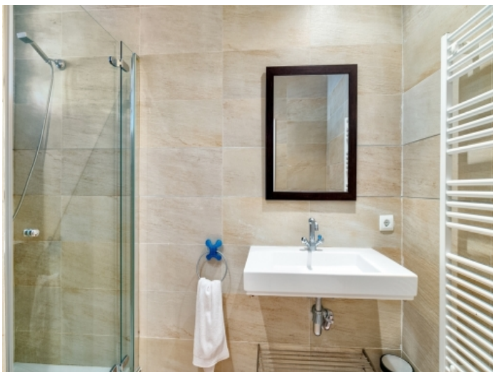
Bathroom with shower and heating