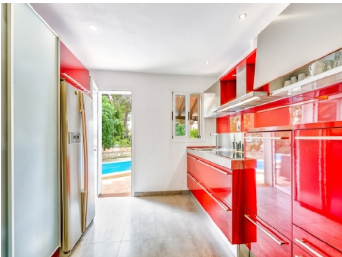
Modern kitchen with terrace access