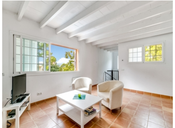
The light-flooded house as a living space of 192 sqm