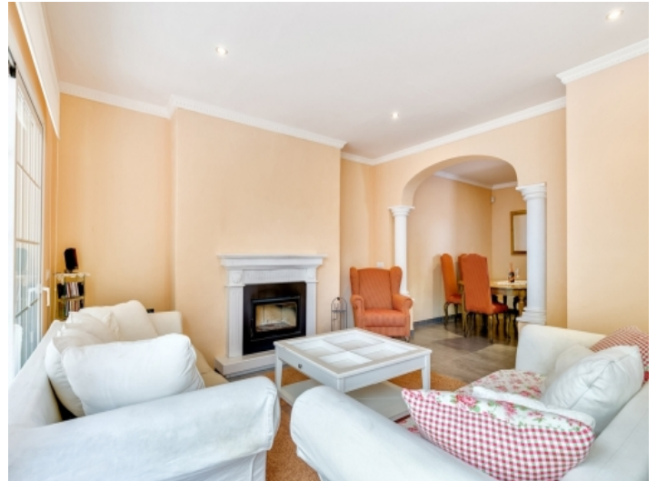
Cosy living area with fireplace