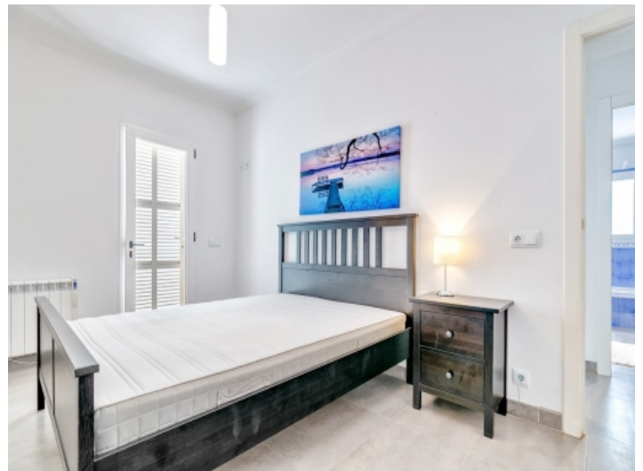
One of four bedrooms with heating