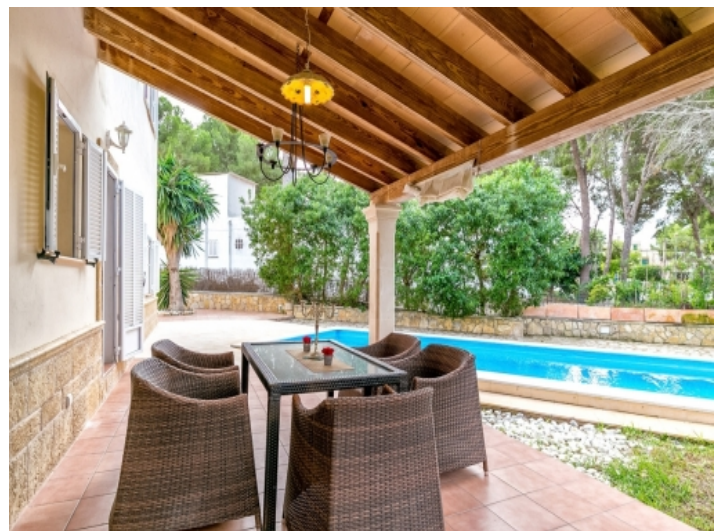
Lovely, covered terrace with dining area