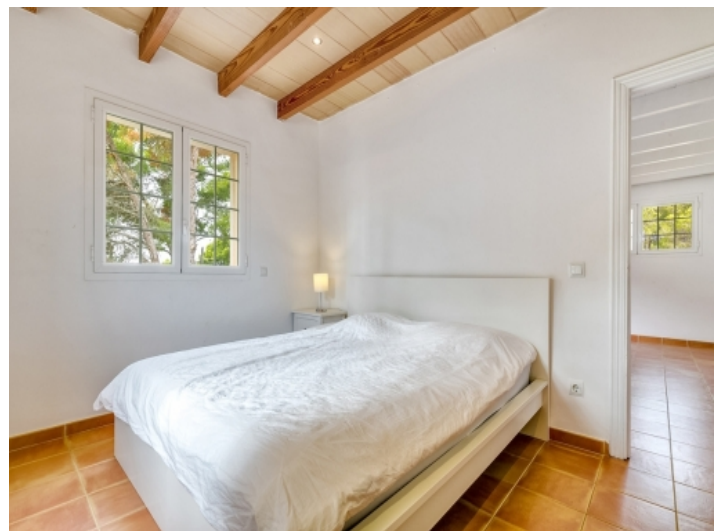
Double-bedroom with wooden ceiling beams