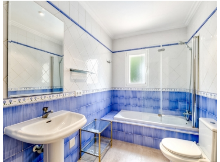
Blue bathroom with bathtub