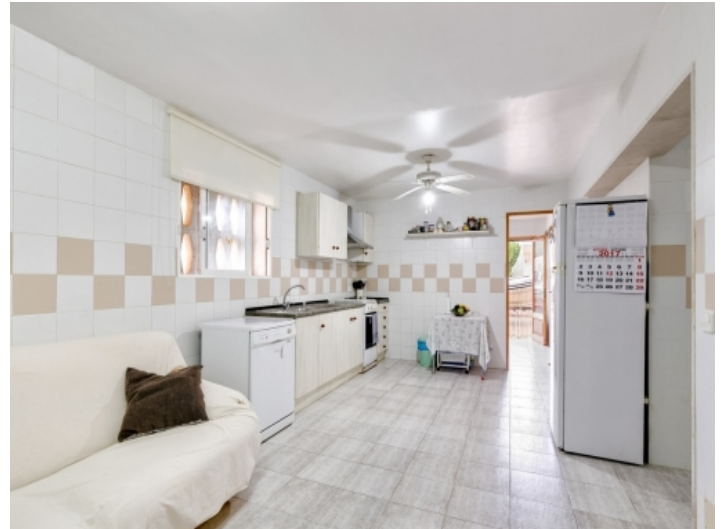
Second, fully equipped kitchen