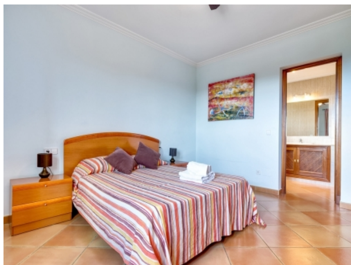
Double bedroom with bathroom en suite