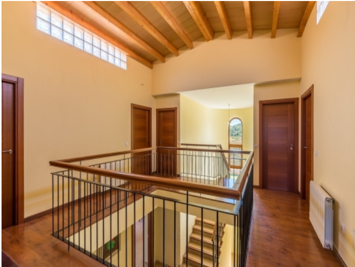
Gallery on the upper floor