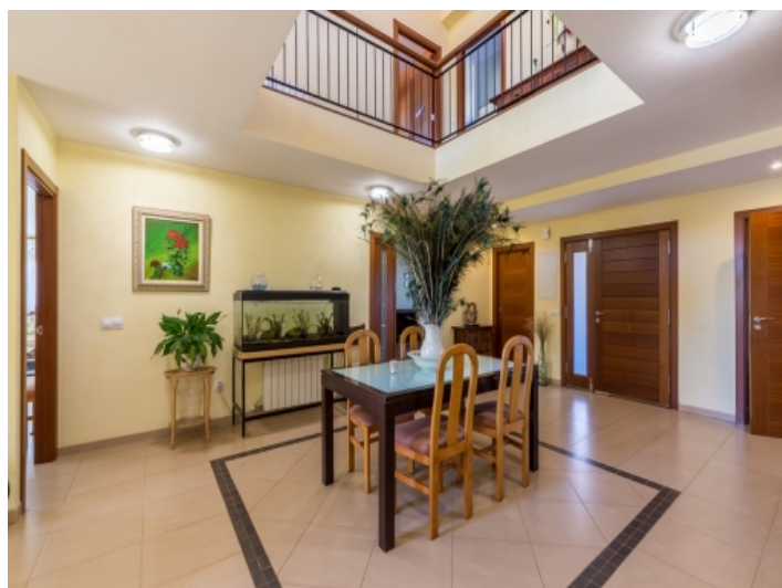
Dining area with gallery