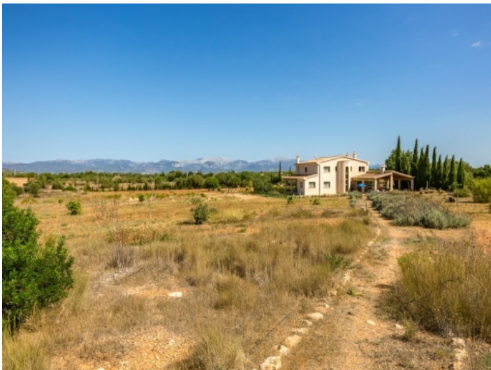
Views over the plot in Algaida