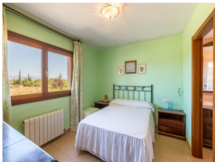
Bedroom with heating