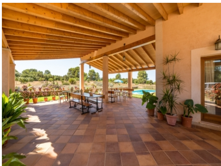
Covered terrace with dining area