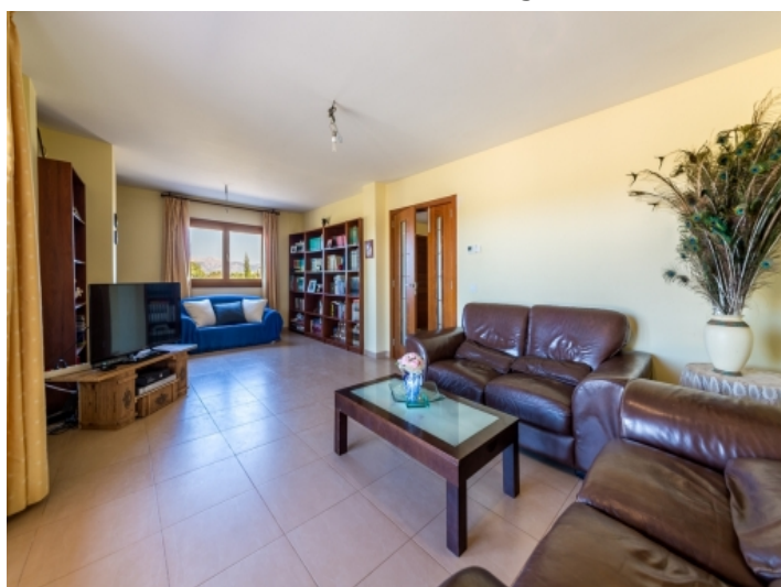
Cosy living area