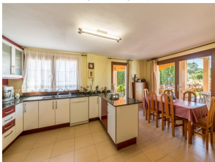
Fully equipped kitchen with dining area