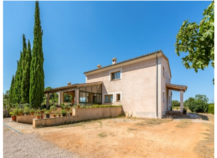
Views to the backside from the finca