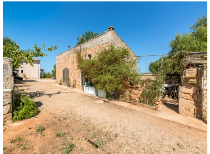
Spacious plot with finca