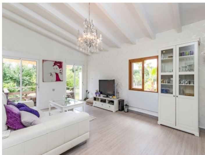
Beautiful living area