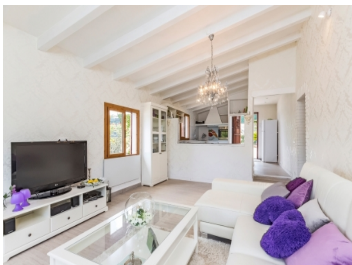
Modern living area