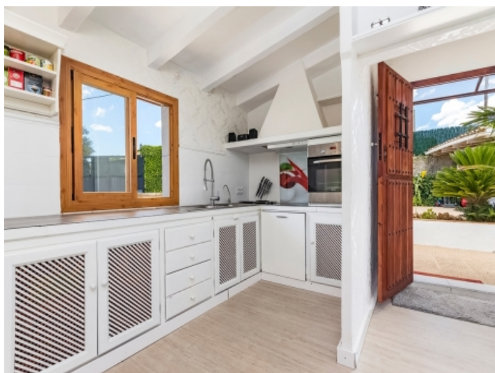
Kitchen and entrance