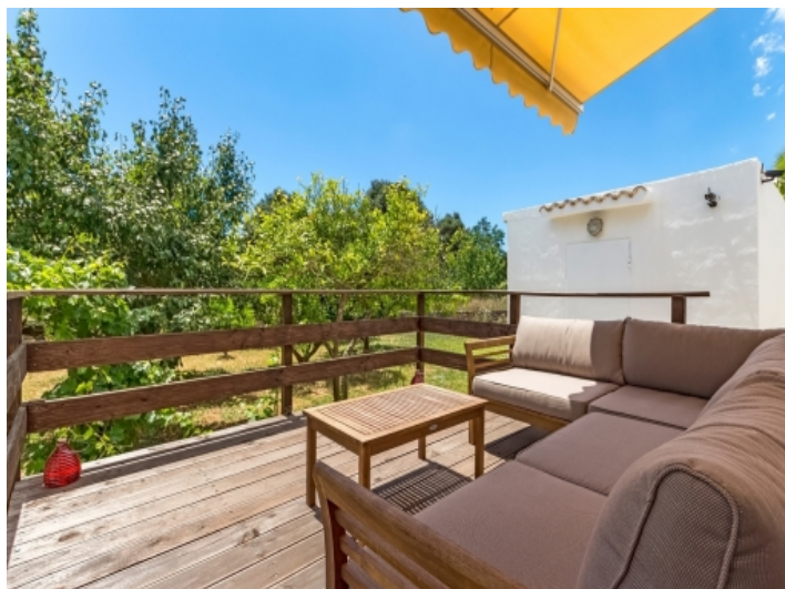
Lounge area on the great terrace