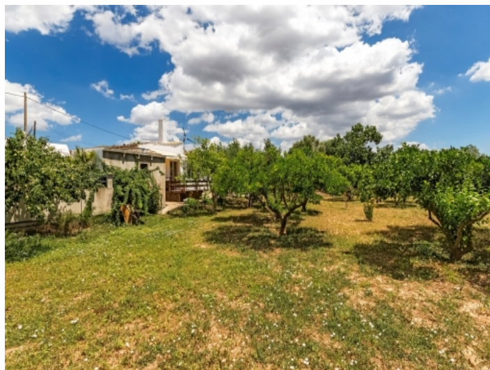
Plot of 2.000 sqm