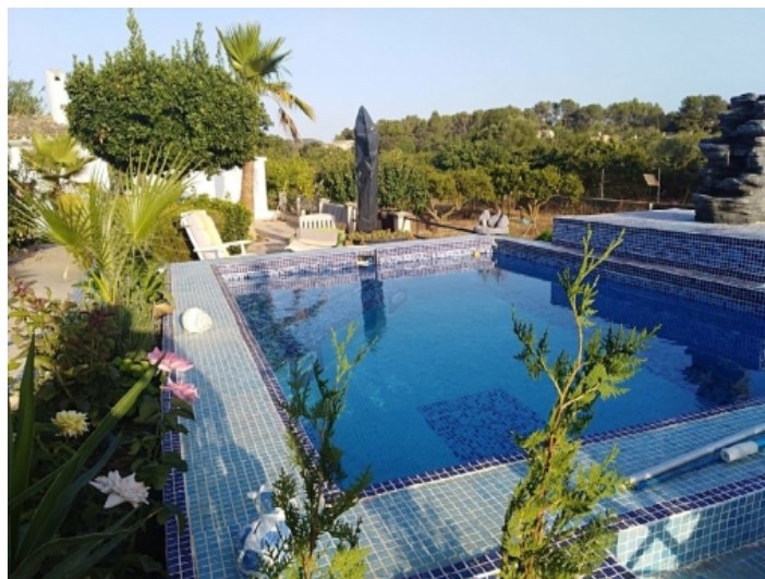
Attractive pool area