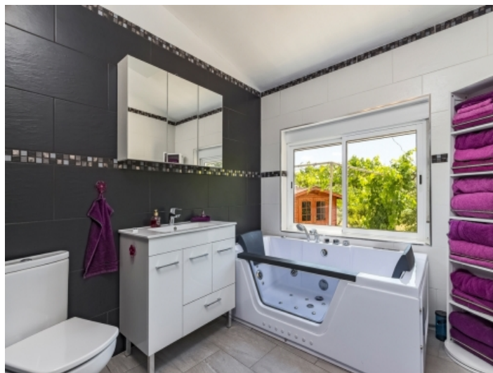
Bathroom with luxurious bathtub