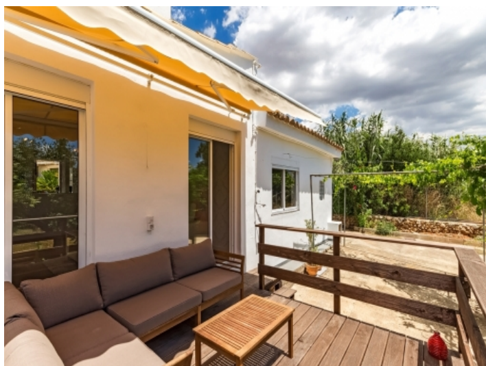
Nice wooden terrace