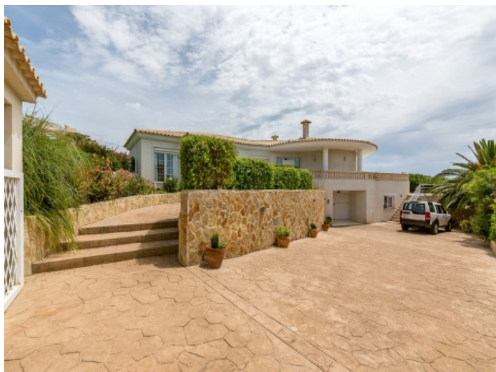
Fantastic outdoor area