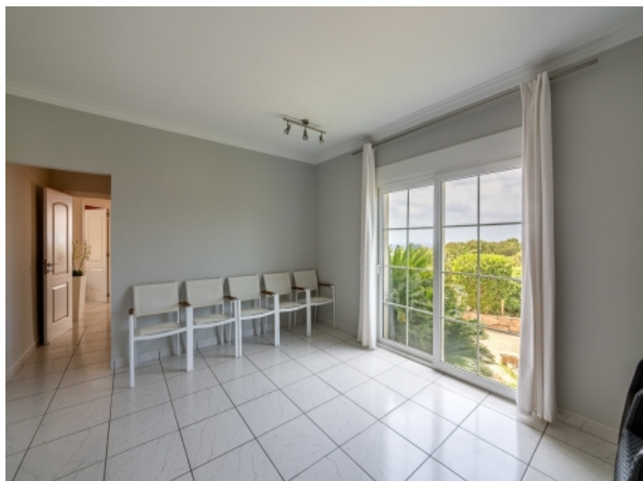
Bedroom with panoramic windows