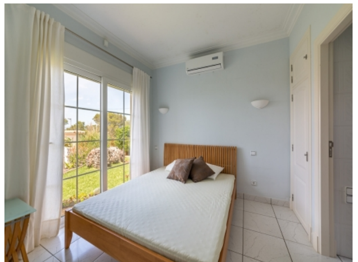
Bedroom with air condition