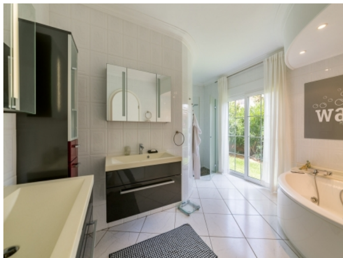
Bright bathroom with bathtub