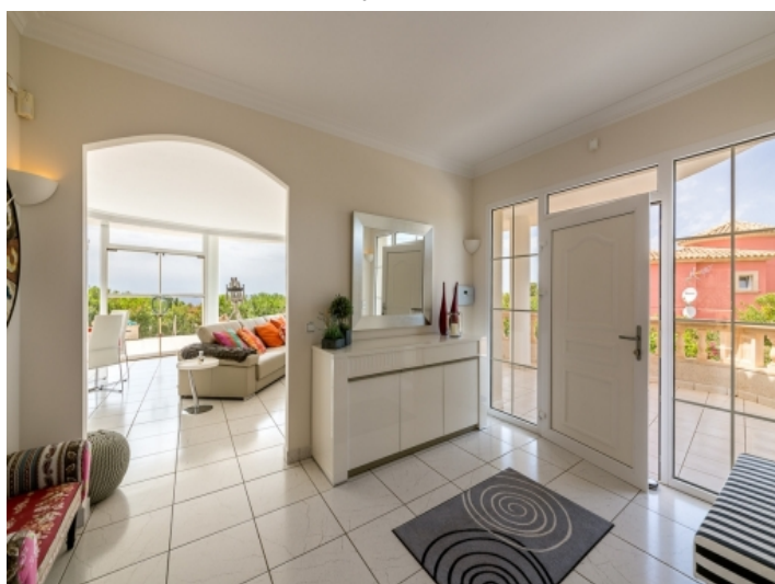
Entrance of the villa