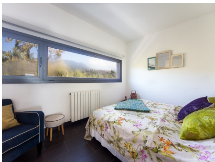
Bedroom with heating