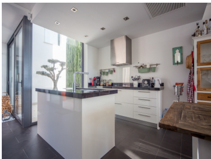
Kitchen with patio views