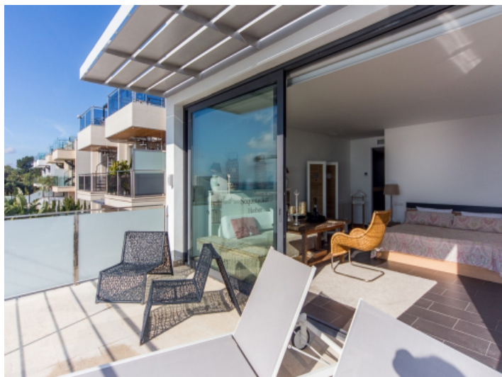
Views from the terrace to the living area