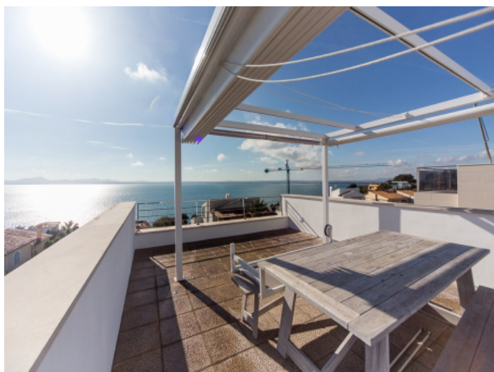
Roof terrace with fantastic sea views