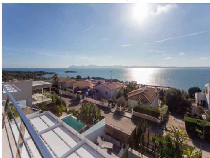
Gorgeous mediterranean sea views