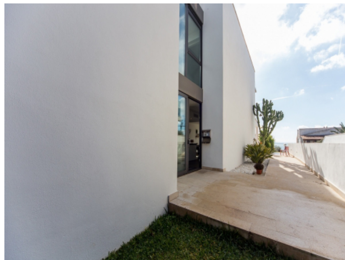
Entrance from the villa