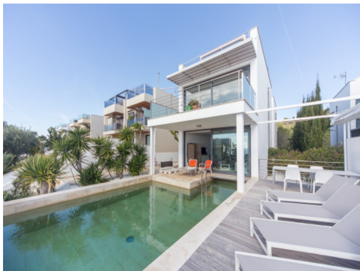
Pool with chill-out area