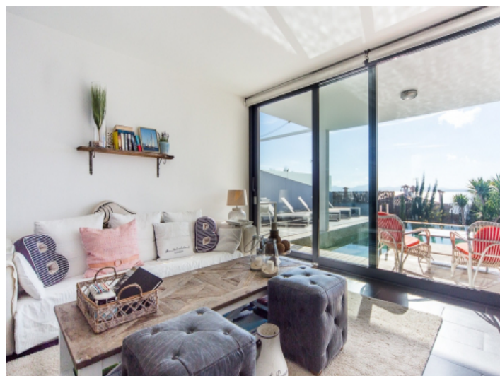
Living area with terrace