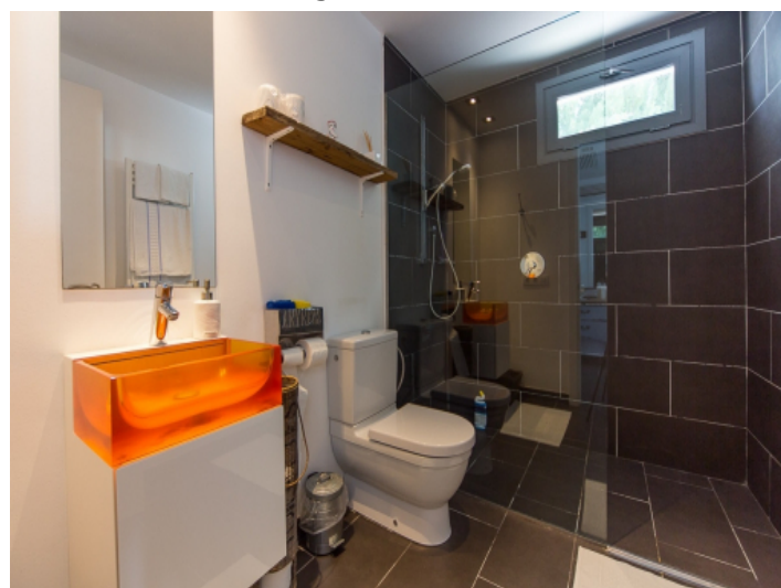
Bathroom with shower and daylight