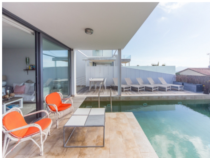
Lounge area on the terrace