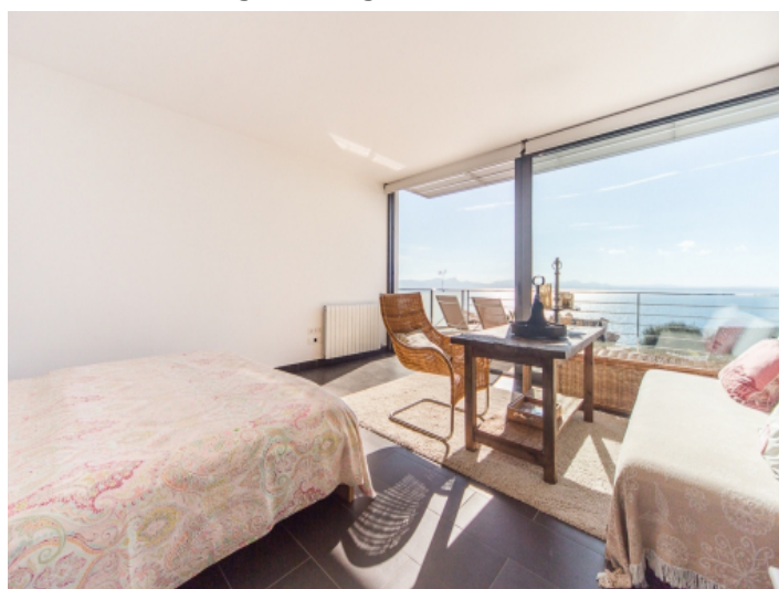
Light flooded bedroom