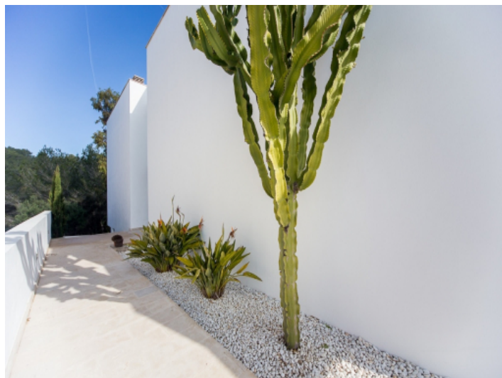
Small way surrounds the villa