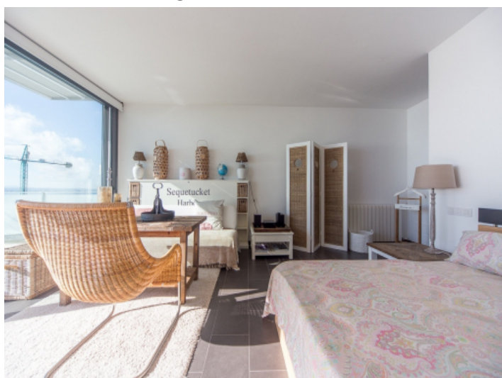
Master bedroom with panoramic windows