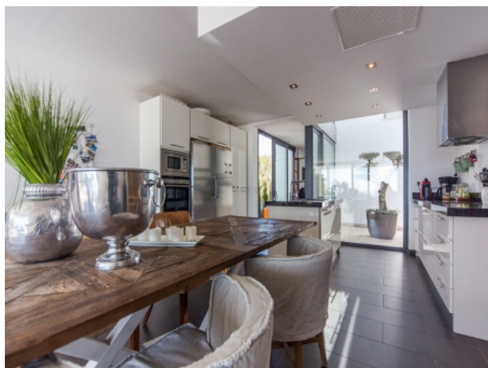
Elegant dining area with kitchen