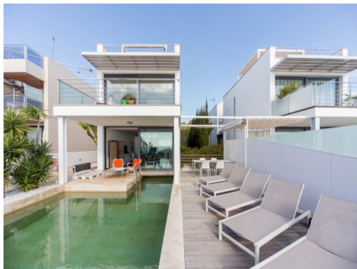
Views from the pool to the villa