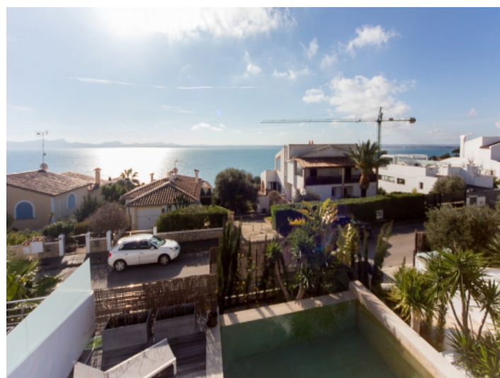
Impressive sea views