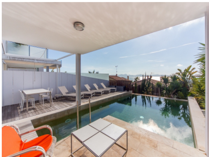
Covered terrace with pool views