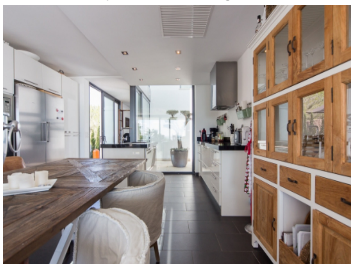
Dining area with kitchen views