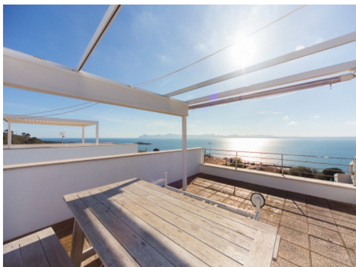
Dining area on the roof terrace