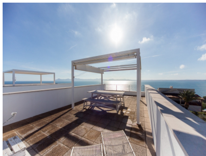
Spacious roof terrace