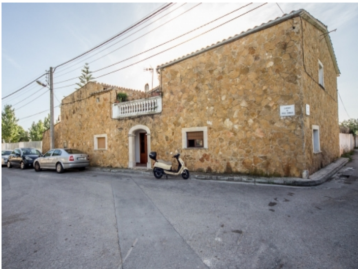
Front from the finca