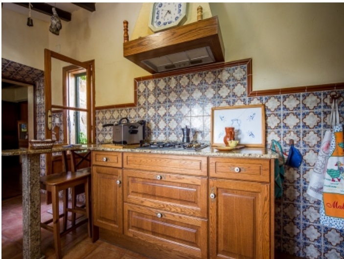
Other views to the kitchen