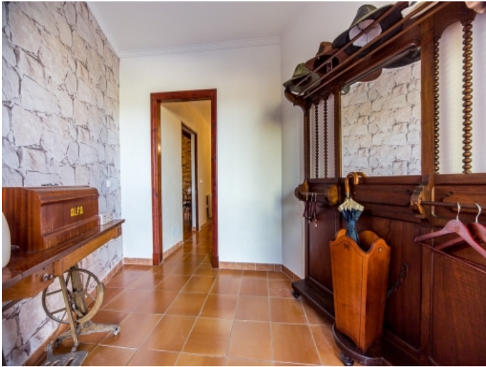
Entrance from the finca