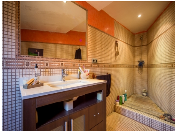
Bathroom with a small shower