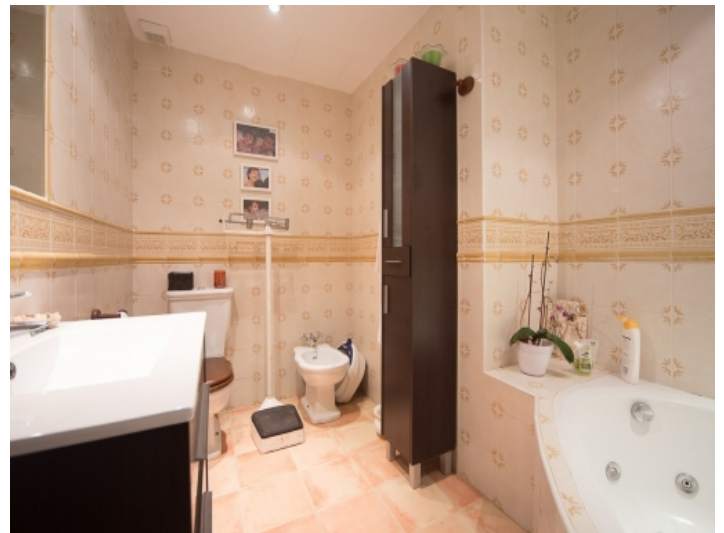
Modern bathroom with shower