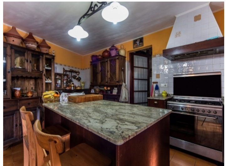
Kitchen with bar