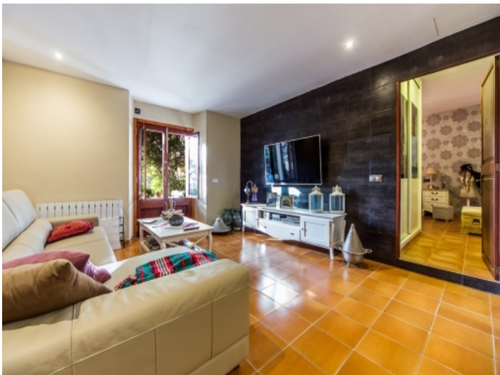
Living area with heating