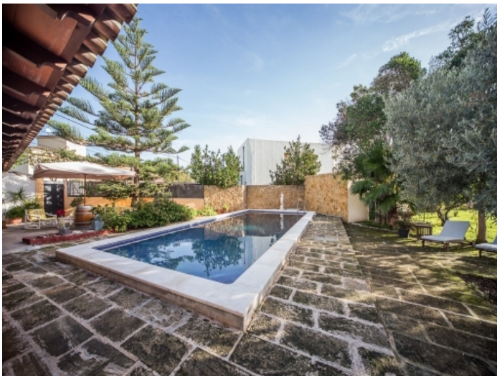
Terrace surrounds the pool