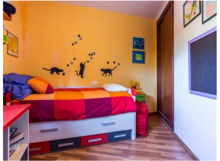
Bright children's room