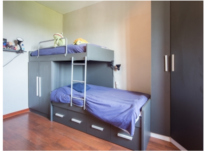
Children's room with two bedrooms