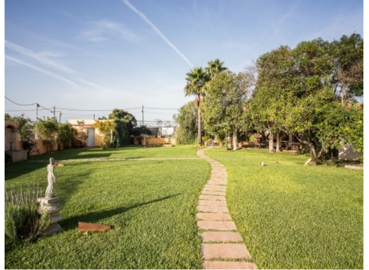
Way leads through the garden