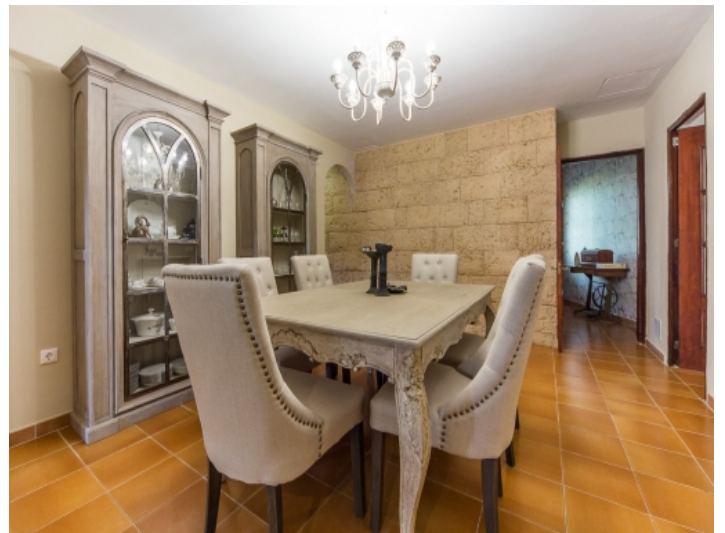
Elegant dining area