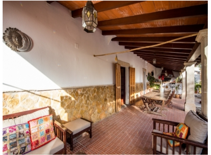
Covered terrace with lounge area