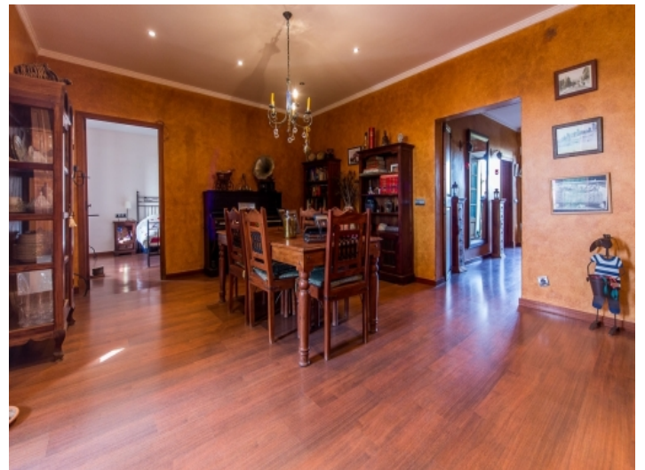
An other dining area