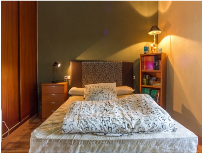
Bedroom with built-in wardrobe