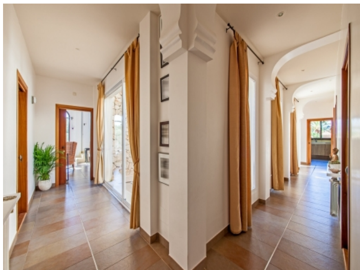
Corredor from the villa