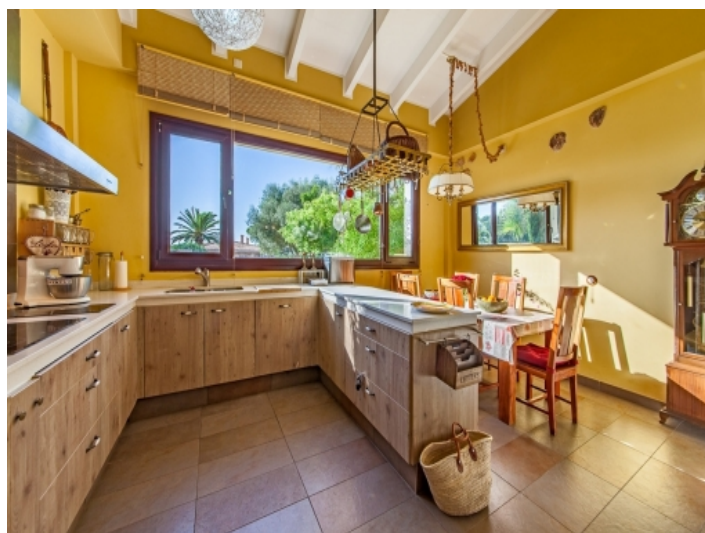
Light flooded kitchen