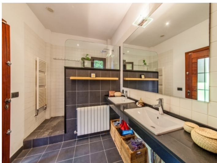
Modern bathroom with shower