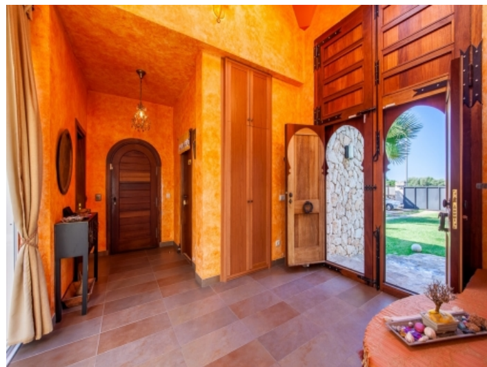
Entrance from the villa