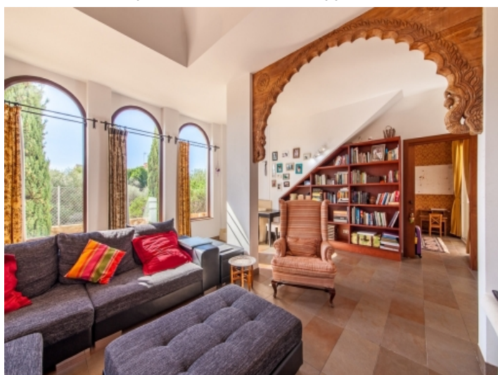
Open living room