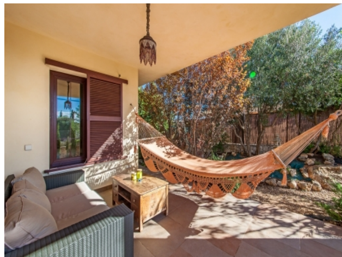
Lounge area on the terrace