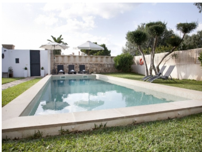
Alternative view of the pool