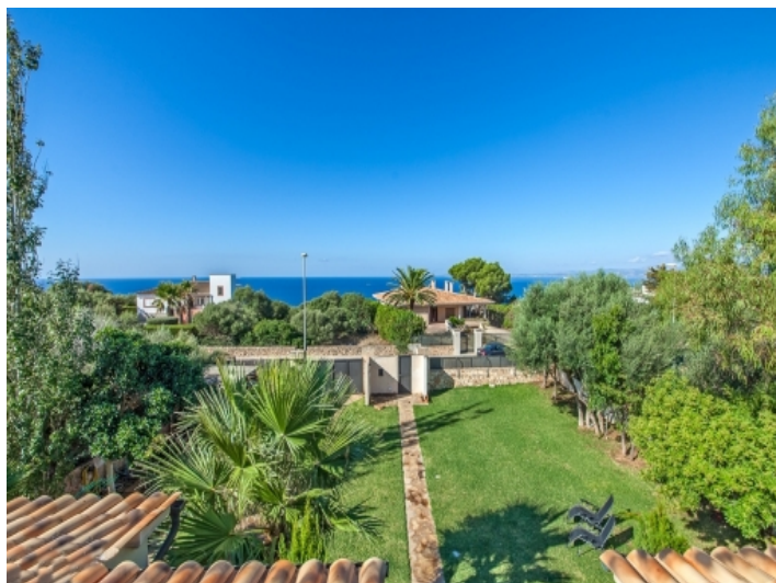
Unique sea views from the upper floor