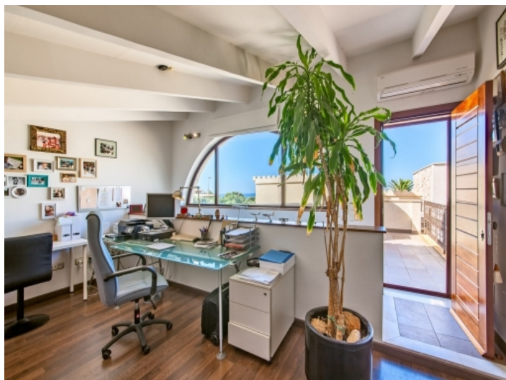
Bright office with balcony