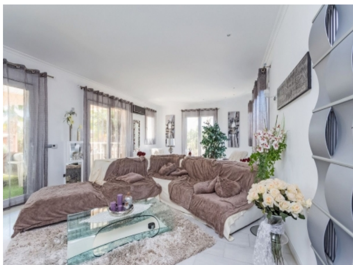
Light flooded living area