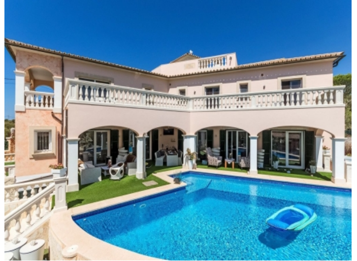
Beautiful pool area