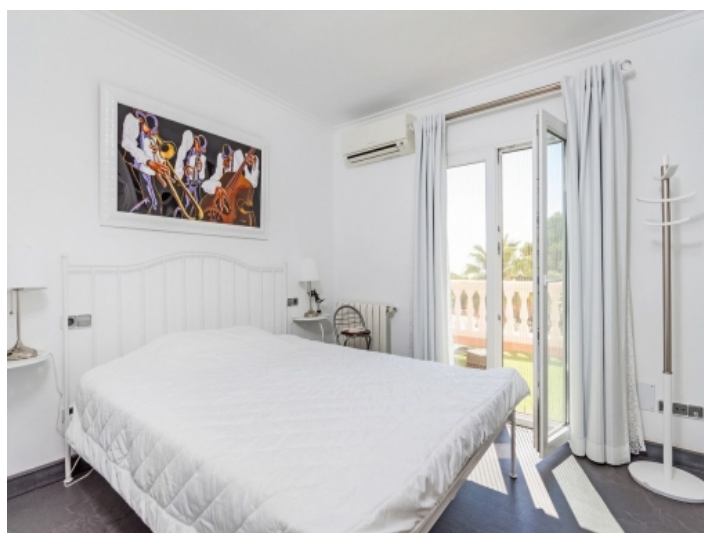
Bedroom with panoramic windows