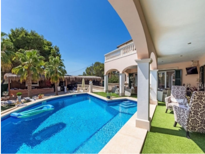
Views from covered terrace to the pool area