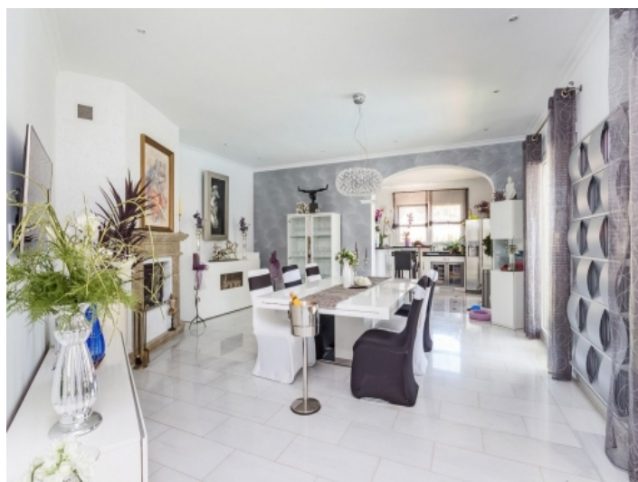
Impressive dining area