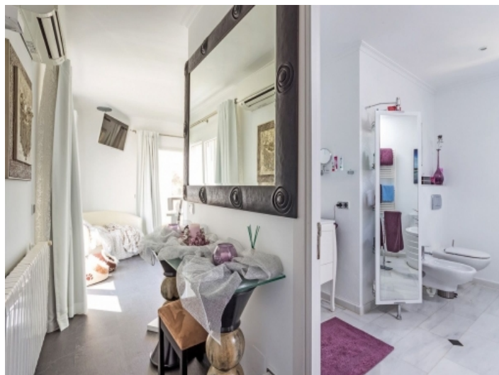
Views to the bathroom en suite from the bedroom