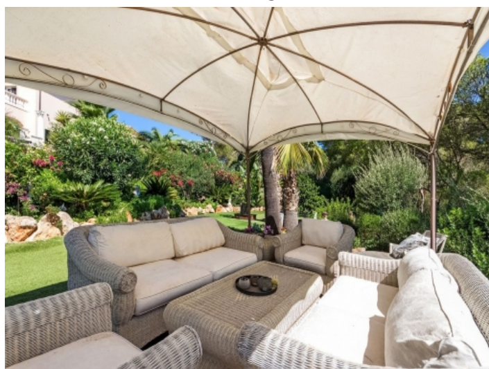
Covered lounge area