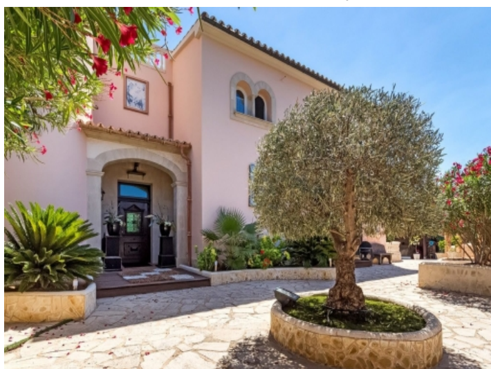
Entrance from the villa