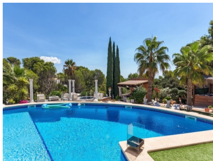
Mallorquin pool area