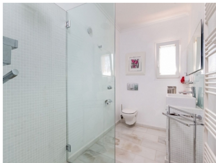
Bathroom with daylight and shower