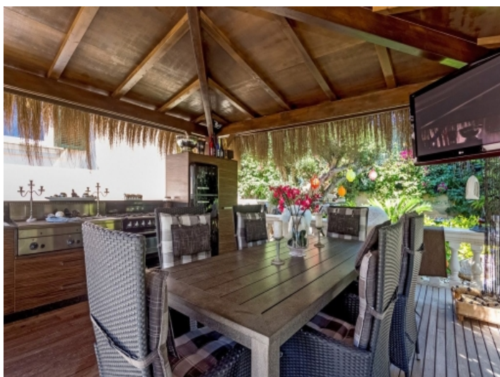
Fantastic summer kitchen