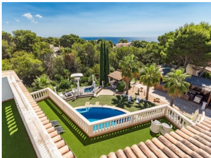
Views from the villa over the plot