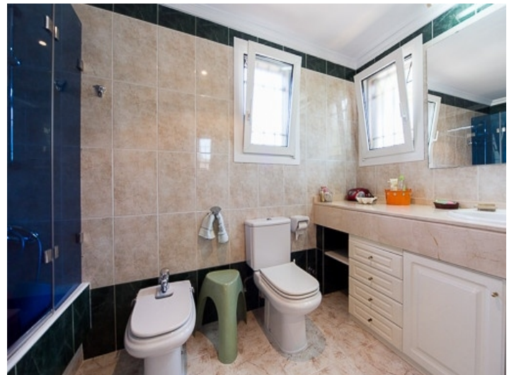
One of three bathrooms