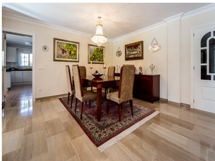
Elegant dining area