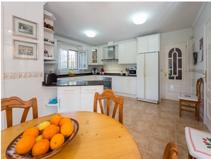
Dining area in the kitchen