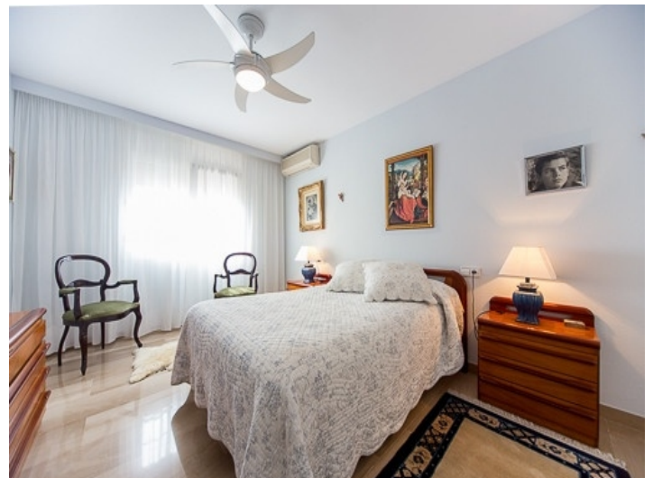
Spacious double bedroom