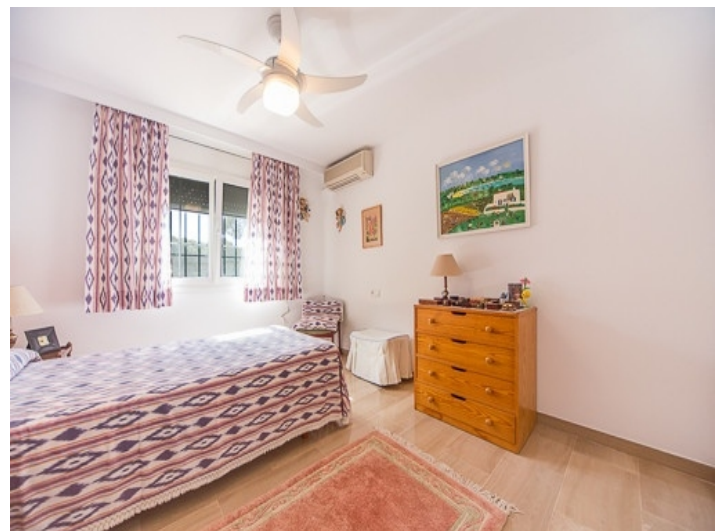
One of six bedrooms