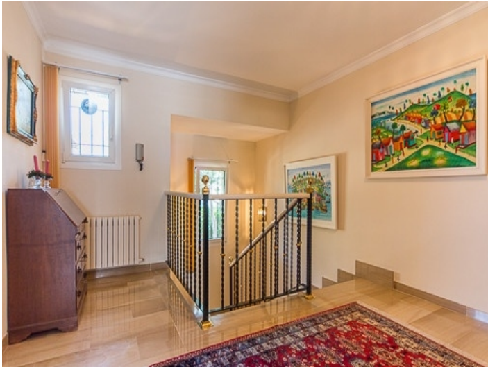
Corridor on the upper floor