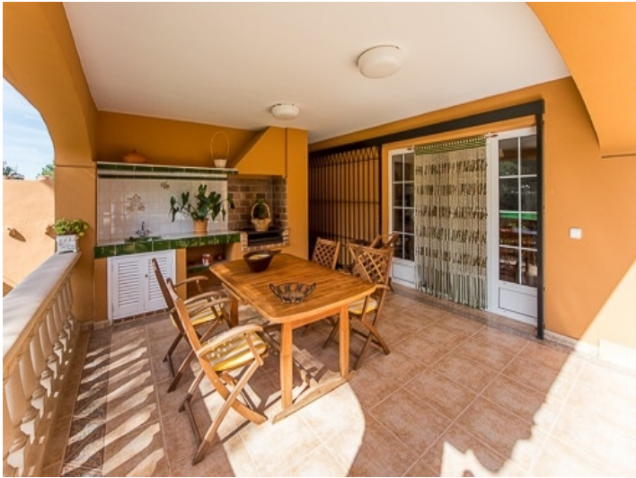
Terrace with barbecue area