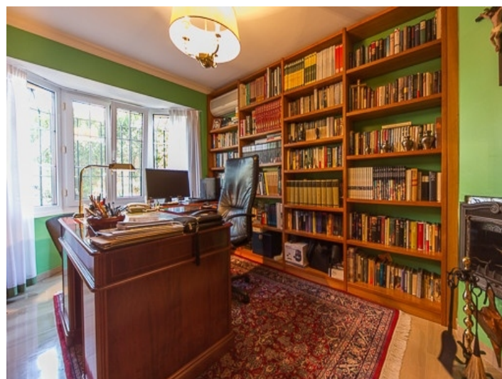
Office on the ground floor