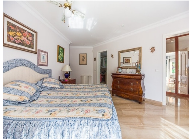
Bright master bedroom with bathroom en suite