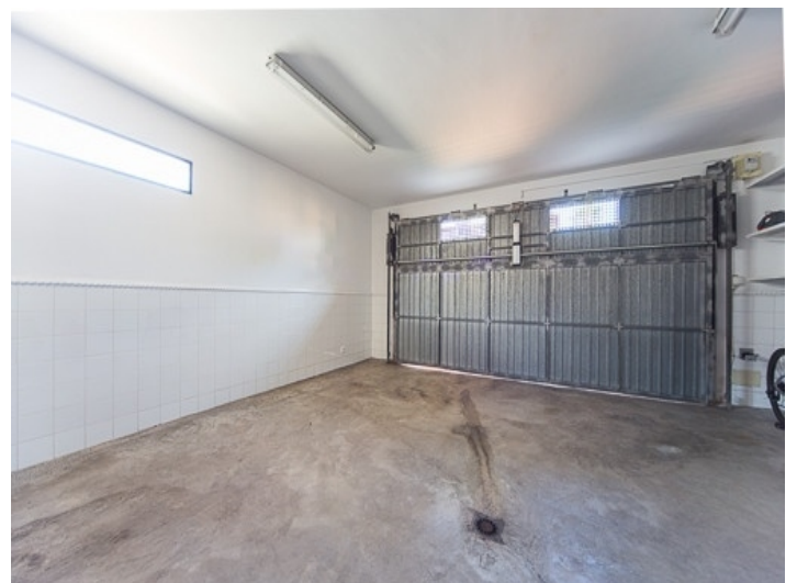
Garage for max. 2 cars