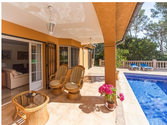
Sunny terraces beside the pool