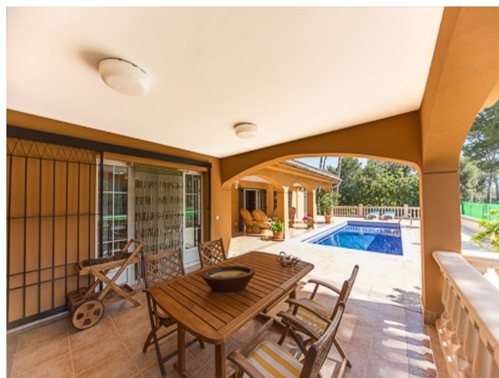
Covered terrace with dining area