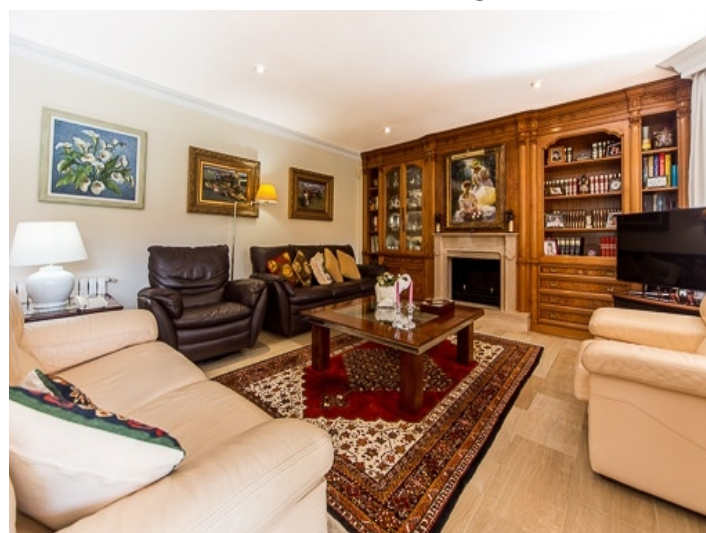
Cosy living room with fireplace