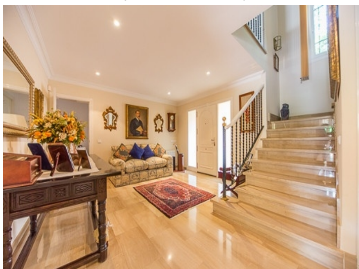
Inviting entrance area