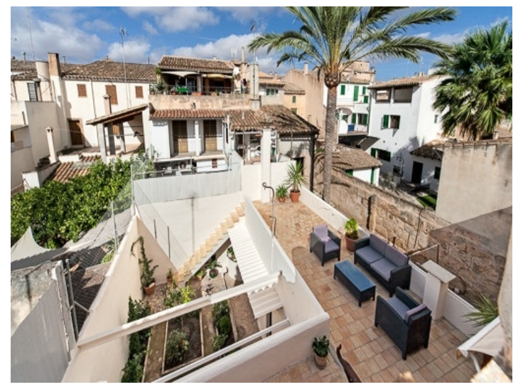
View of the fantastic patio