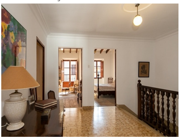
Corridor of the upper floor