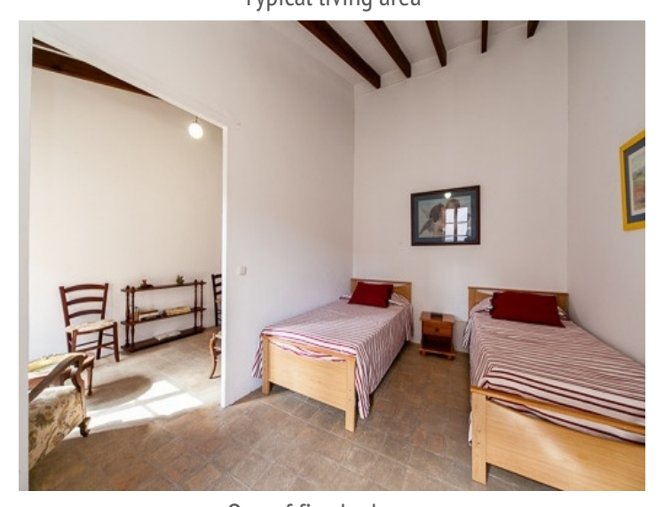
One of five bedrooms