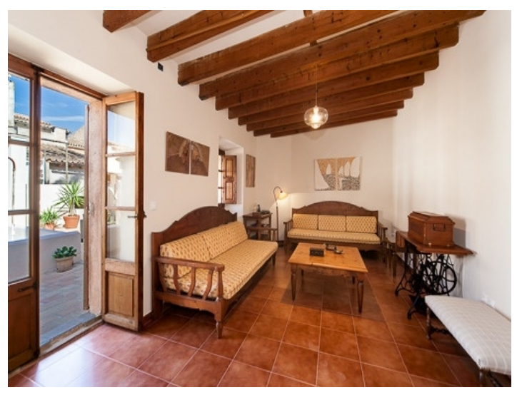
Living area with access to terrace