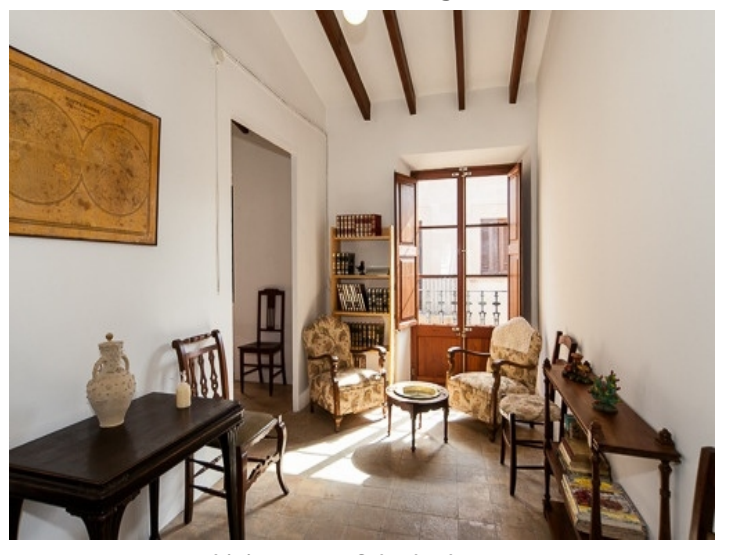
Living area of the bedroom