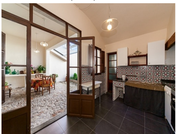
Traditional kitchen with access to the patio