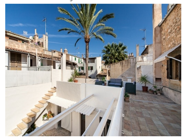
Terrace with lounge area