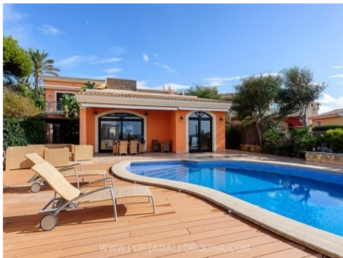
Exterior view of the villa with pool