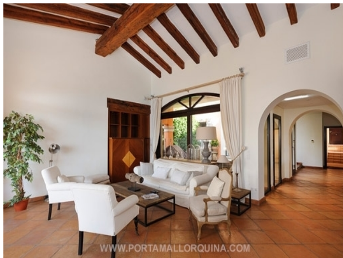
Living area with wooden ceiling beams