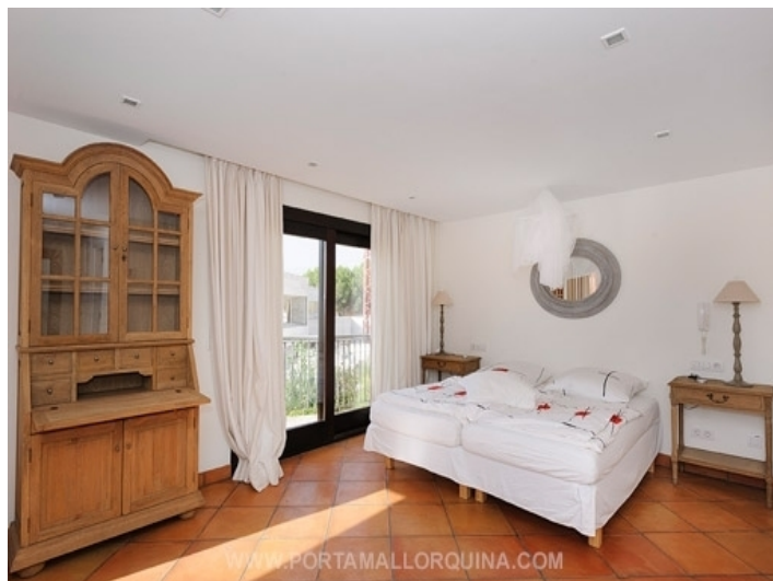
One of 5 bedroom