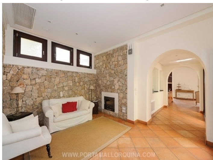
Lounge area with fireplace