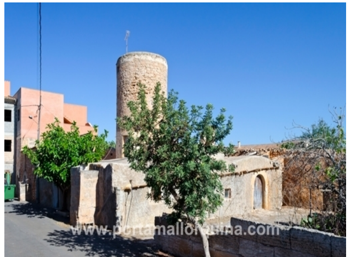
View of the old mill