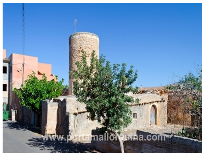
View of the old mill